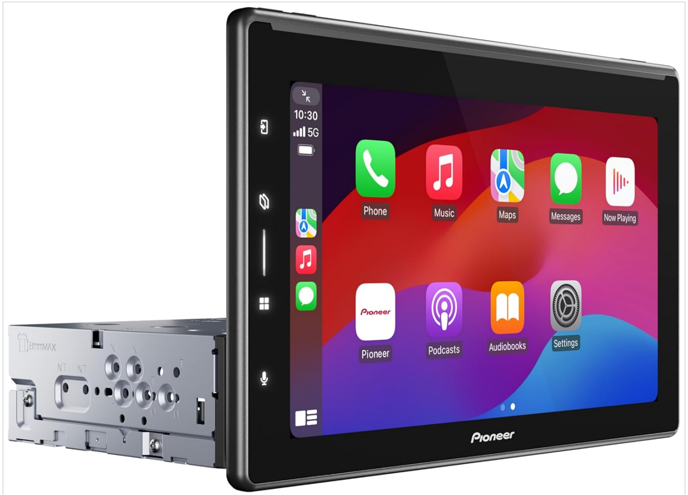
Figure 4.1: Side view of the DMH-WT6000NEX, illustrating the single DIN chassis and the adjustable floating display mechanism.

The unit features a unique floating screen design that mounts in front of the radio location. The screen's tilt is adjustable to achieve the optimal viewing angle in your vehicle's dash.