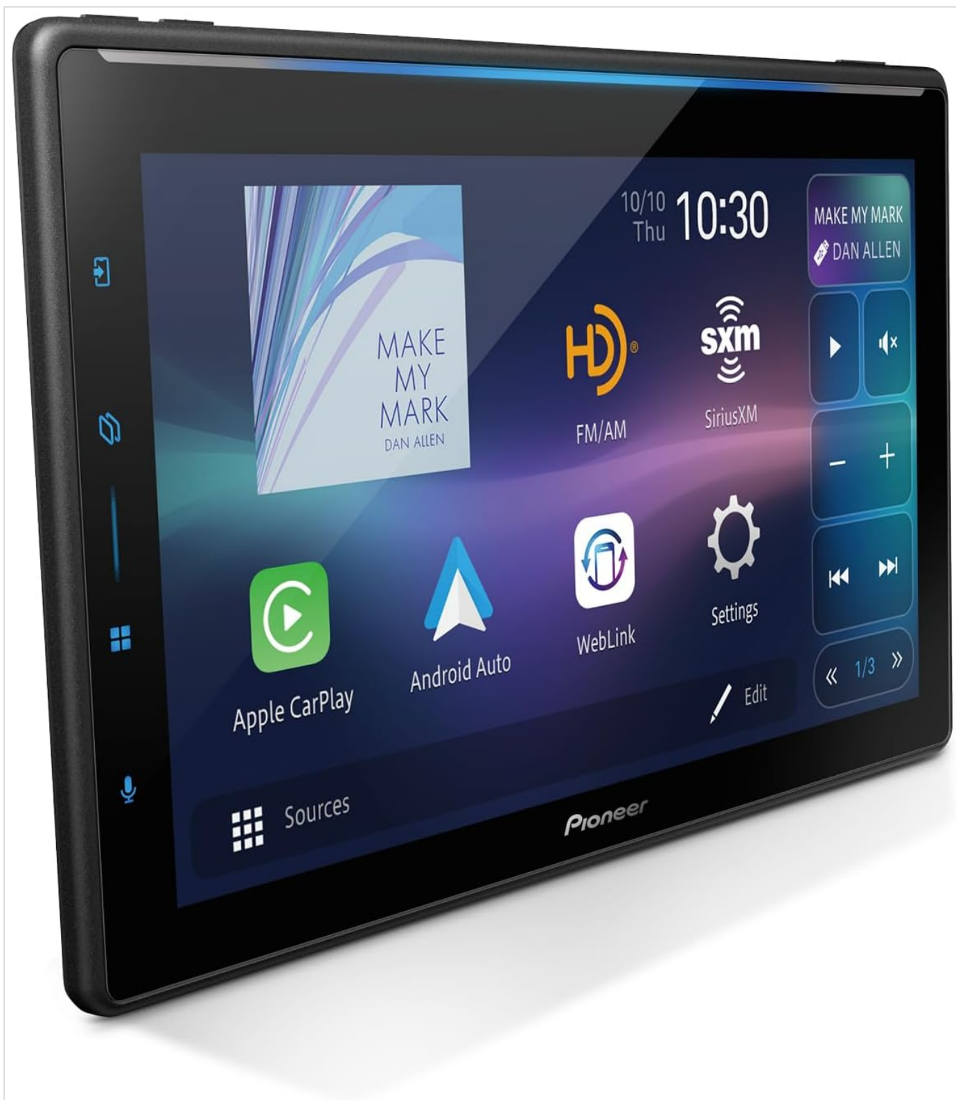
Figure 5.1: The main user interface of the DMH-WT6000NEX, displaying common applications and media playback controls.