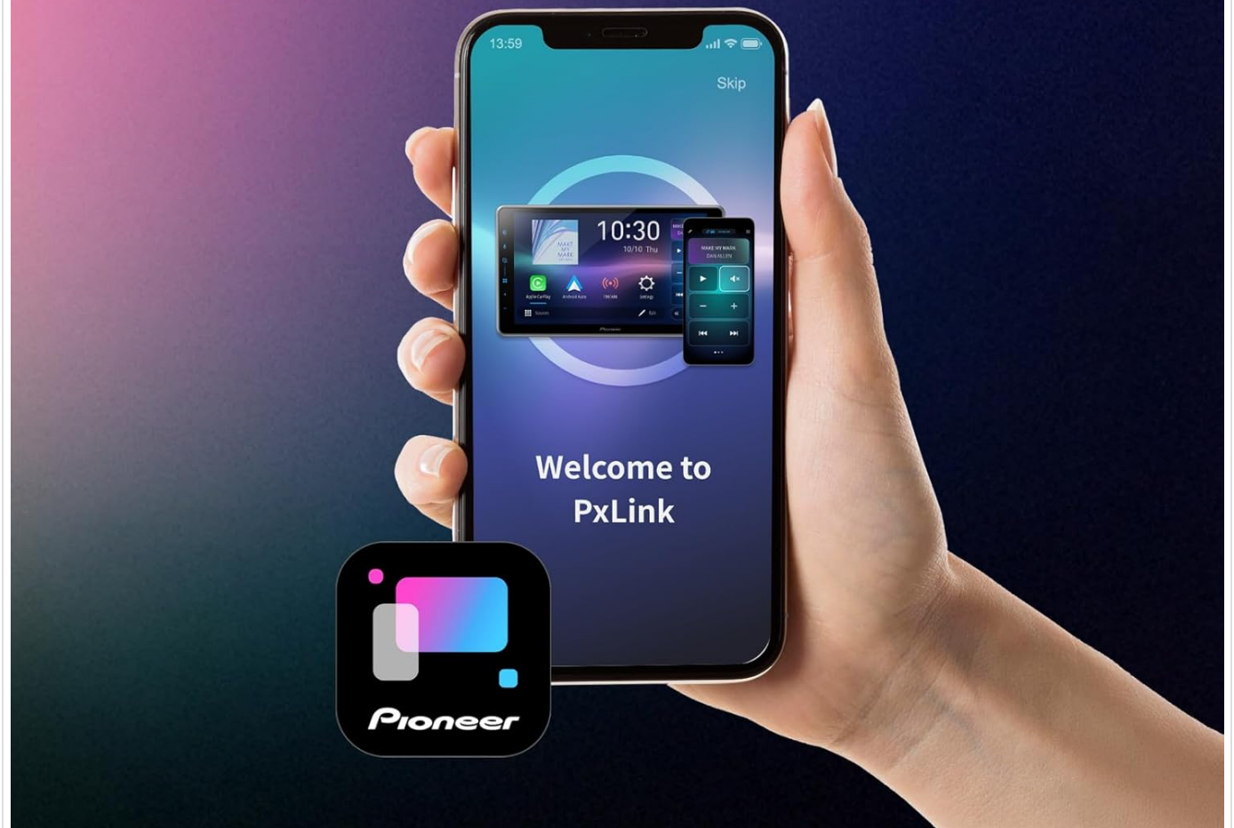
Figure 5.4: The PxLink app interface on a smartphone, demonstrating its capability to expand and customize the receiver's controls.