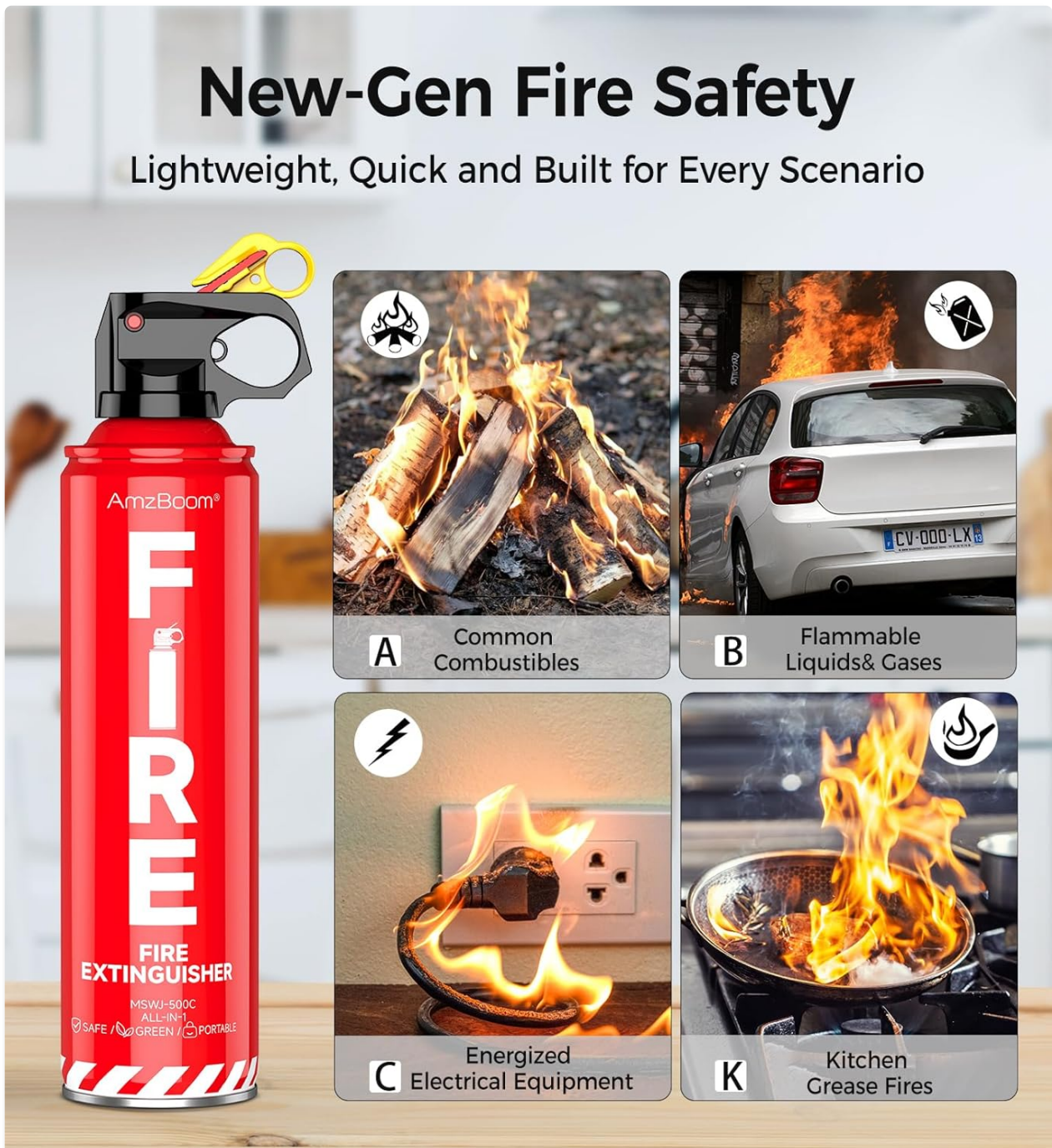
Image 2.1: Visual guide to fire classes A (common combustibles), B (flammable liquids & gases), C (energized electrical equipment), and K (kitchen grease fires).