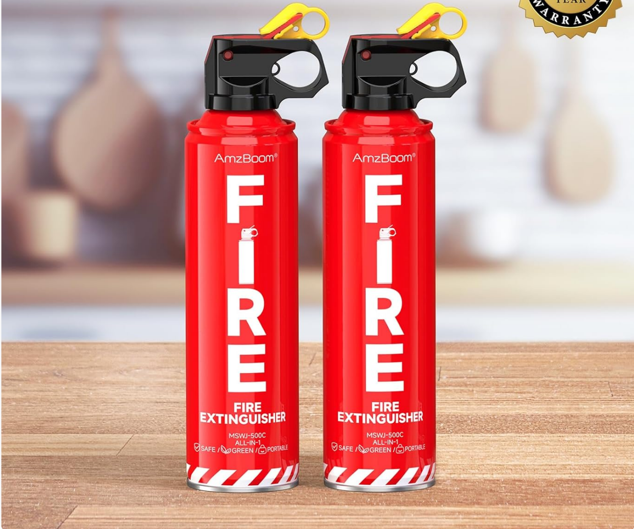
Image 5.1: AmzBoom fire extinguishers emphasizing their 6-year shelf life.