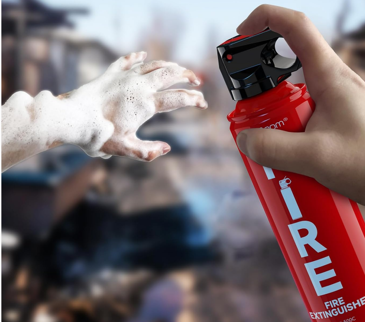
Image 5.2: The non-toxic formula of the AmzBoom fire extinguisher is safe for human contact and the environment.

Safe Ingredients do not Damage and Pollute the Environment and do not Harm the Human Body