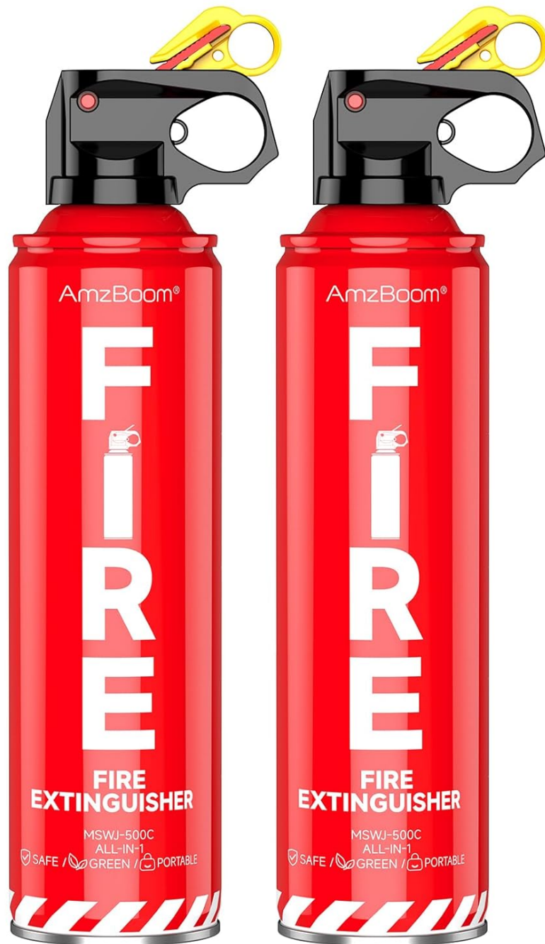
Image 1.1: Two AmzBoom MSWJ-500C compact fire extinguishers, ready for use.