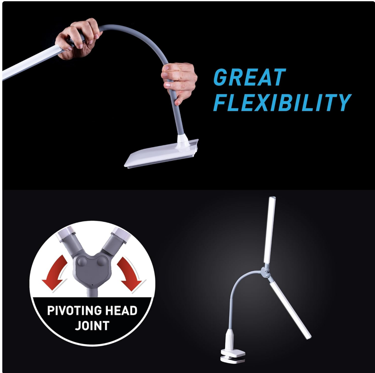
Figure 2: The flexible arm and pivoting head joint allow for versatile light positioning, adapting to various tasks and workspaces.

adjustment of each light source. This allows for wide coverage or focused illumination.