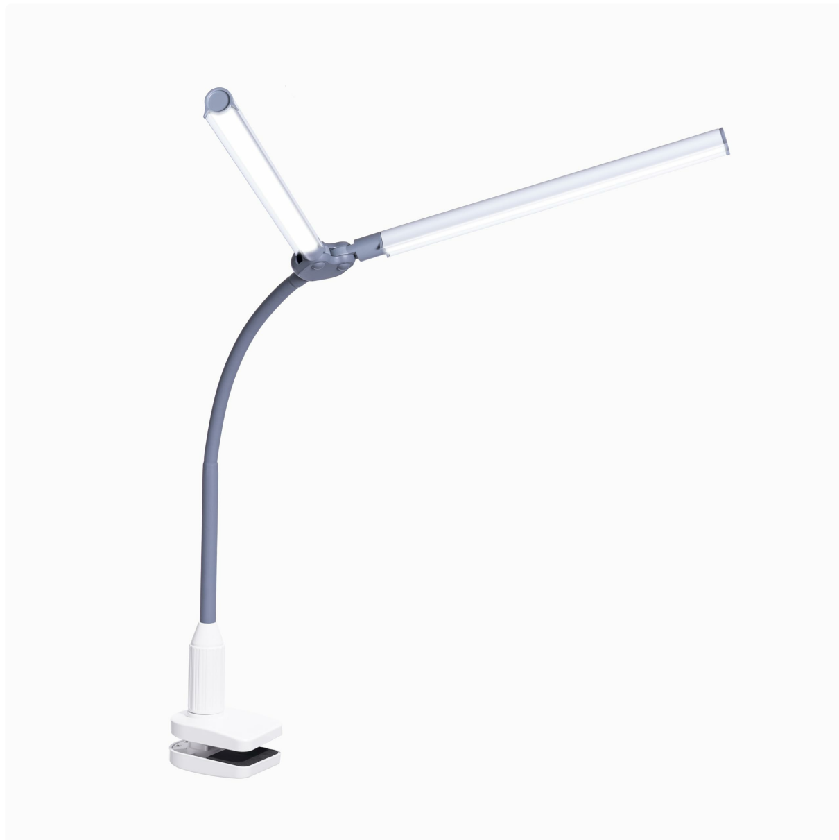
Figure 1: The DuoPro Clamp LED Lamp attached to a desk, showcasing its compact and stable design.

Your browser does not support the video tag.