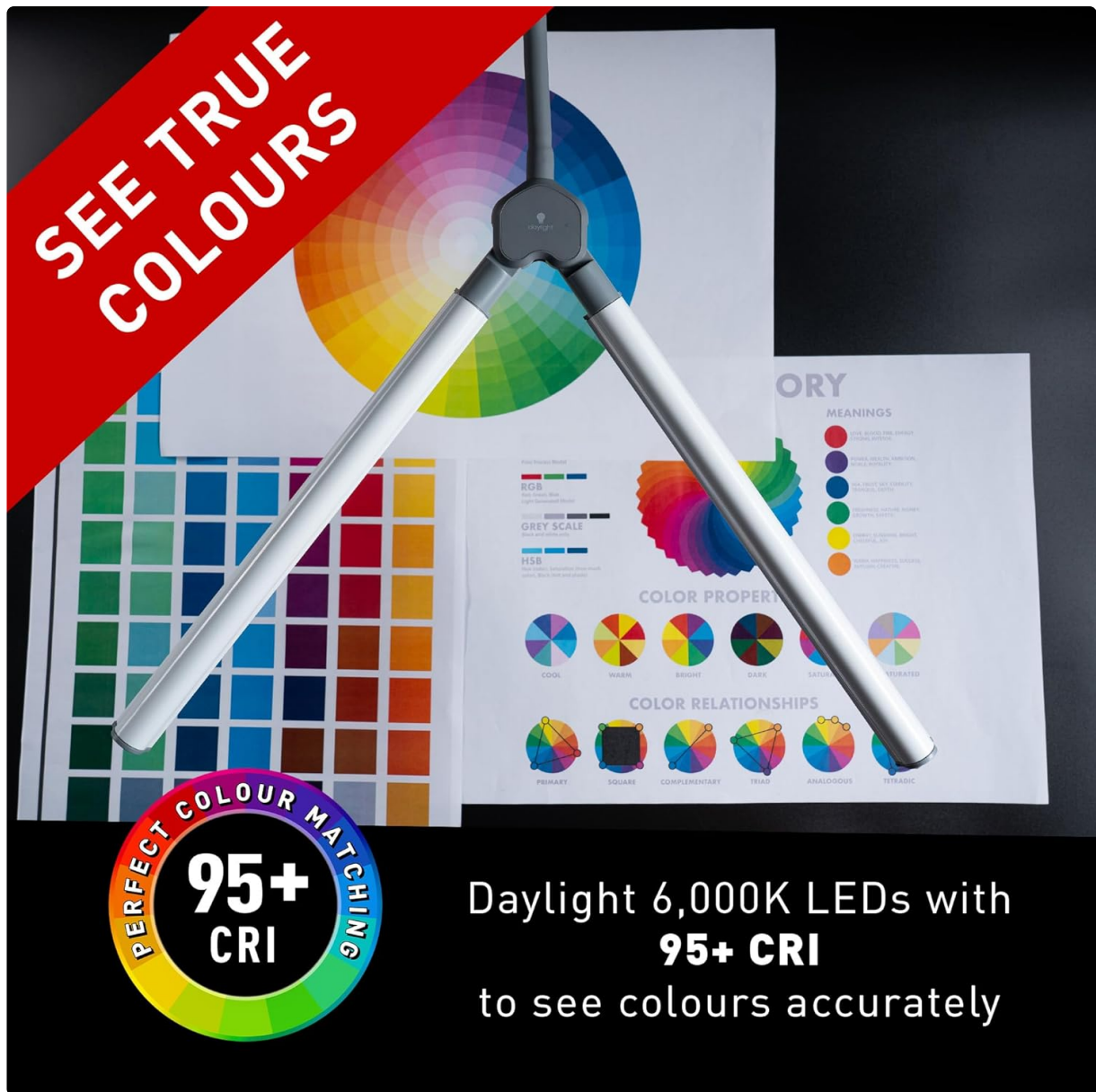
Figure 4: The lamp's 95+ CRI LEDs ensure accurate color perception, vital for detailed work.