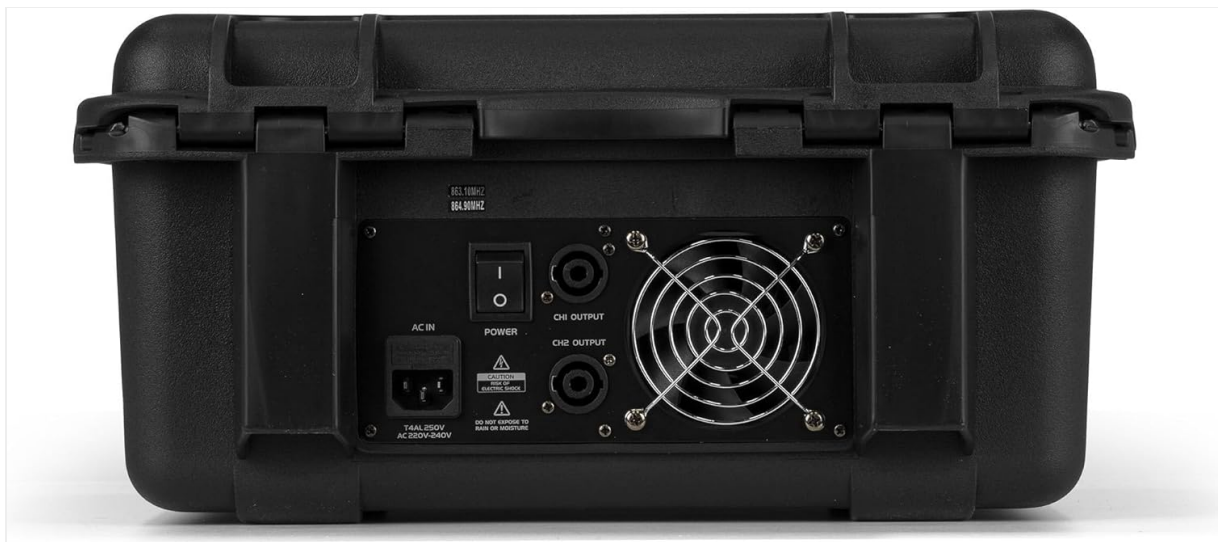
Figure 4: Rear panel of the VMA106 mixer, displaying the AC power input, main power switch, and CH1/CH2 speaker outputs. Safety warnings regarding electric shock and moisture are also visible.