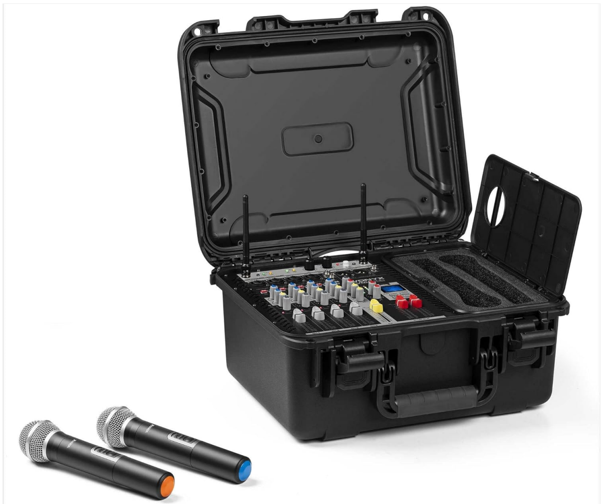
Figure 1: VONYX VMA106 Powered PA Mixer in its durable ABS case, showcasing the mixer unit and the two included wireless microphones.