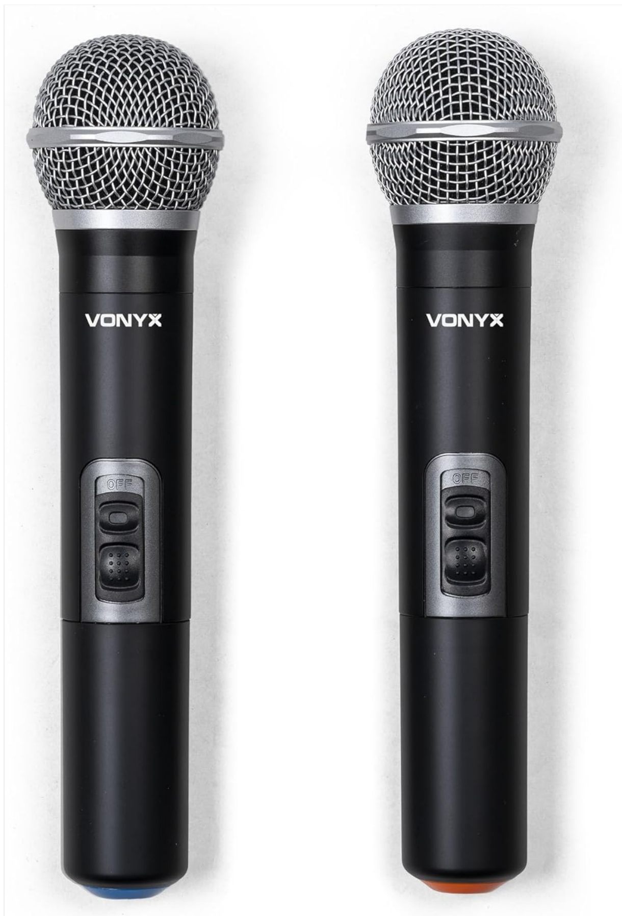
Figure 3: The two UHF wireless handheld microphones included with the VMA106 mixer, featuring power switches and VONYX branding.