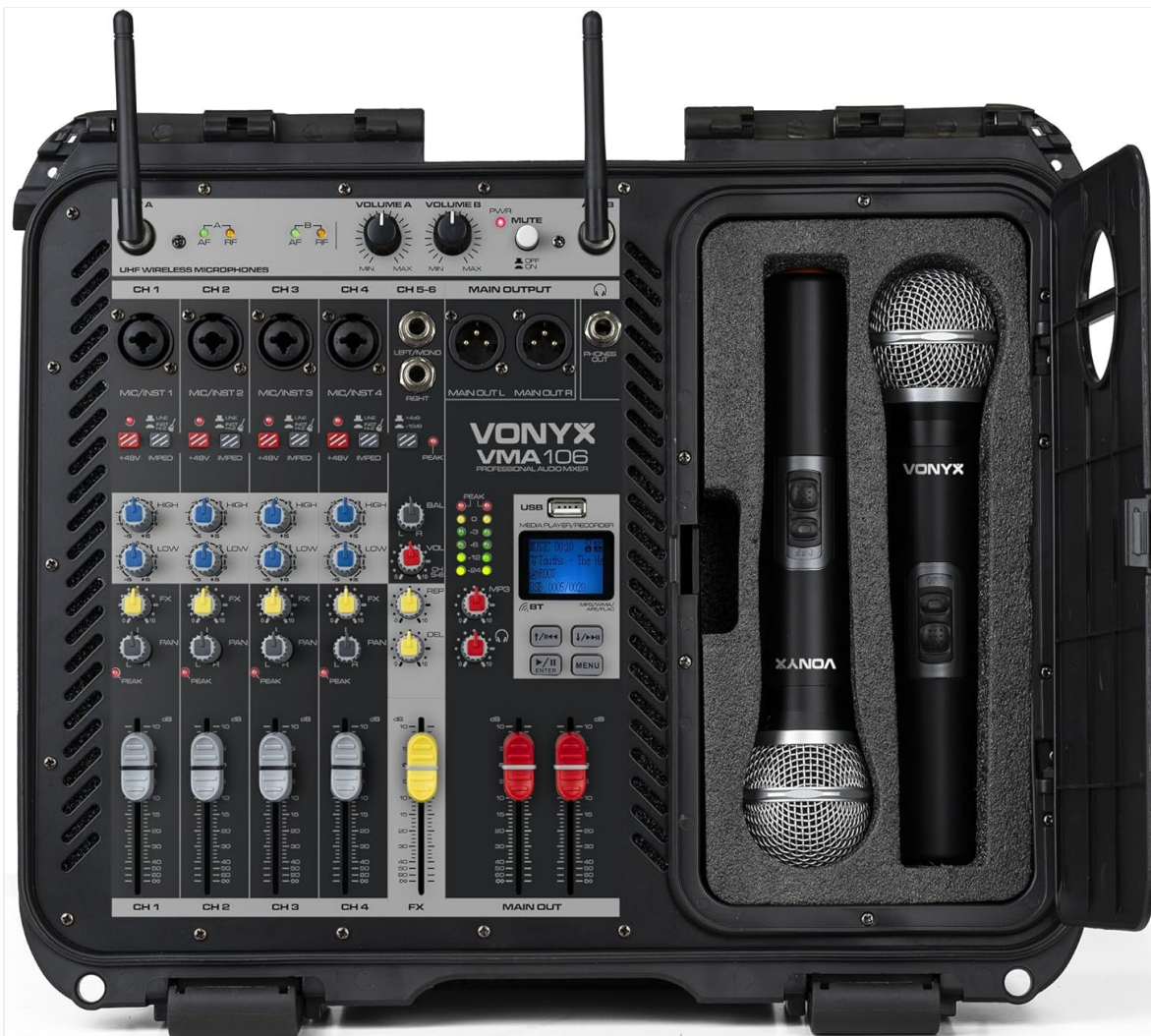
Figure 2: Detailed view of the VMA106 mixer's control panel, including channel faders, EQ knobs, and the integrated media player. The two wireless microphones are securely stored in their dedicated compartments within the case.