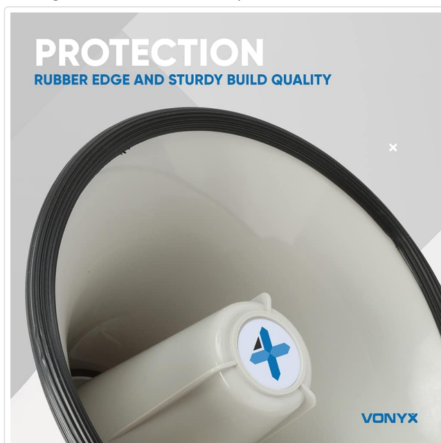
Figure 4.4: Protective rubber edge on the megaphone horn.