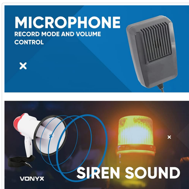
Figure 4.3: Detachable microphone and siren function.