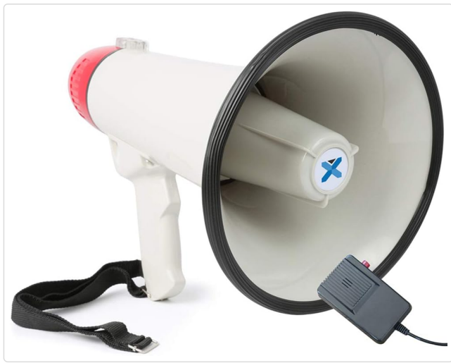
Figure 4.1: VONYX 40W Megaphone with detachable microphone and carrying strap.