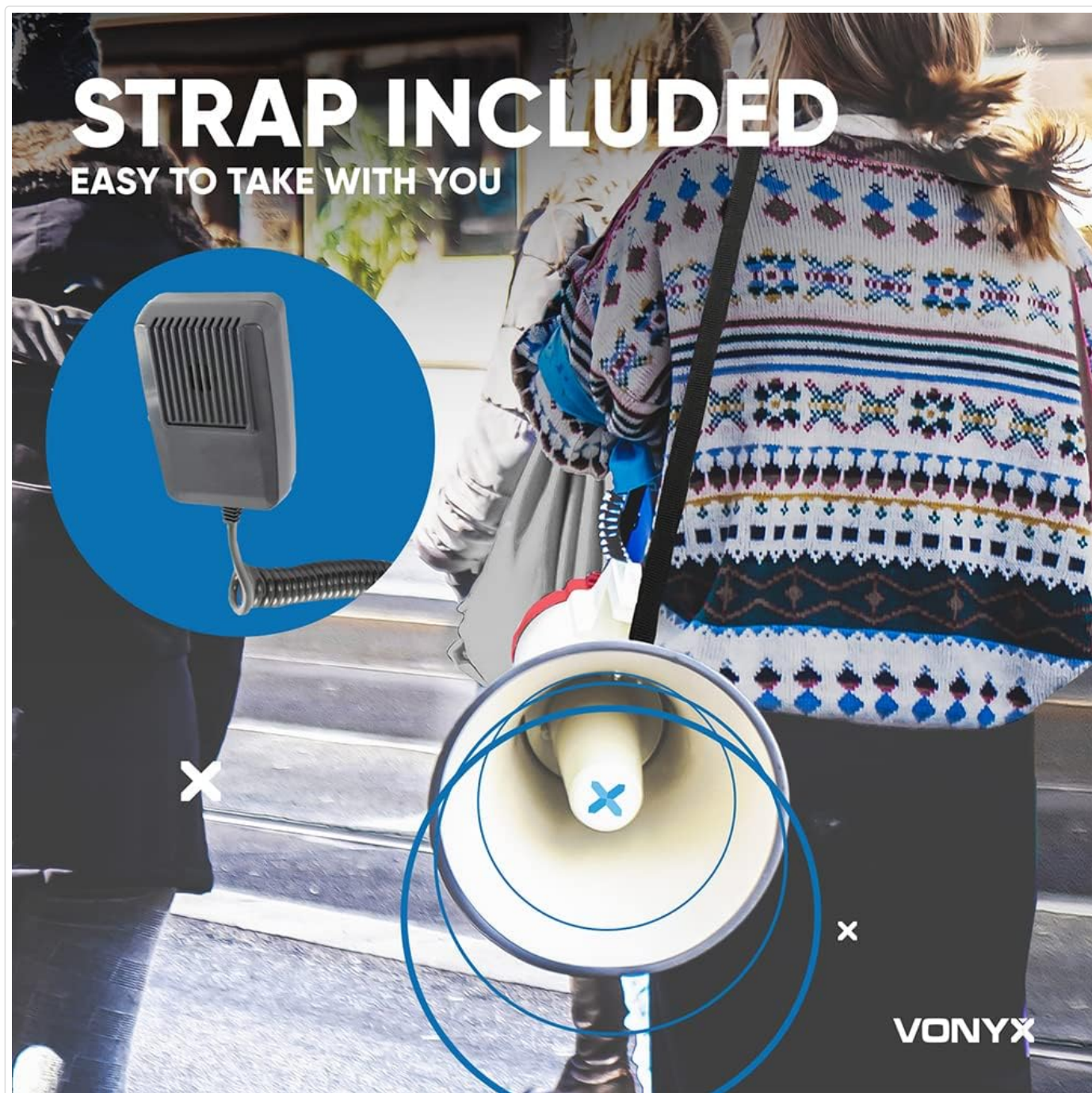
Figure 5.2: Megaphone with attached carrying strap.