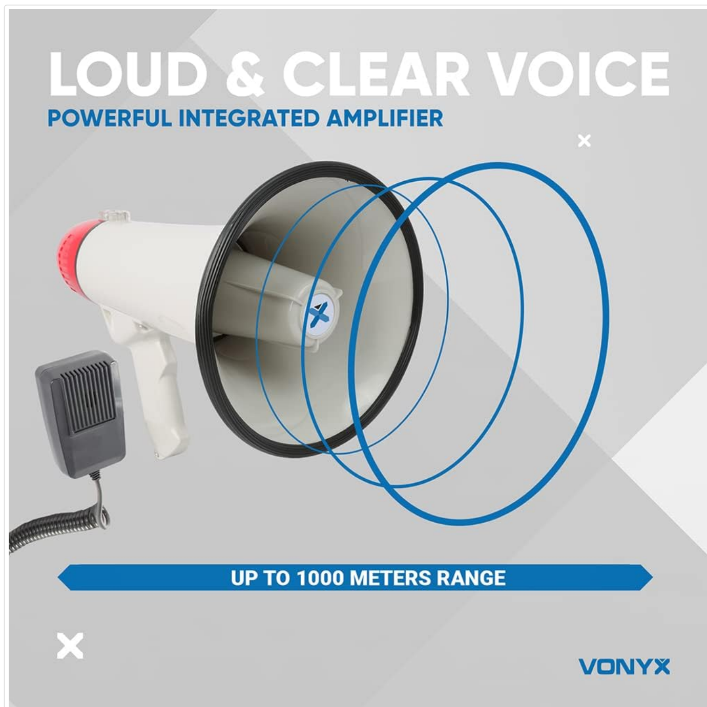
Figure 6.2: Megaphone range up to 1000 meters.