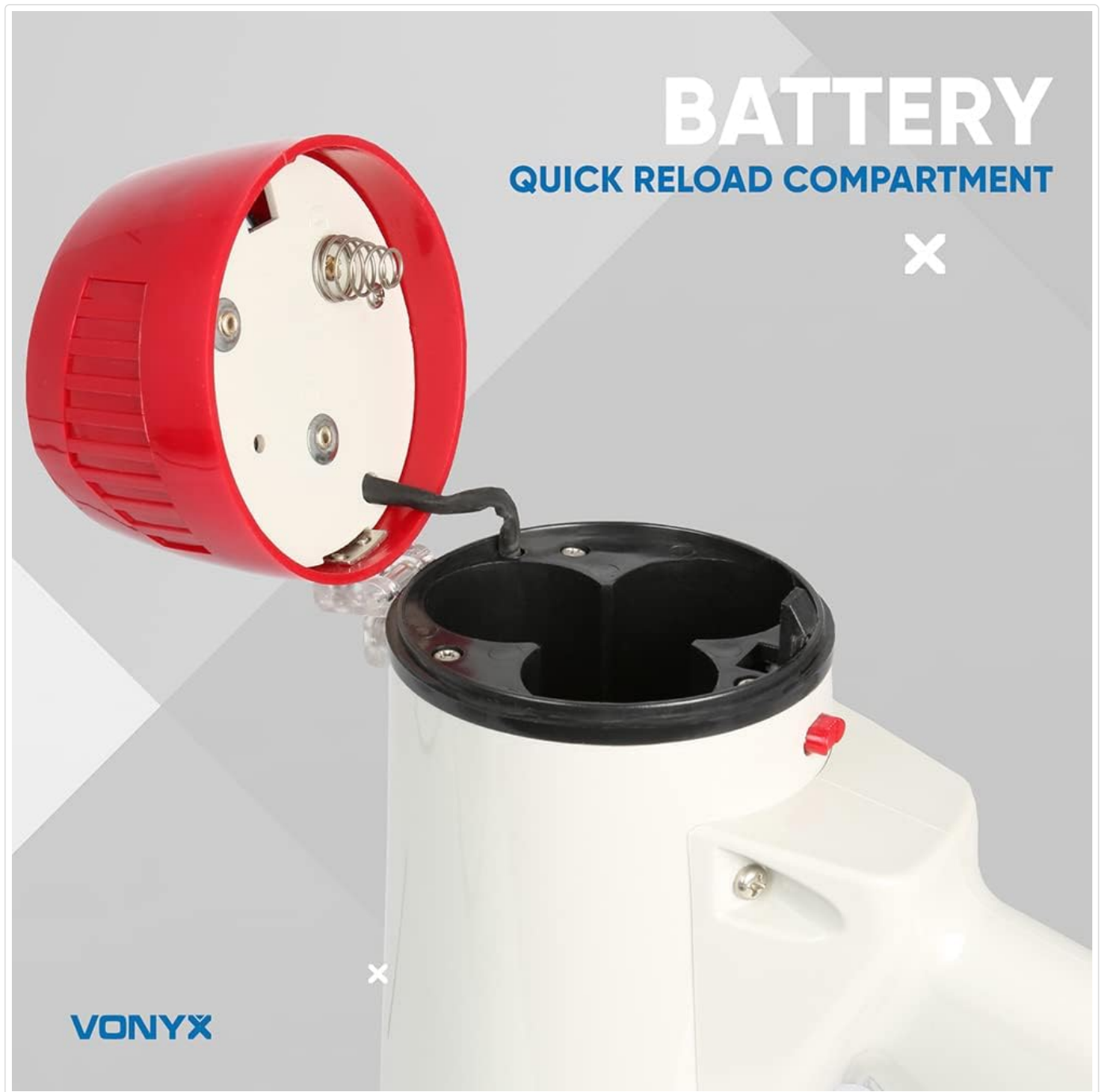
Figure 5.1: Quick reload battery compartment.