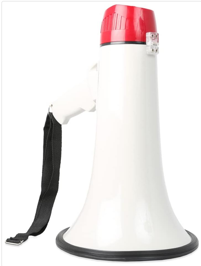
Figure 4.2: Side view of the VONYX 40W Megaphone.