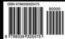
Image: Back cover of the Nikon Coolpix B500 instruction manual book. This image typically contains ISBN and barcode information.