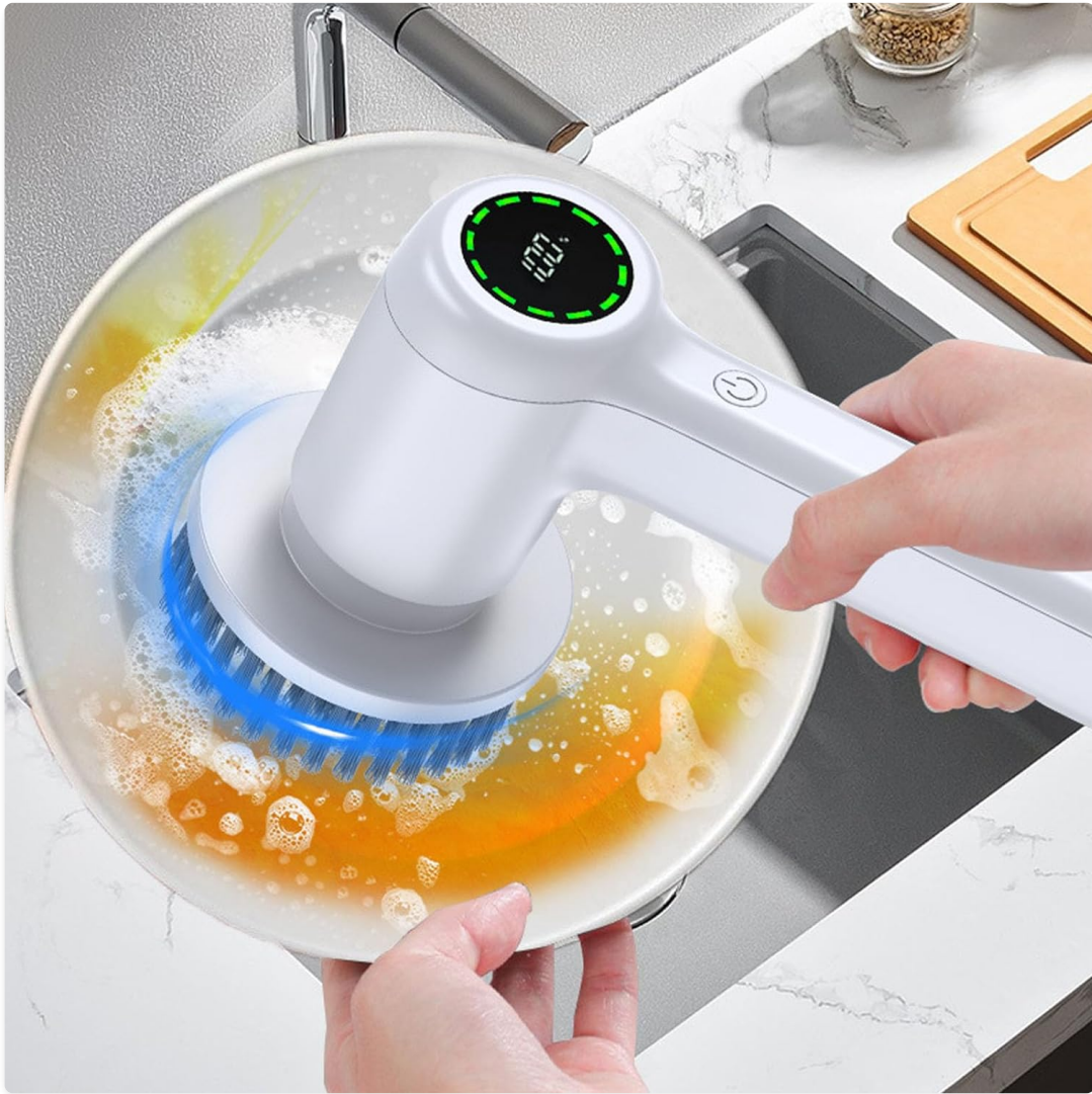
Figure 3.1: The digital display on the brush shows the battery level, here indicating 100% charge.