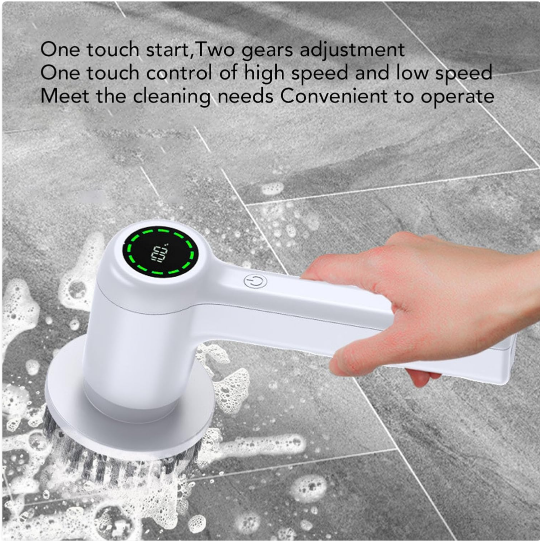
Figure 5.3: The brush is suitable for cleaning various floor types, including tiles.

One touch start, Two gears adjustment One touch control of high speed and low speed Meet the cleaning needs Convenient to operate