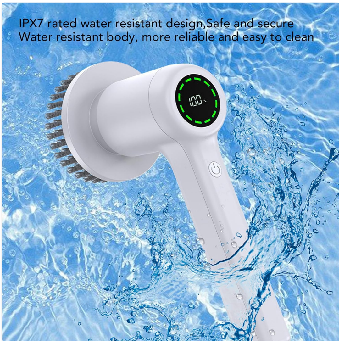
Figure 3.4: The IPX7 water-resistant design ensures safe and reliable use in wet conditions.