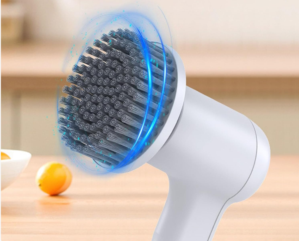
Figure 2.1: The electric cleaning brush equipped with a variety of brush heads, suitable for different surfaces.

Equipped with a variety of brush heads Everything can be brushed Kitchen, bedroom, toilet, living room