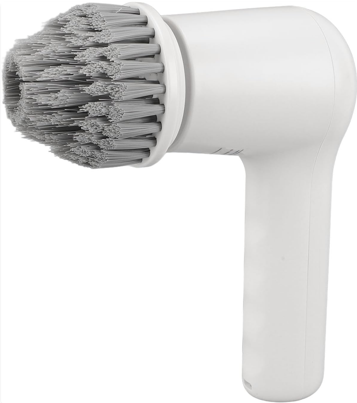
Figure 1.1: The Qcwwy Electric Cleaning Brush, showing its main body and brush head.