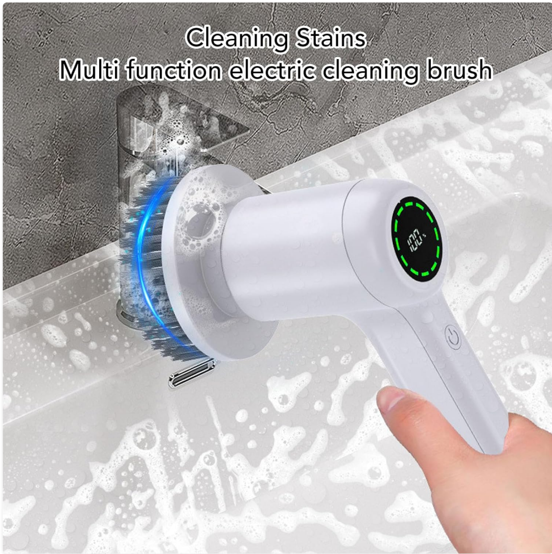
Figure 3.2: The multi-function electric cleaning brush effectively cleans various surfaces like faucets.