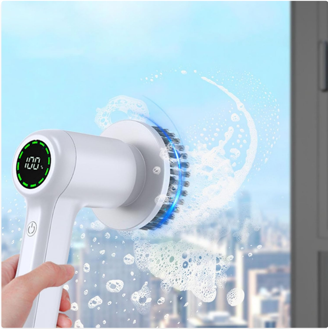
Figure 5.2: The brush effectively cleans windows, leaving them sparkling.