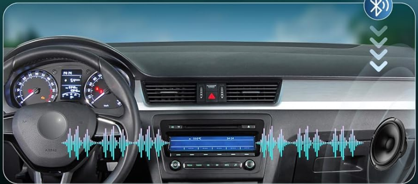
Image: This graphic details the four available audio output modes for the C98: Bluetooth Audio, AUX Input, FM Transmitter, and using the device's built-in local speakers.