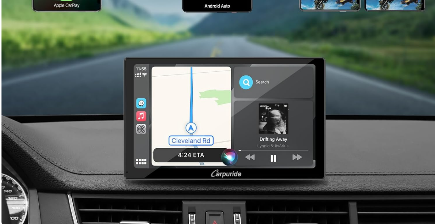
Image: This visual guide explains the connectivity options for the C98, showing how Apple CarPlay, Android Auto, and Mirror Link can be used wirelessly or via a wired connection, with examples of phone mirroring.