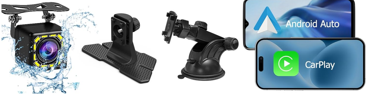
Image: The main CARPURIDE C98 unit showcasing its 9-inch screen with a typical CarPlay interface, alongside the included backup camera and two types of mounting brackets.