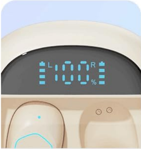
Intelligent digital display charging cabin power display

The earbud's compact design ensures a secure and comfortable fit, even for petite ears.