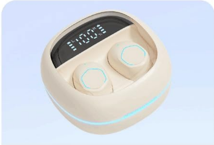
Transparent sky cabin design naturally and beautiful