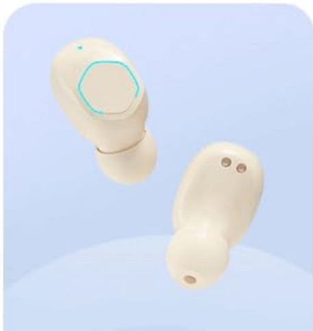
Mini compact comfortable to wear

corresponding ear (L for left, R for right) and rotate slightly to find a secure and comfortable fit. The skin-friendly silicone tips ensure stability during various activities.