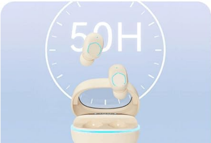
50h long battery life rechargeable earphones 7 times