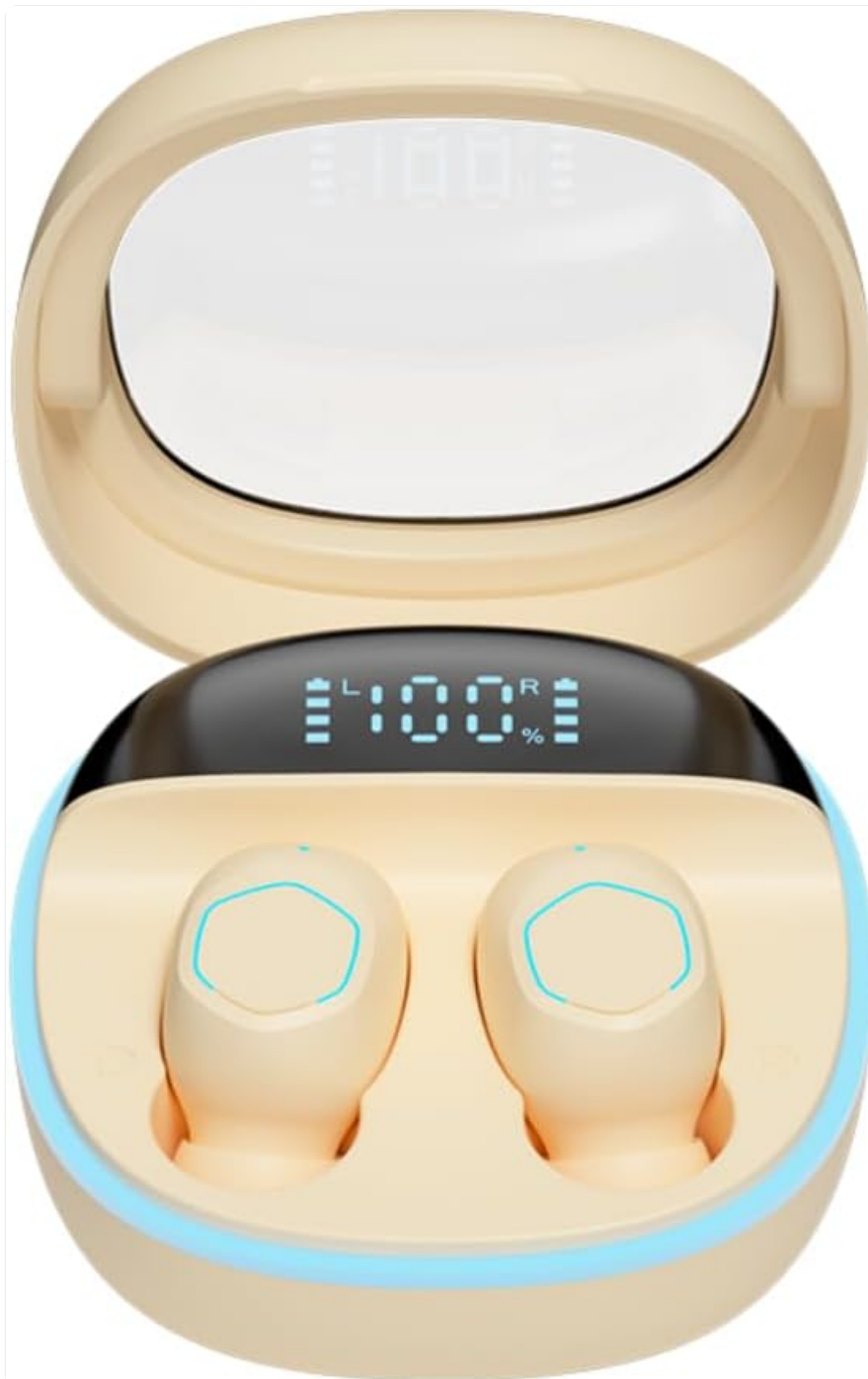
The Generic Wireless Earbuds in their open charging case, displaying the battery percentage on the LED screen.