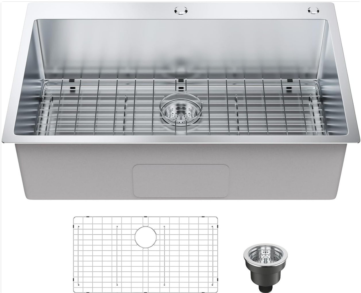
Figure 1.1: VEVOR Kitchen Sink with Protective Bottom Grid and Basket Strainer.