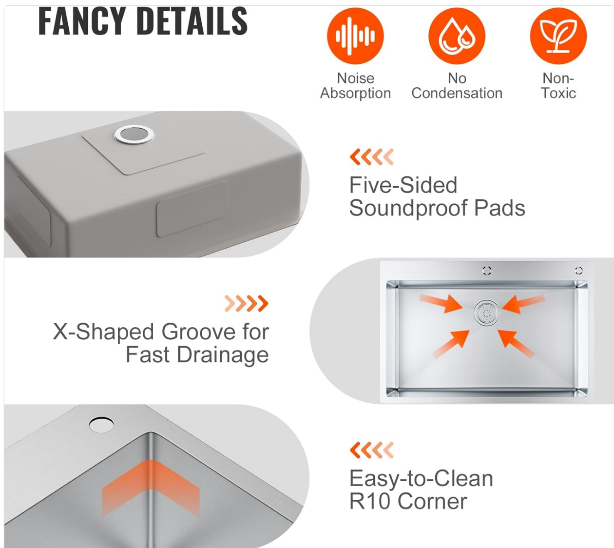
Figure 3.1: Sink Design Features for Performance.

The sink is equipped with thicker and softer rubber noise reduction pads on five sides, significantly reducing noise from water flow and garbage disposal operation.