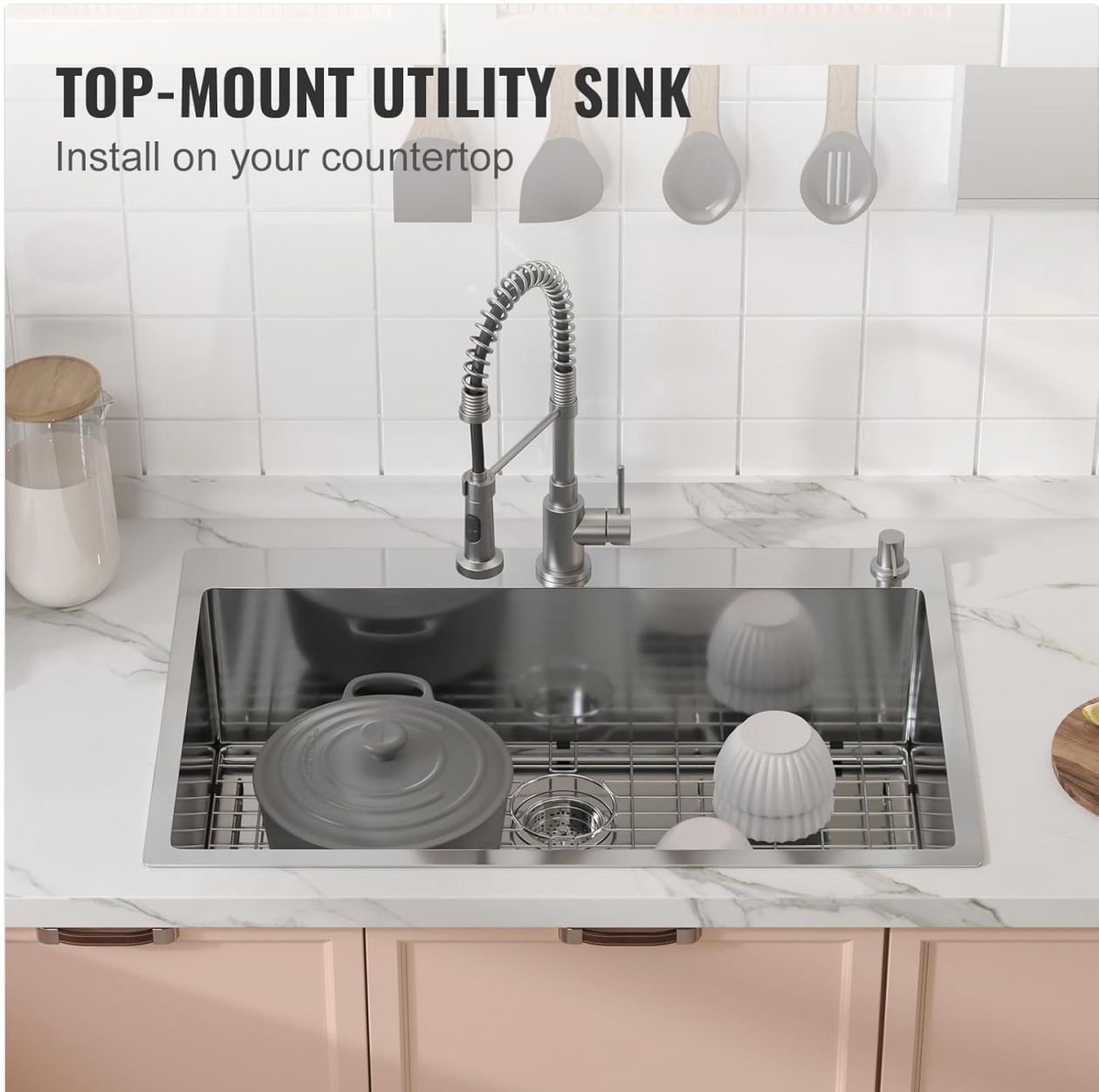
Figure 2.2: Top-Mount Installation Example.