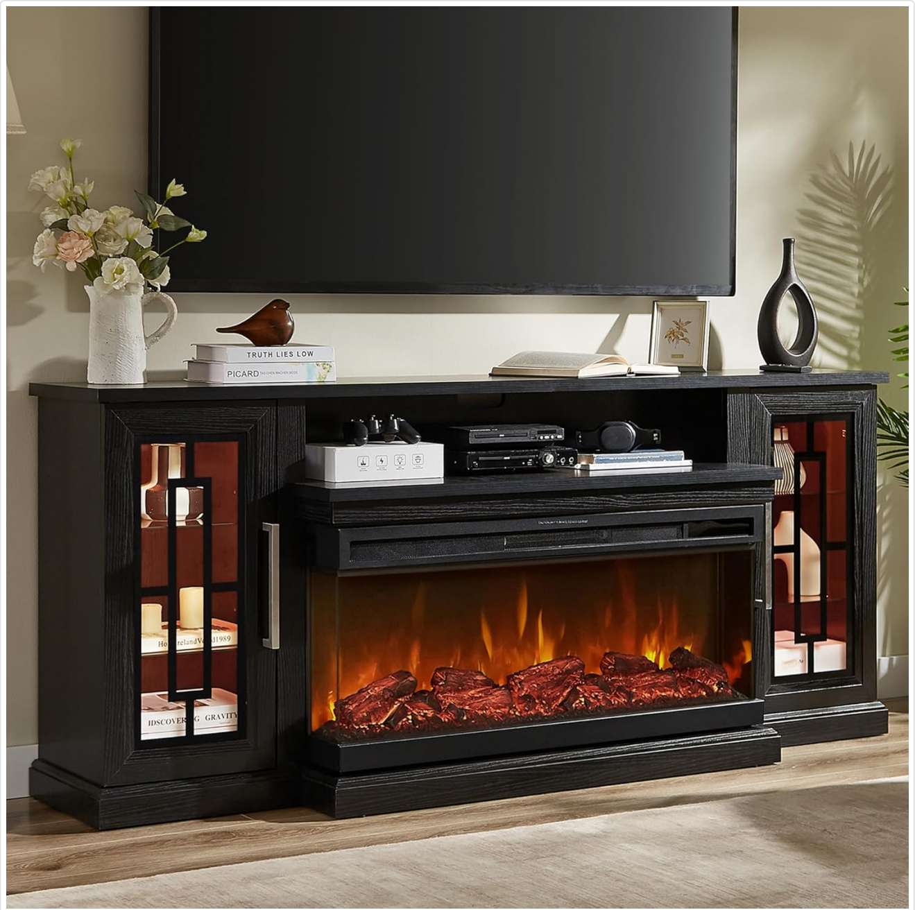
Image: The 75-inch TV stand in a living room setting, demonstrating its scale with a television.