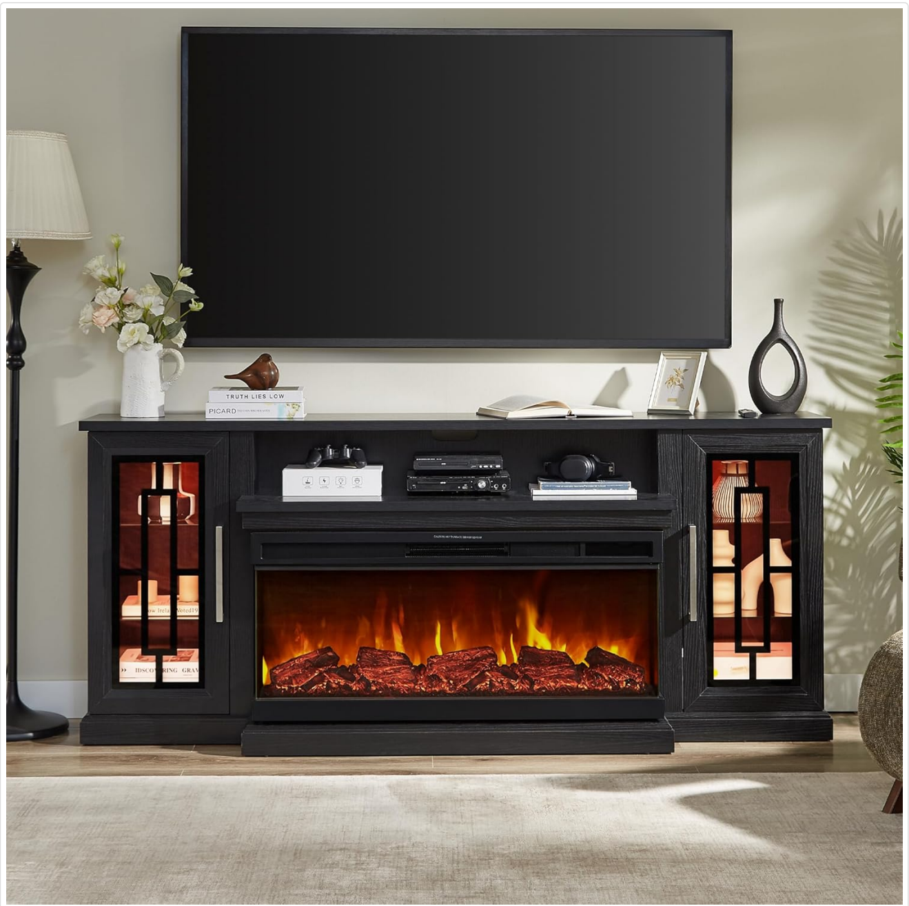
Image: The Unineo 75 Inch Electric Fireplace TV Stand in black, highlighting its overall design and features.