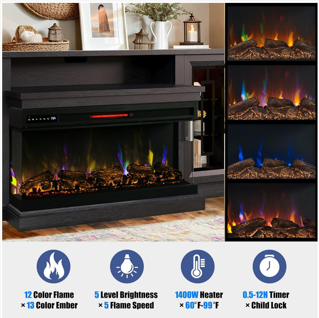
Image: Detail of the fireplace insert showcasing the adjustable flame and log ember colors.