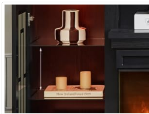
Image: Close-up of the adjustable glass shelf, indicating it can hold up to 20 lbs.