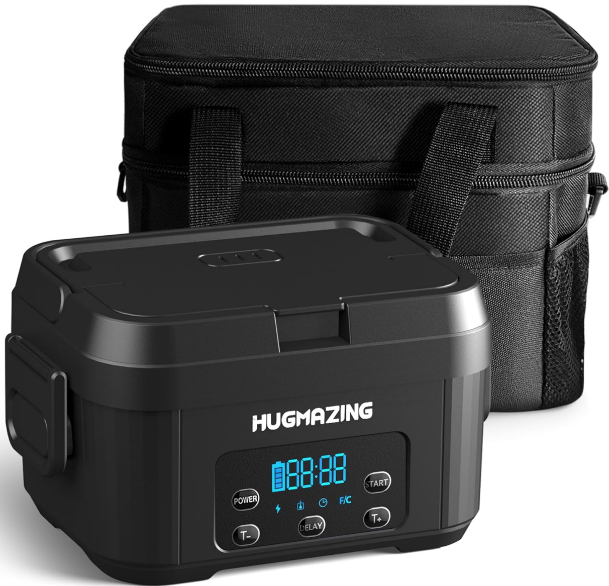
Image: The Hugmazing Cordless Electric Lunch Box main unit shown with its insulated carry bag.