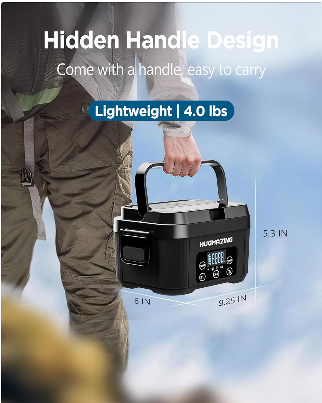
Image: The Hugmazing lunch box showcasing its hidden handle design, extended for carrying. The unit weighs 4.0 lbs and has dimensions of approximately 9.25 inches long, 6 inches wide, and 5.3 inches high.