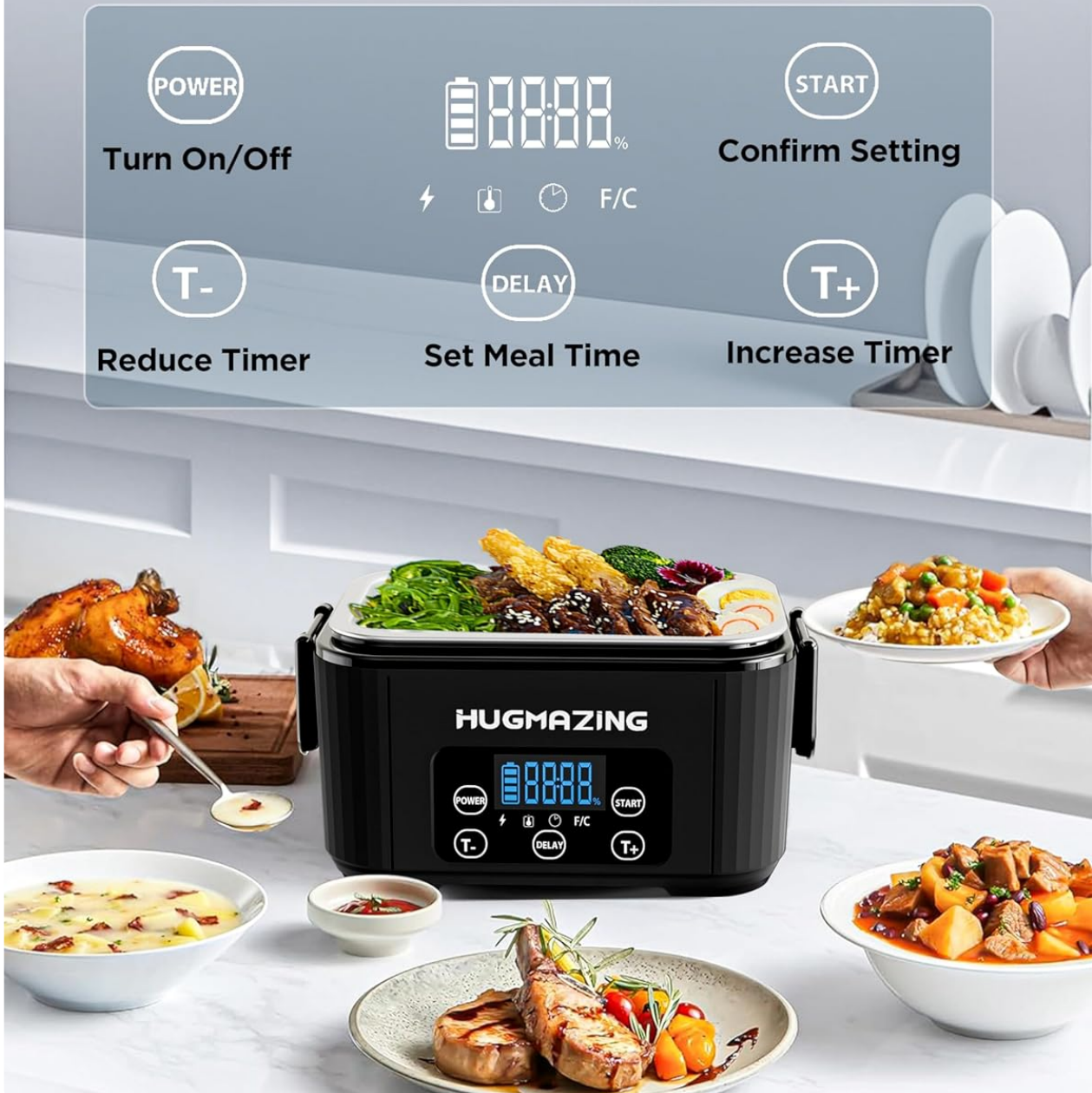
Image: Close-up of the Hugmazing lunch box control panel, illustrating the functions of the POWER, START, DELAY, T+, and T- buttons, along with the digital display showing battery and time information.

Easy for Anyone to Use - No Learning Curve