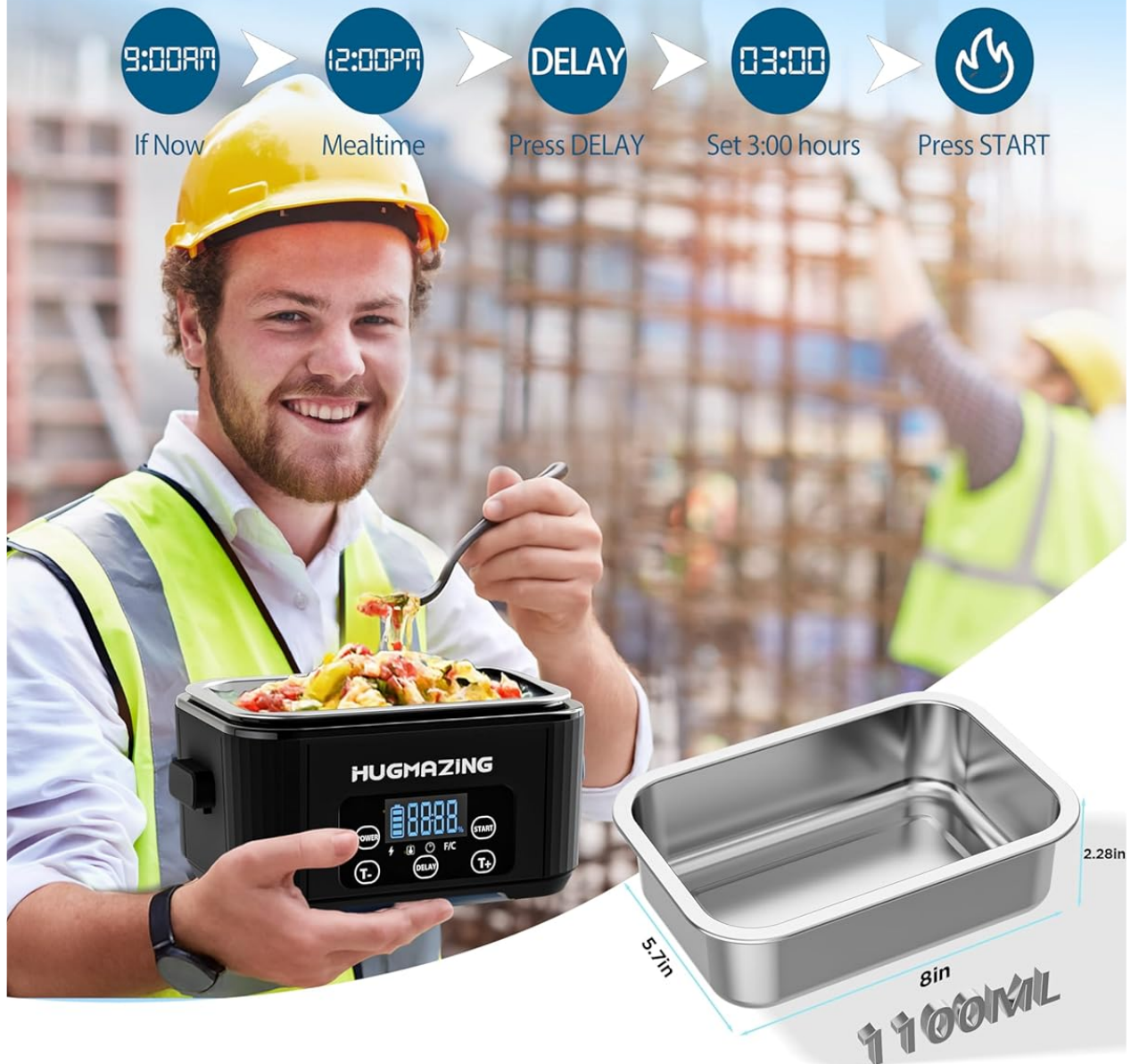
Image: A diagram illustrating the scheduled heating function, showing how to set a delay time (e.g., 3 hours) between the current time and mealtime for automatic heating.

Heats faster & hotter than standard 7.4V models