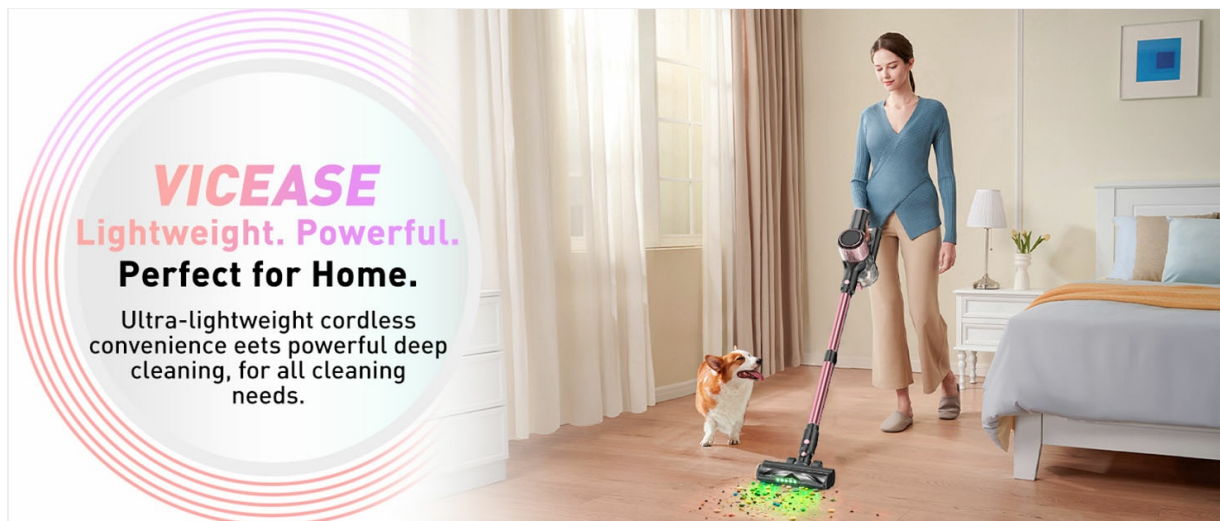
Image: The VICEASE A27 Cordless Vacuum Cleaner being used in a living room, demonstrating its lightweight and powerful design for home cleaning.

Thank you for choosing the VICEASE A27 Cordless Vacuum Cleaner. This manual provides essential information for the safe and efficient operation, maintenance, and troubleshooting of your new vacuum cleaner. Please read it thoroughly before first use and retain it for future reference.