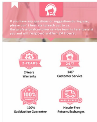
Image: A graphic indicating customer support availability and warranty information.

Your VICEASE A27 Cordless Vacuum Cleaner comes with a 24-month protection plan . For any questions, suggestions, or issues during use, please do not hesitate to contact our professional customer service team. We are available 24/7 and will respond within 24 hours. Please refer to your purchase documentation for specific contact methods (e.g., email or message platform).