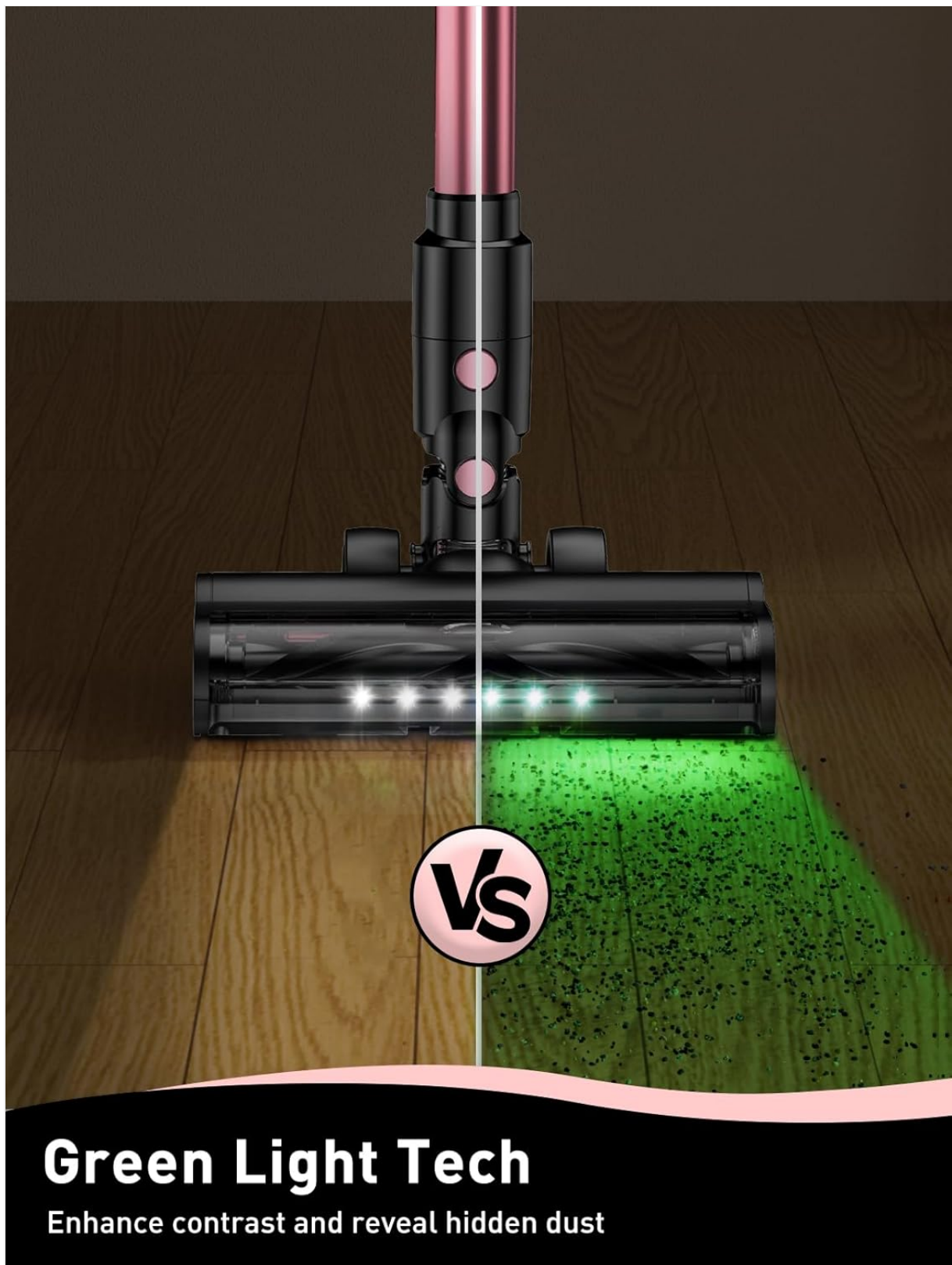
Image: A split image showing the effectiveness of the green LED light on the vacuum head, highlighting how it illuminates otherwise invisible dust particles on a dark floor.