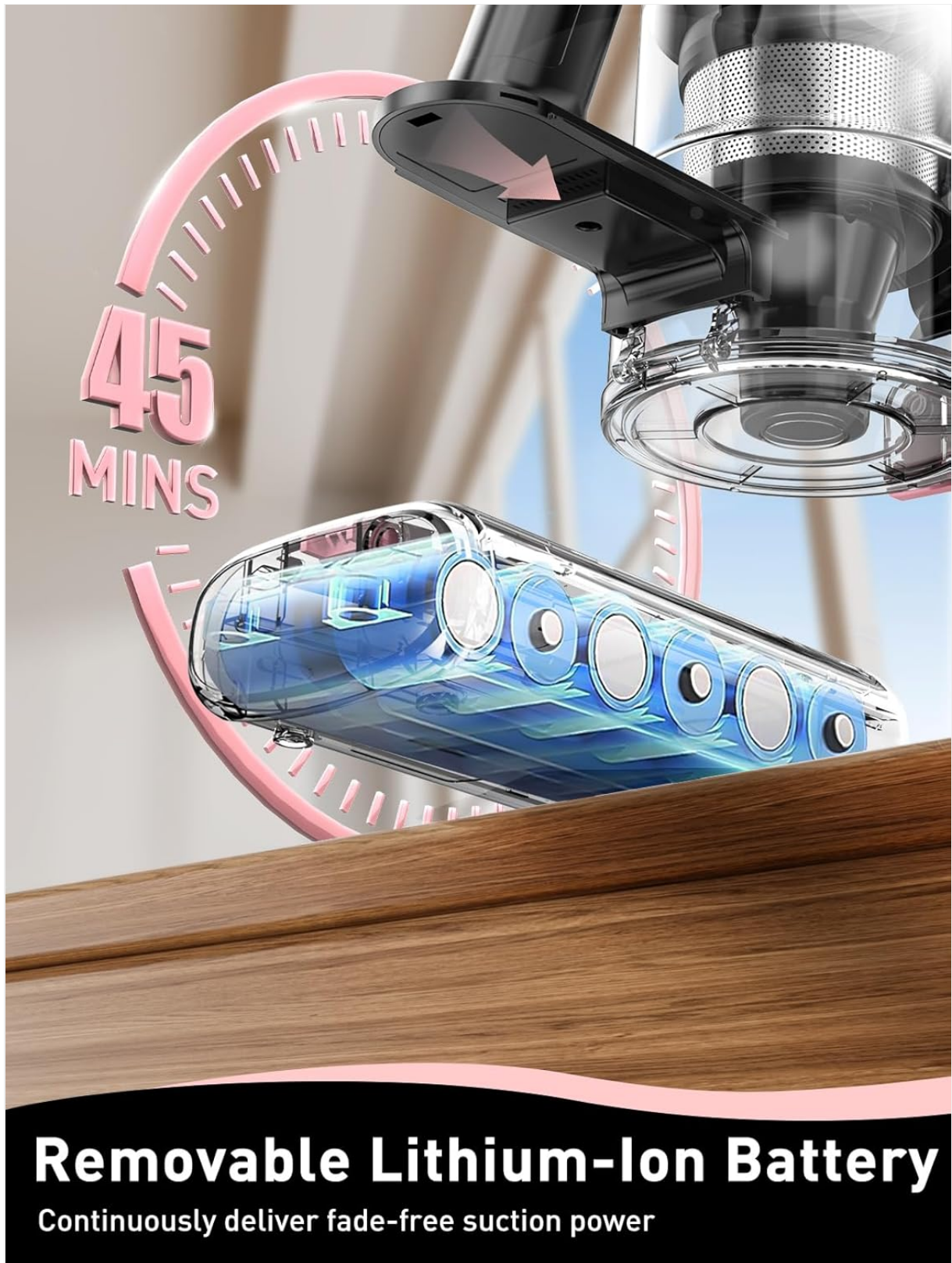
Image: A transparent view of the detachable Lithium-Ion battery pack, highlighting its continuous power delivery and 45-minute runtime.