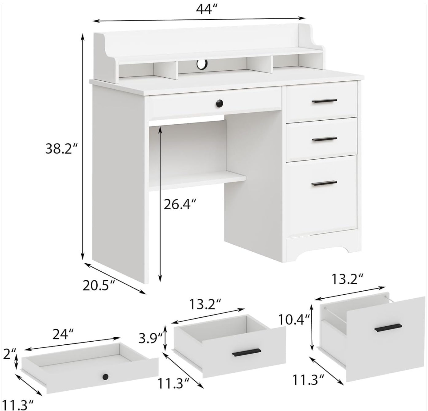
Image: A detailed diagram showing the dimensions of the desk and its individual components, including drawers and shelves.