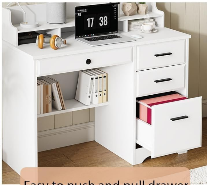
Easy to push and pull drawer