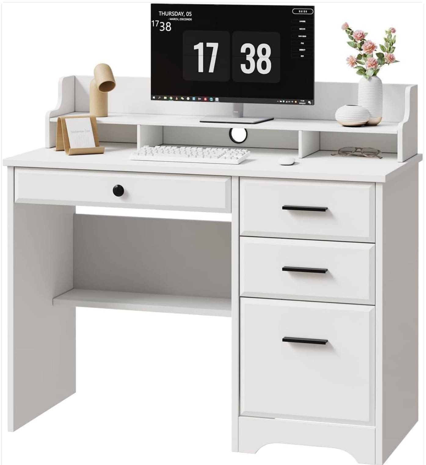
Image: The 4 EVER WINNER White Desk with a monitor placed on its elevated stand, showcasing its functional design.