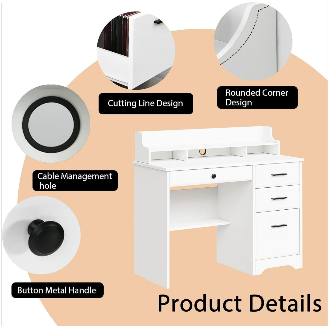
Image: Close-up details of the desk, highlighting the cable management hole, rounded corner design, and button metal handle.