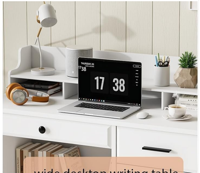
wide desktop writing table

Image: The desk with its drawers open, revealing storage space, and a monitor placed on the elevated shelf.