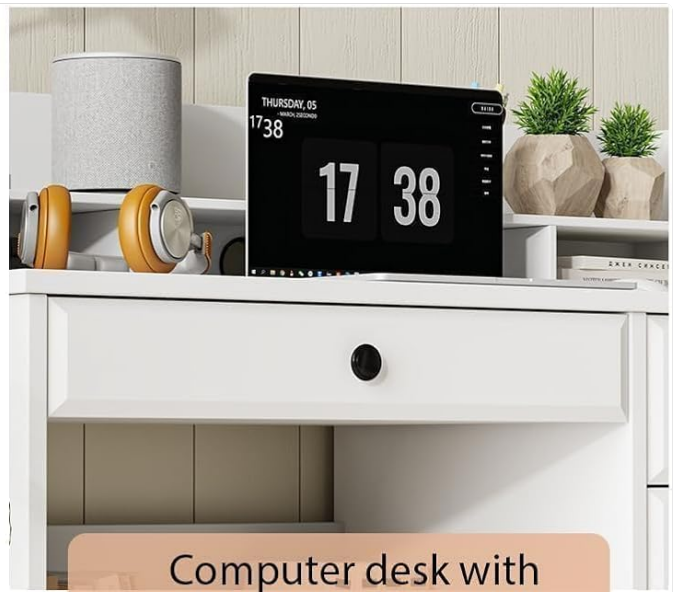
Computer desk with monitor shelf