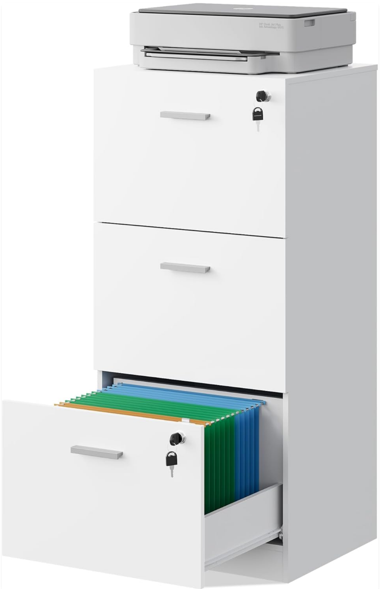
Image: The DEVAISE 3-Drawer Vertical File Cabinet in white, positioned in a home office with a printer on top.