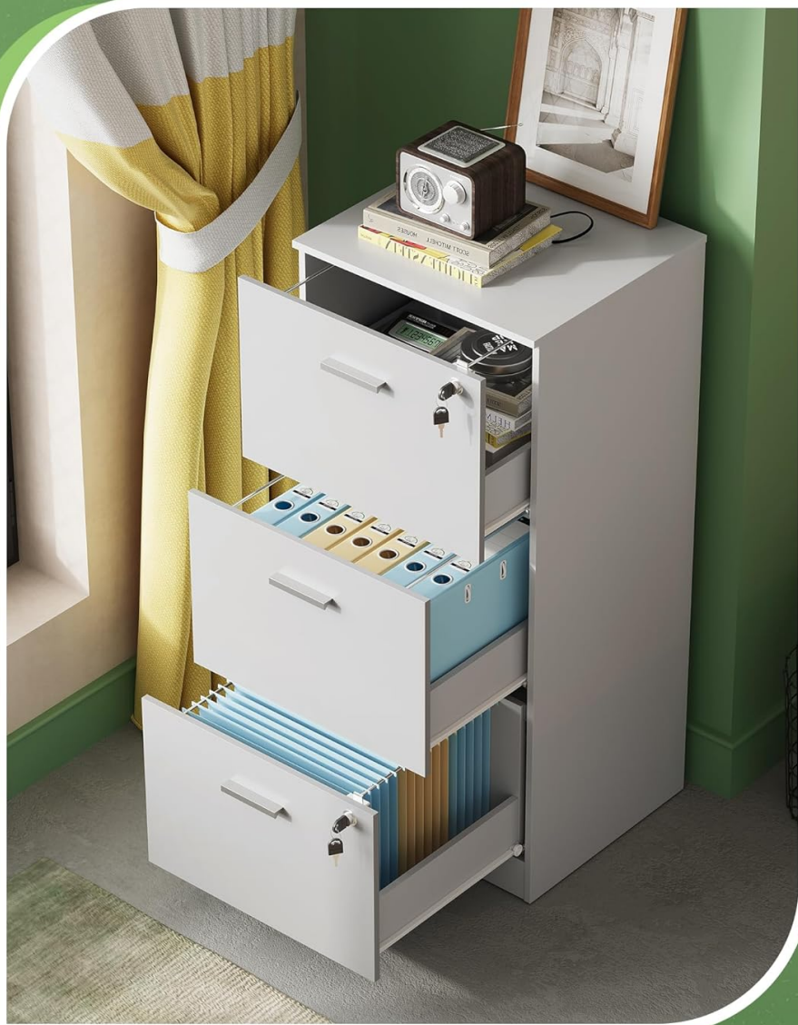
Image: The file cabinet with its drawers open, demonstrating its capacity for various items including files, books, and a printer on top.