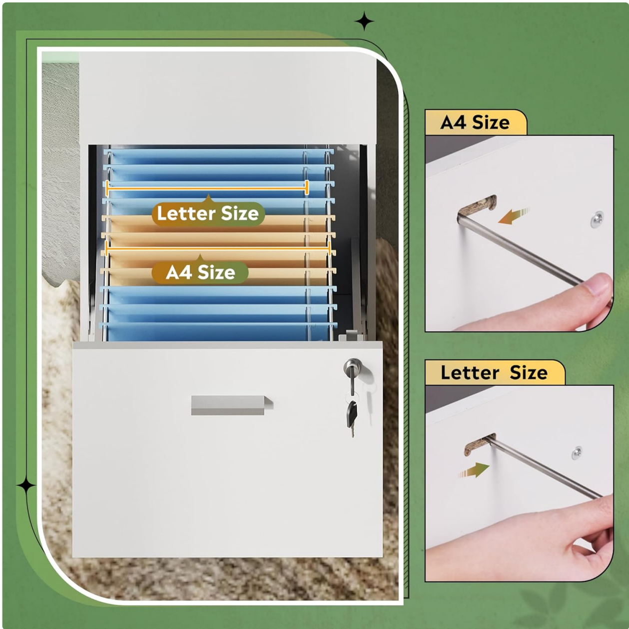
Image: Close-up view demonstrating how to adjust the rods within the drawer to fit A4 or Letter size files.