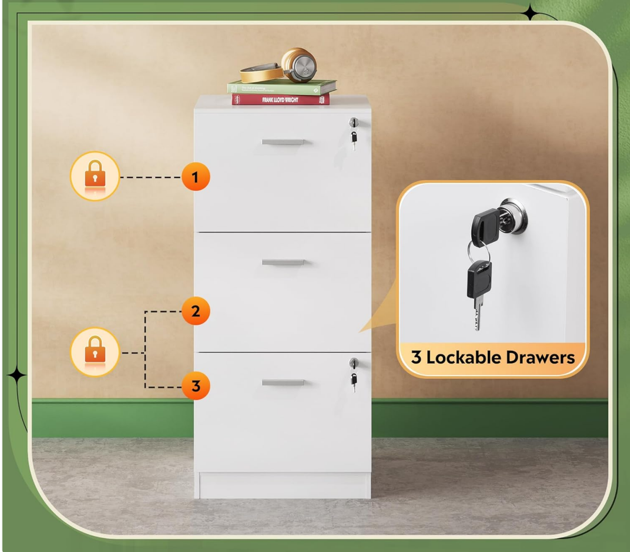
Image: Diagram showing the locking mechanism with keys and indicators for the three lockable drawers.