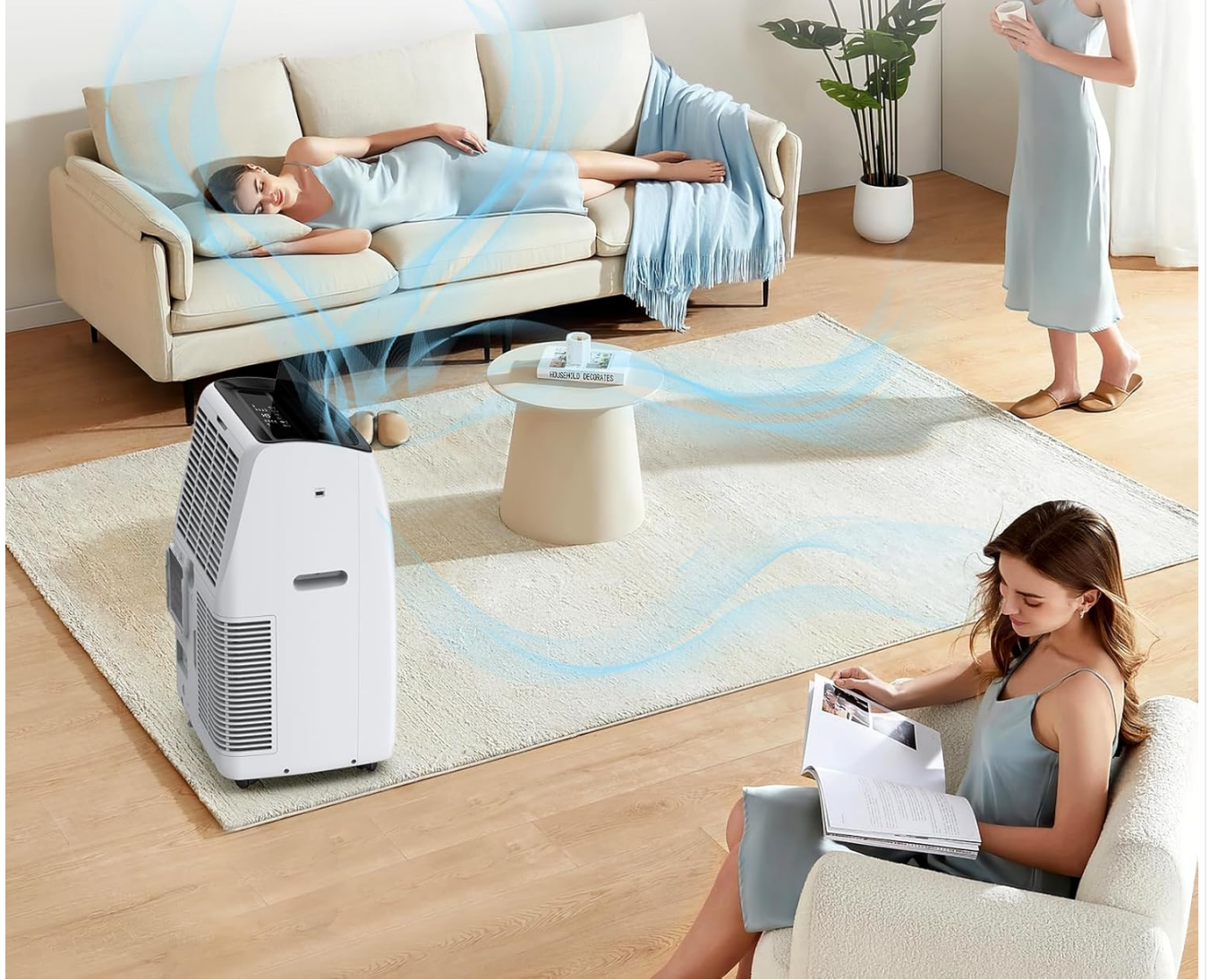
Illustration of a user operating the unit with the remote control from a sofa, demonstrating the 20 ft. remote control range.

Provides Cold Air For Areas up to 750 Sq. Ft., A Space Equal to the Size of A Typical Family Room