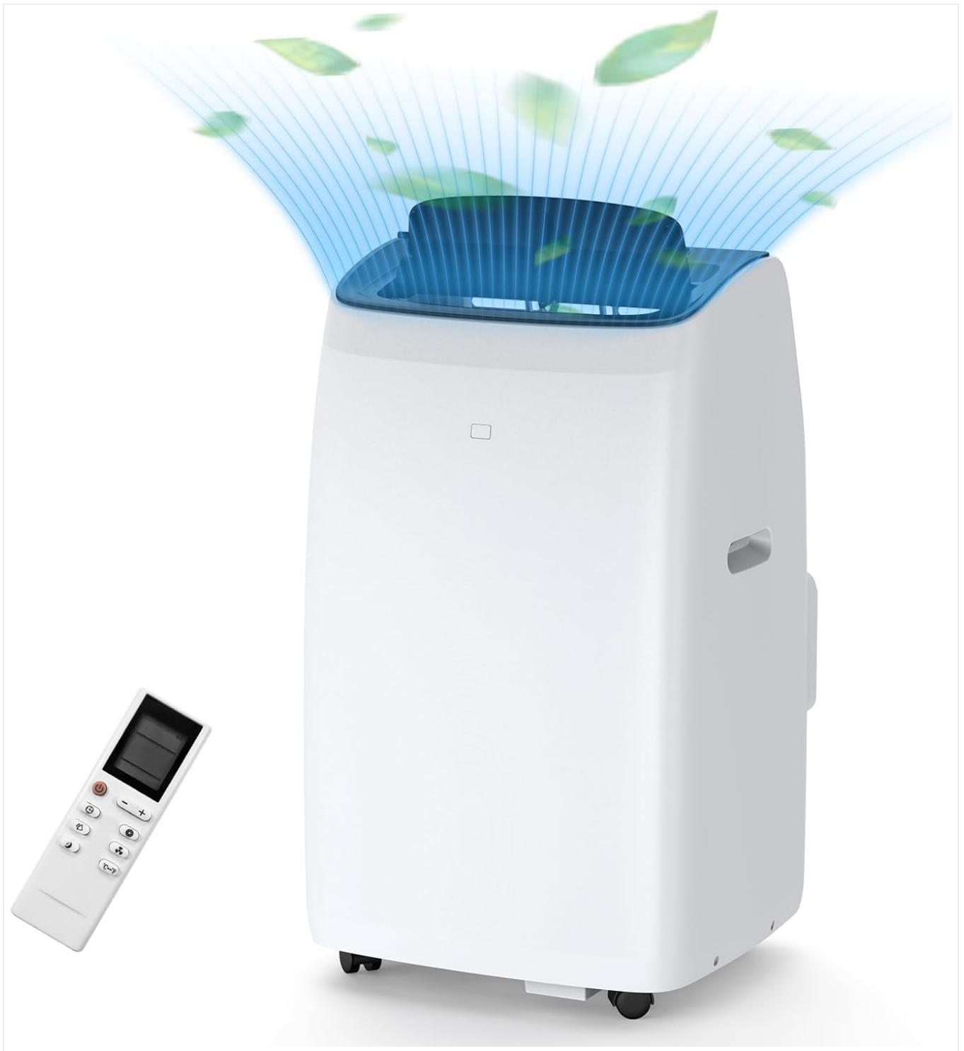
The TrailBlaze portable air conditioner unit shown with its remote control. The unit features a sleek white design with an air outlet on top and wheels for easy mobility.