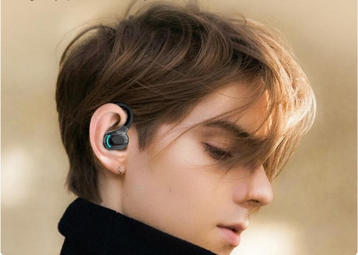
Image 2: A user wearing the FROVOL M-F8 earbud, highlighting its intelligent noise reduction capability for HD calls.

Intelligent voice call noise reduction technology greatly optimizes the clarity of sound.