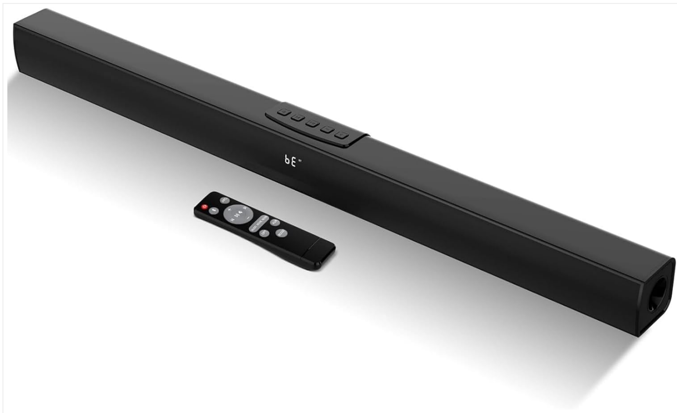
Figure 1.1: Maraawa KY-2020 Sound Bar and Remote Control.

Thank you for choosing the Maraawa KY-2020 Sound Bar. This sound bar is designed to enhance your home audio experience with powerful 60W HiFi stereo sound. Featuring Bluetooth 5.0 technology and multiple connectivity options, it delivers an immersive cinematic experience for your favorite movies, music, and TV shows. This manual provides detailed instructions for setup, operation, and maintenance to ensure optimal performance and longevity of your device.