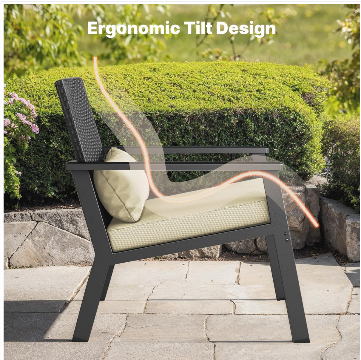
Image 2: Close-up view illustrating the 110° ergonomic recline tilt design of the patio chair, enhancing comfort and ease of use.

Place the furniture set on a flat, stable surface. It is suitable for various outdoor environments such as balconies, backyards, and porches.