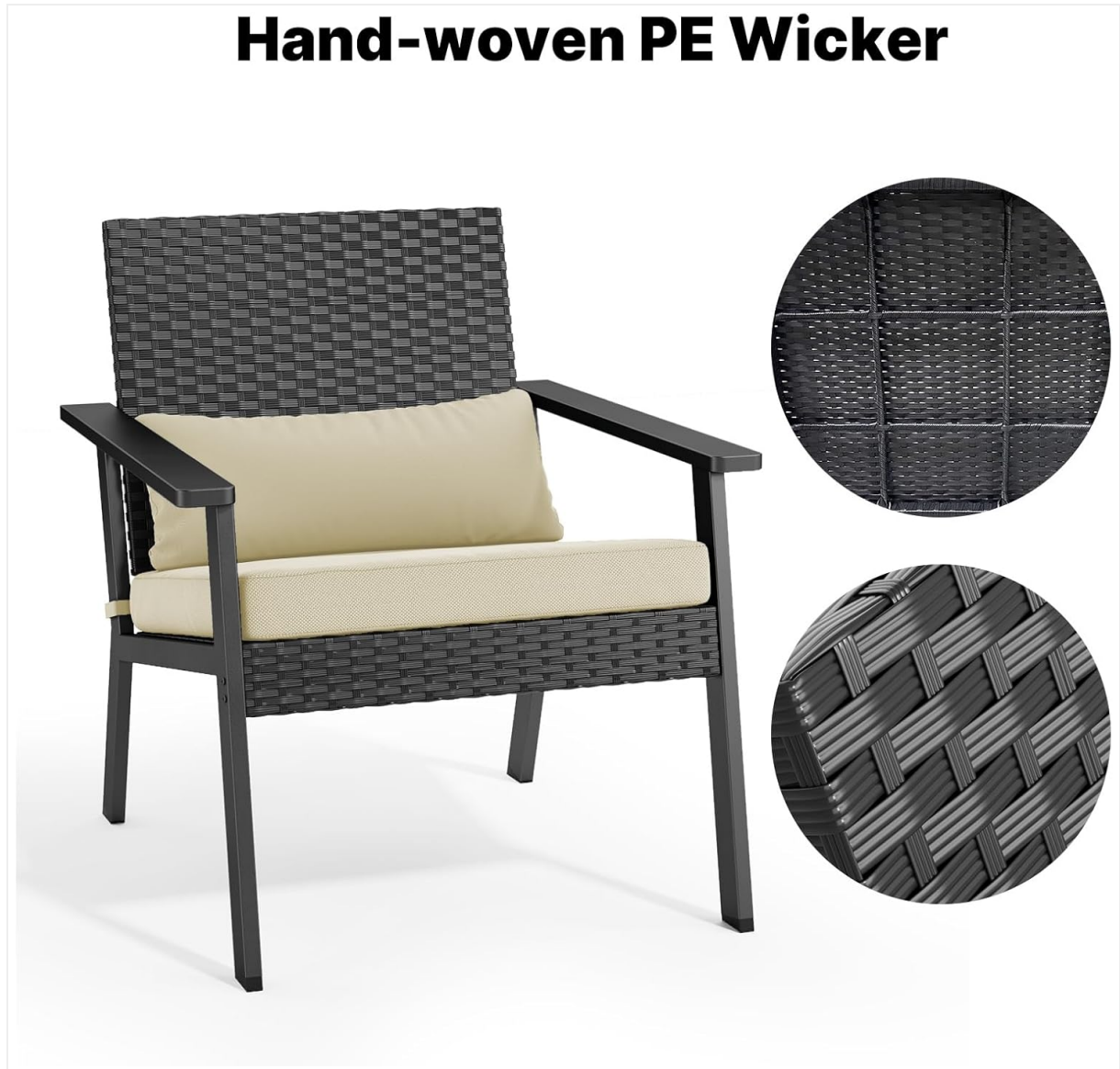
Image 3: Detailed view of the hand-woven PE wicker material, highlighting its tight weave and durable texture.

The furniture features 8mm hand-woven PE rattan, which is 20% thicker than ordinary rattan and weather-resistant. Clean the rattan surfaces with a soft cloth and mild soap solution. Rinse thoroughly and allow to air dry.