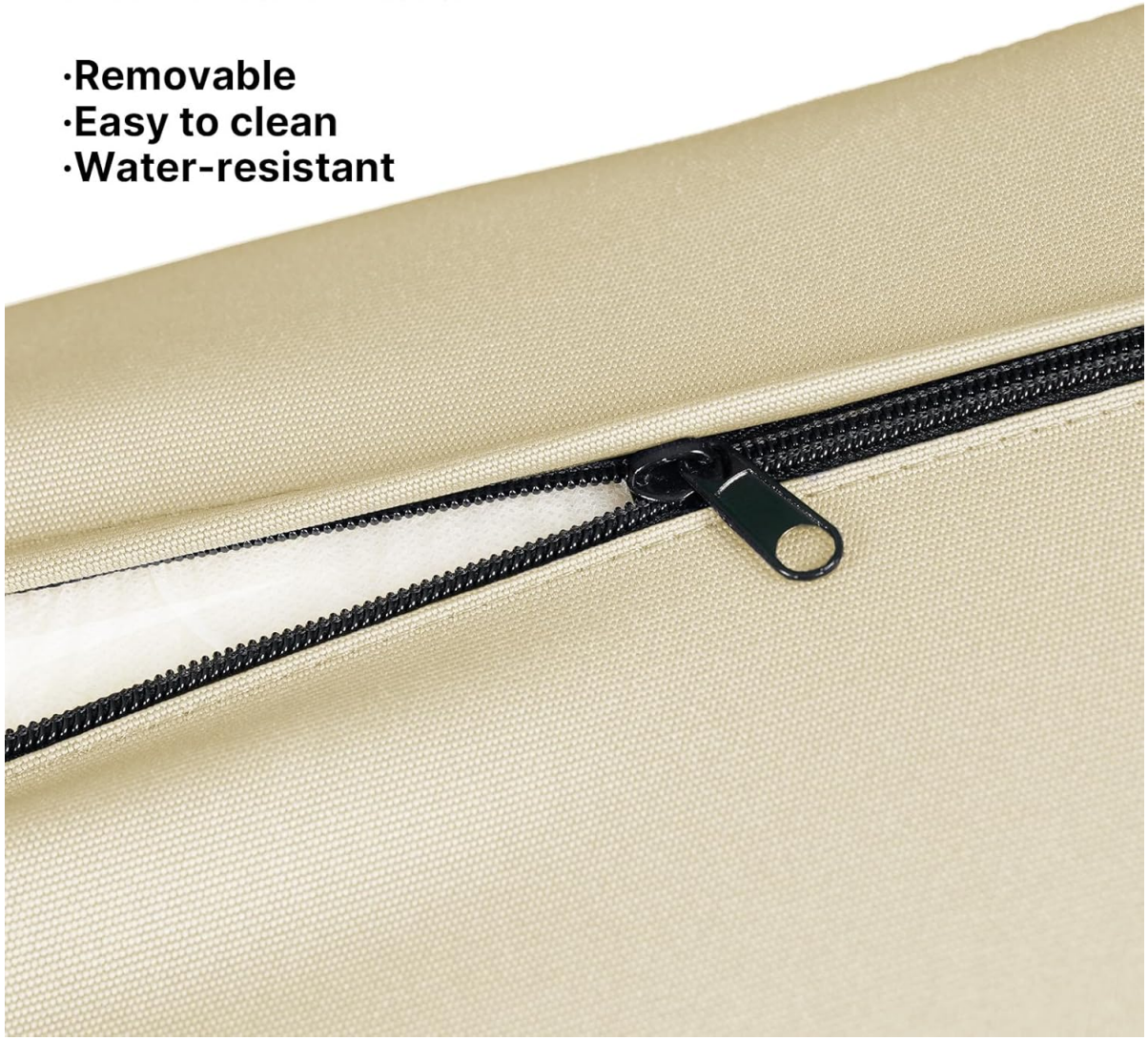
Image 4: Close-up of a seat cushion, showing its removable cover with a zipper for easy cleaning and its water-resistant properties.