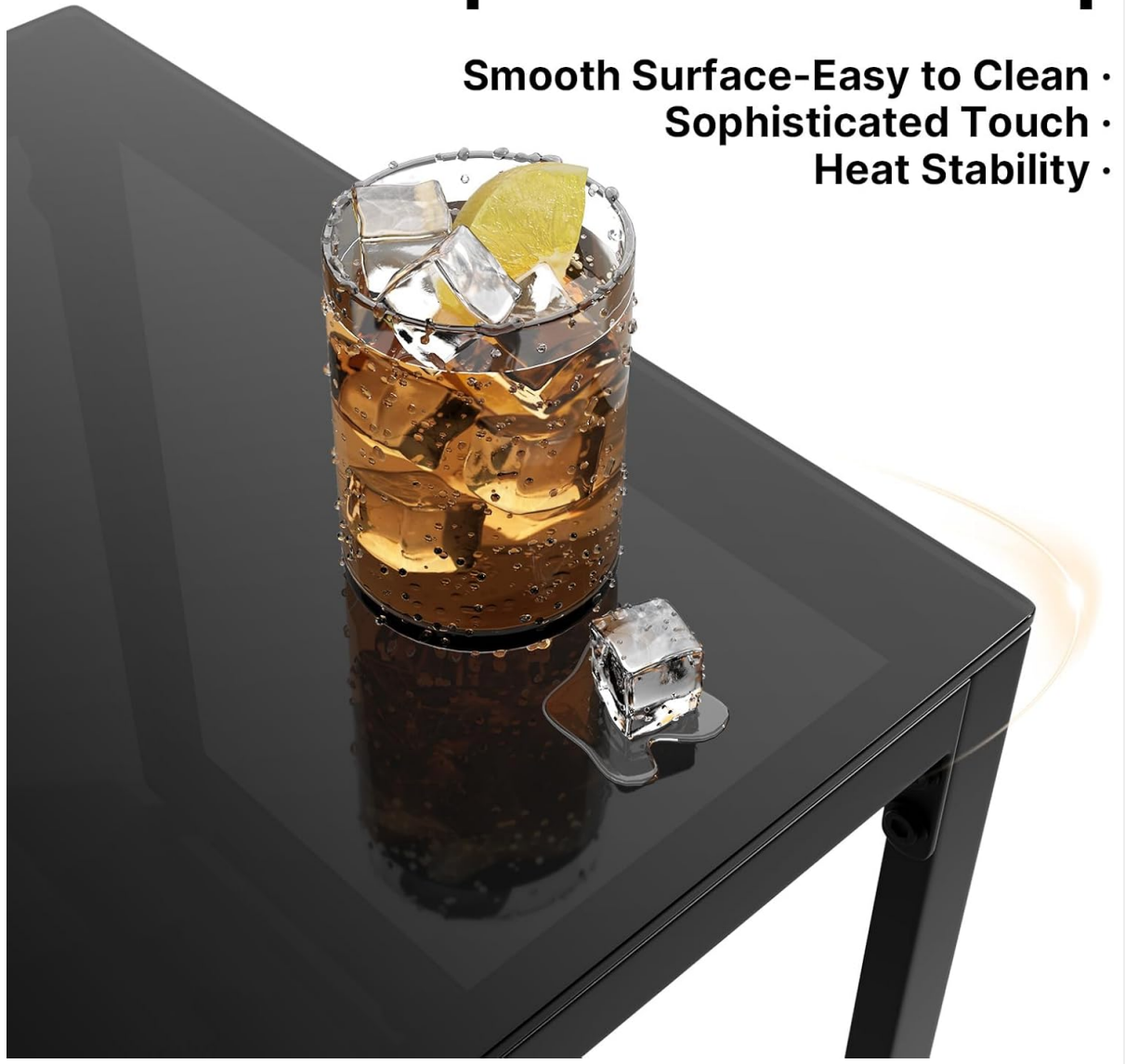
Image 5: View of the tempered glass tabletop, emphasizing its smooth, easy-to-clean surface and sophisticated appearance.

Smooth Surface-Easy to Clean · Sophisticated Touch · Heat Stability ·