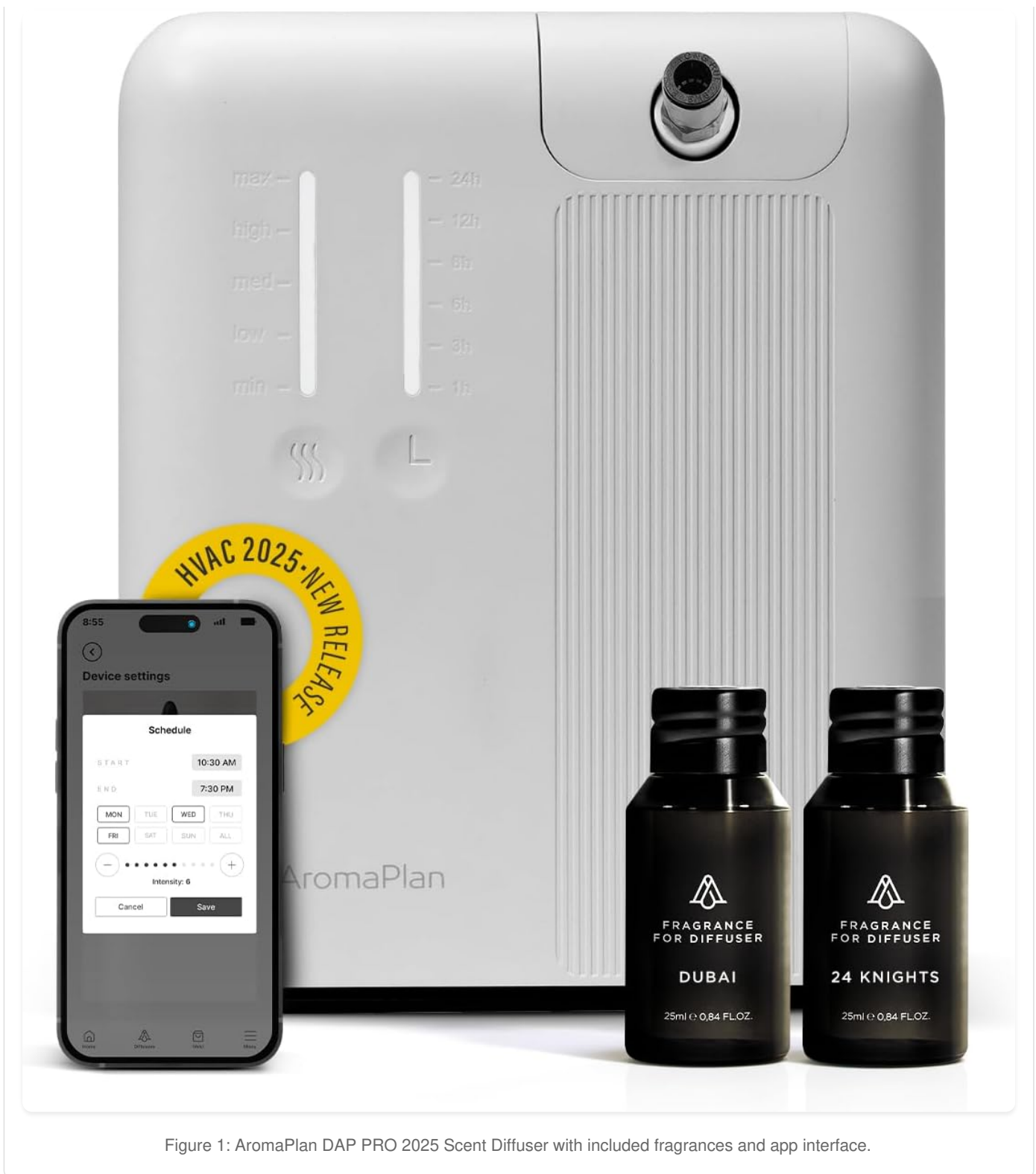
Figure 1: AromaPlan DAP PRO 2025 Scent Diffuser with included fragrances and app interface.