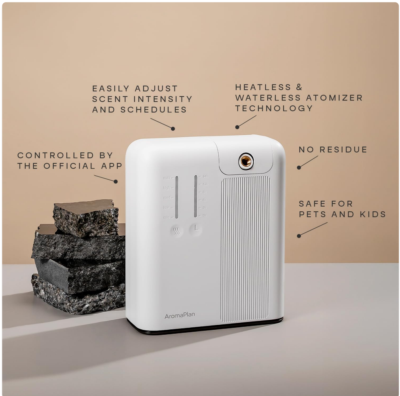
Figure 4: Key features of the AromaPlan diffuser.