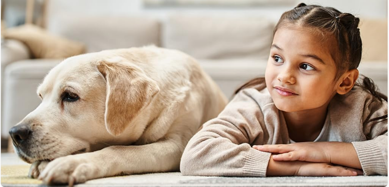
Figure 8: AromaPlan fragrance oils are thoughtfully crafted to be safe for your family, children, and pets.

All of AromaPlan fragrance oil blends are thoughtfully crafted to be safe for you, your family, children, and pets—so you can enjoy every scent with peace of mind.