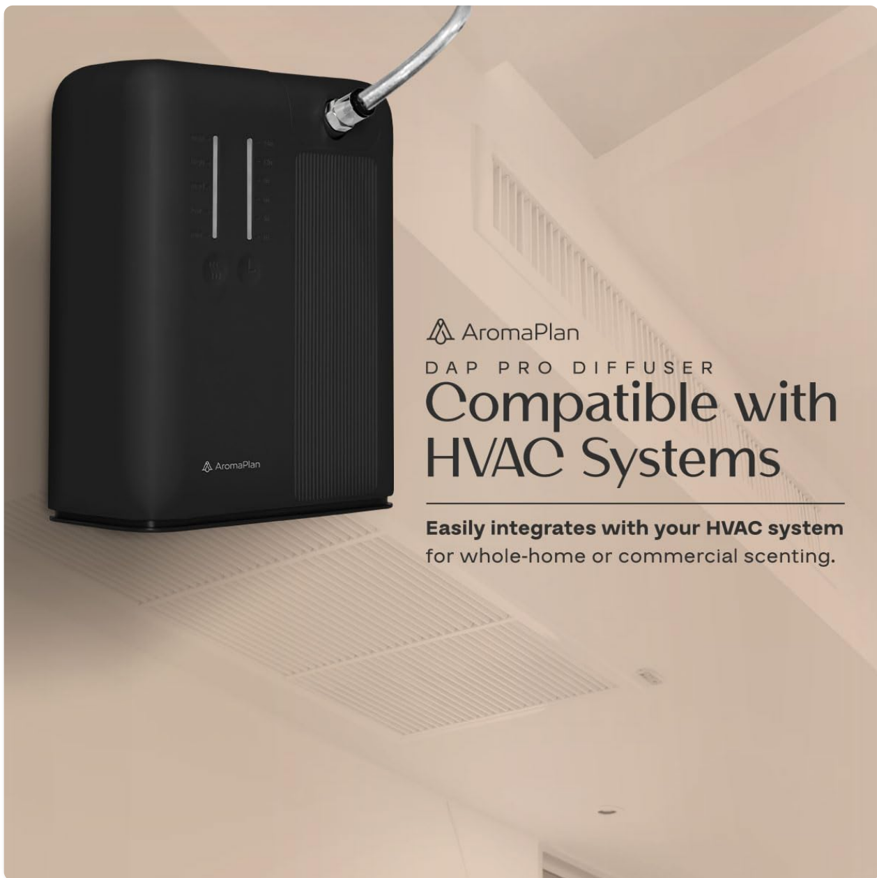
Figure 6: The AromaPlan DAP PRO 2025 can be seamlessly integrated with your HVAC system for efficient whole-home or commercial scenting.