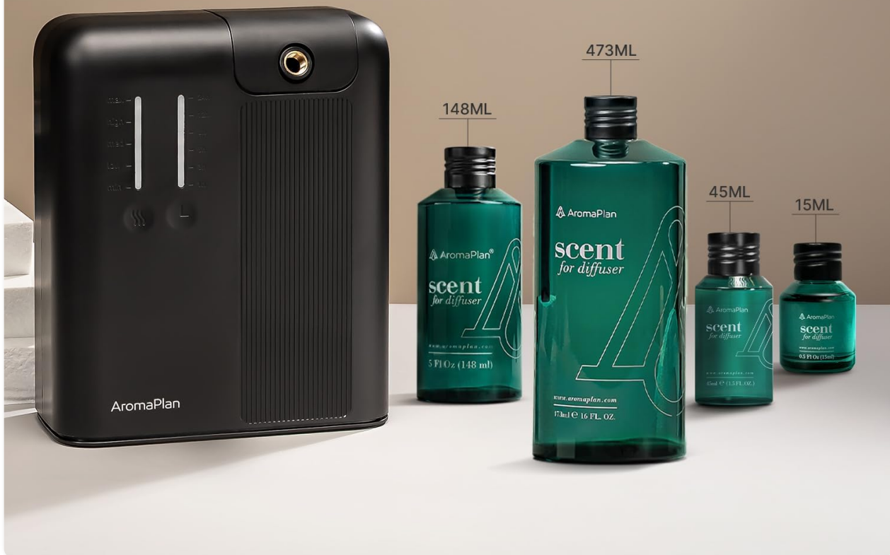
Figure 4: For optimal performance, use AromaPlan's exclusive collection of oil fragrances, available in various sizes.

We offer various sizes to perfectly match your diffuser