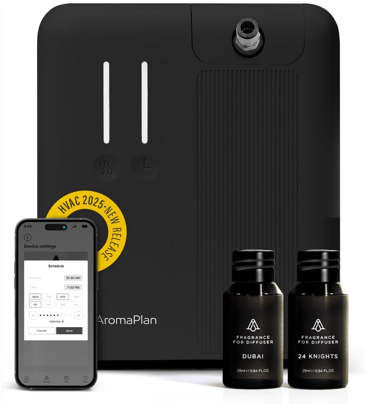
Figure 1: The AromaPlan DAP PRO 2025 Waterless HVAC Scent Diffuser, accompanied by two fragrance bottles and a smartphone demonstrating its app control capabilities.