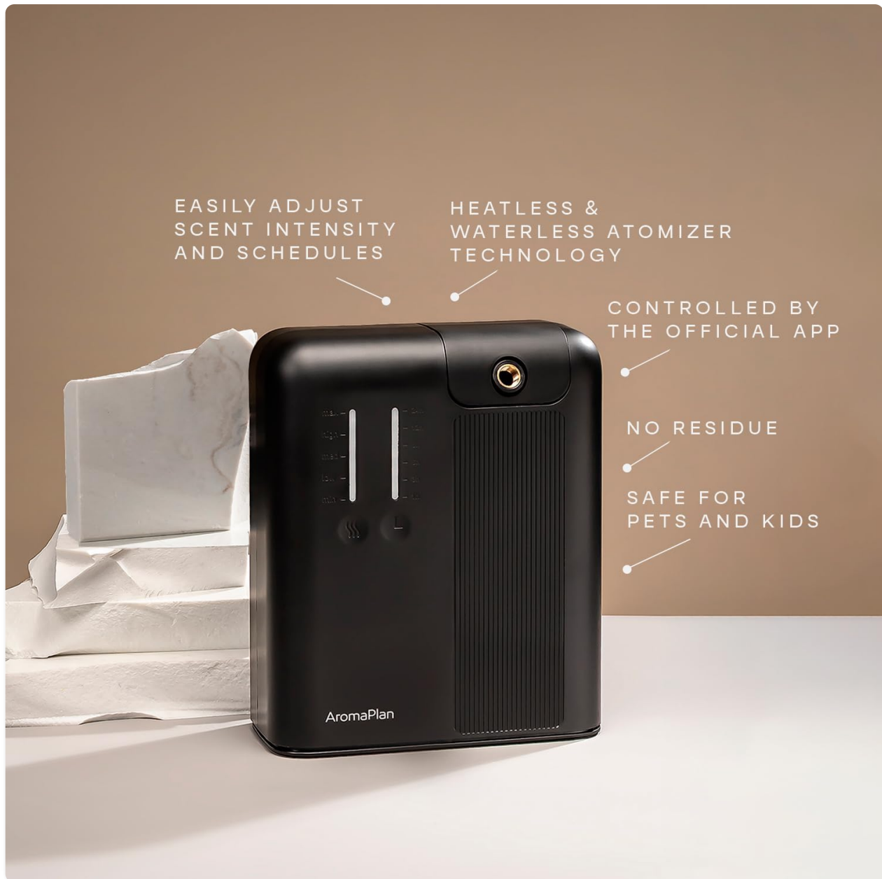
Figure 2: Key features of the AromaPlan DAP PRO 2025, including its heatless and waterless atomization technology, app control, and safety for pets and children.