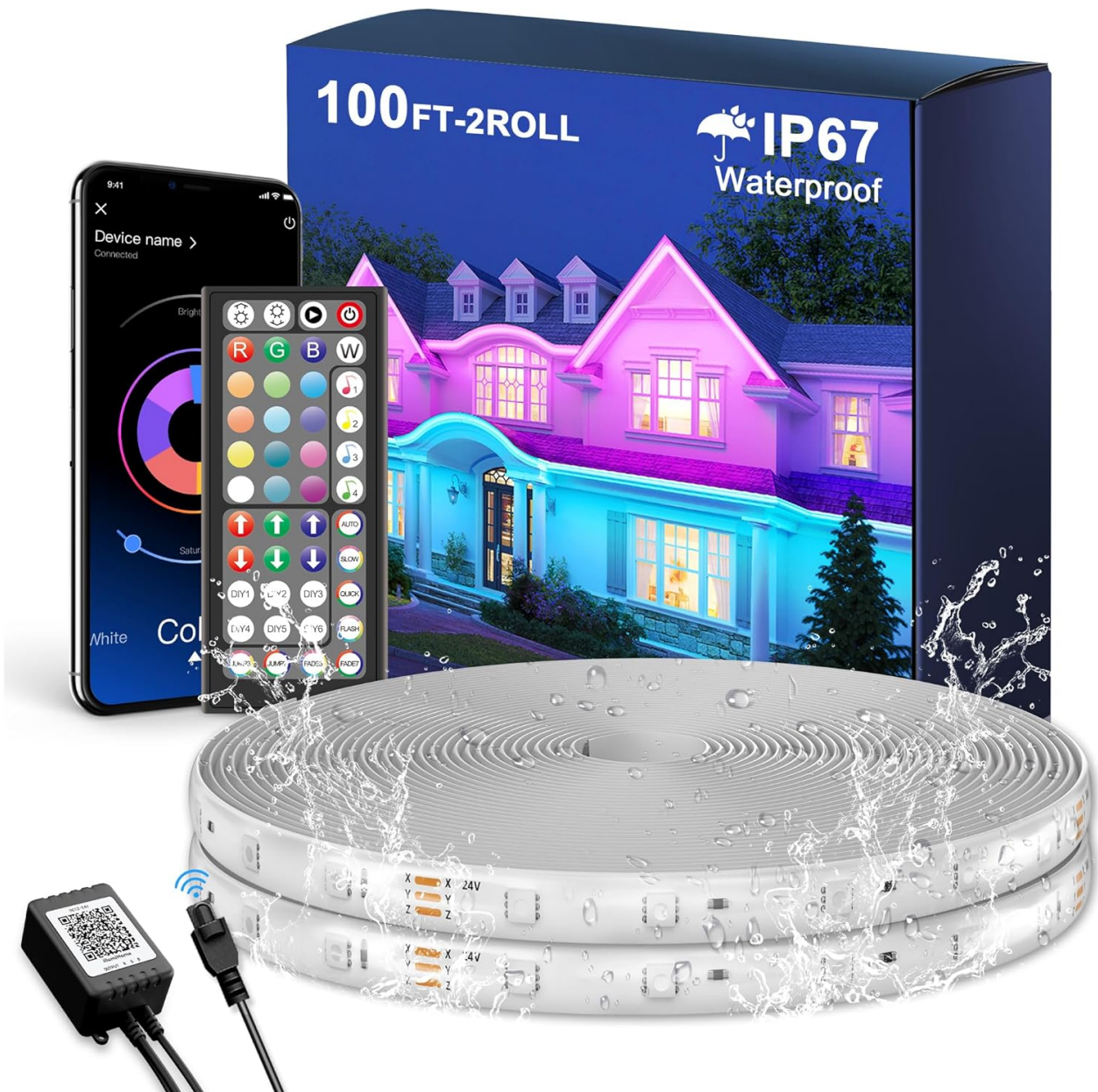
Figure 1: Fussion Outdoor LED Strip Lights, showing the packaging, two rolls of 50ft lights, remote, and control box.