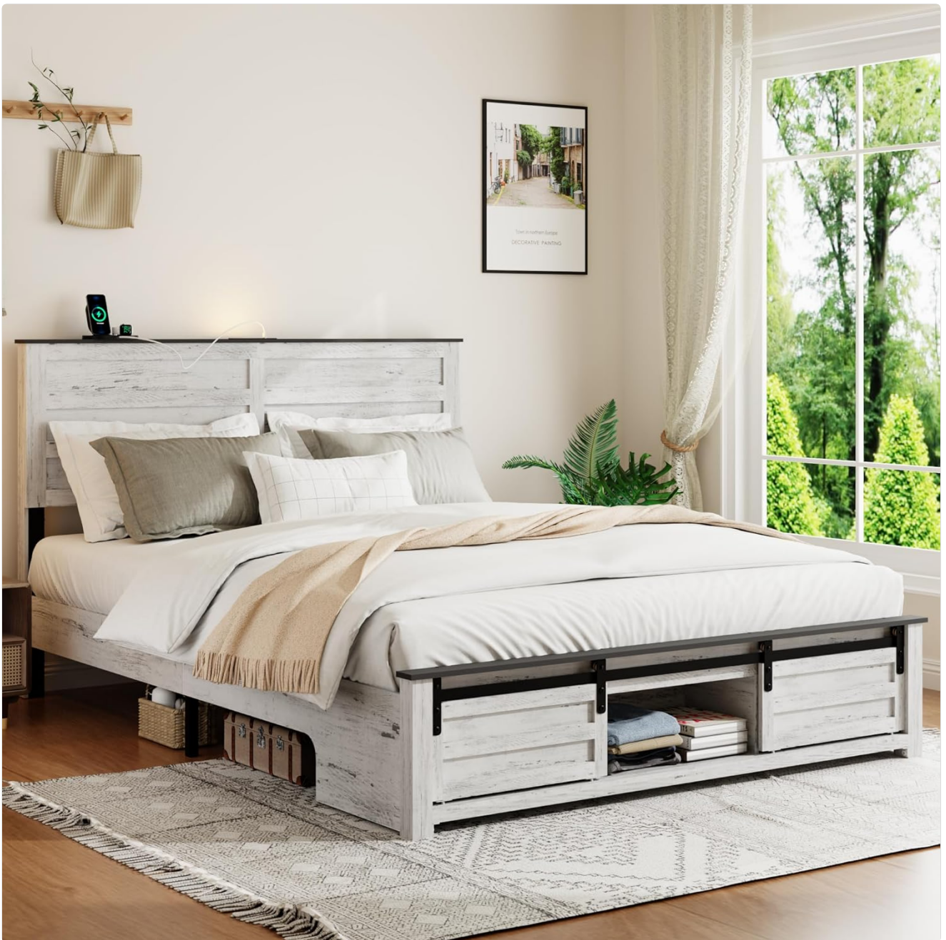
Figure 1: SAMTRA Queen Size Bed Frame in Boho White with storage footboard and charging headboard.