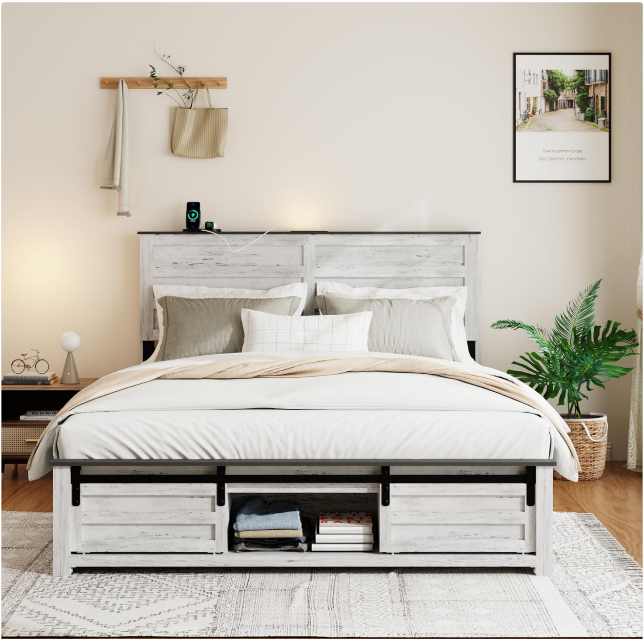
Figure 2: Front view of the assembled bed frame, illustrating the headboard and footboard design.