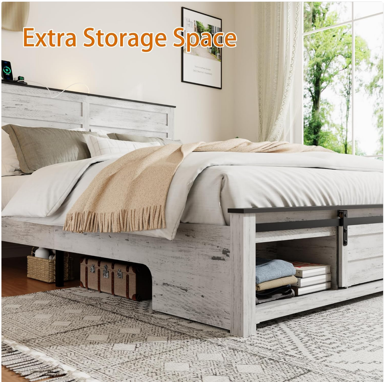
Figure 4: View of the footboard with the sliding barn doors open, revealing the storage space.

Your browser does not support the video tag.