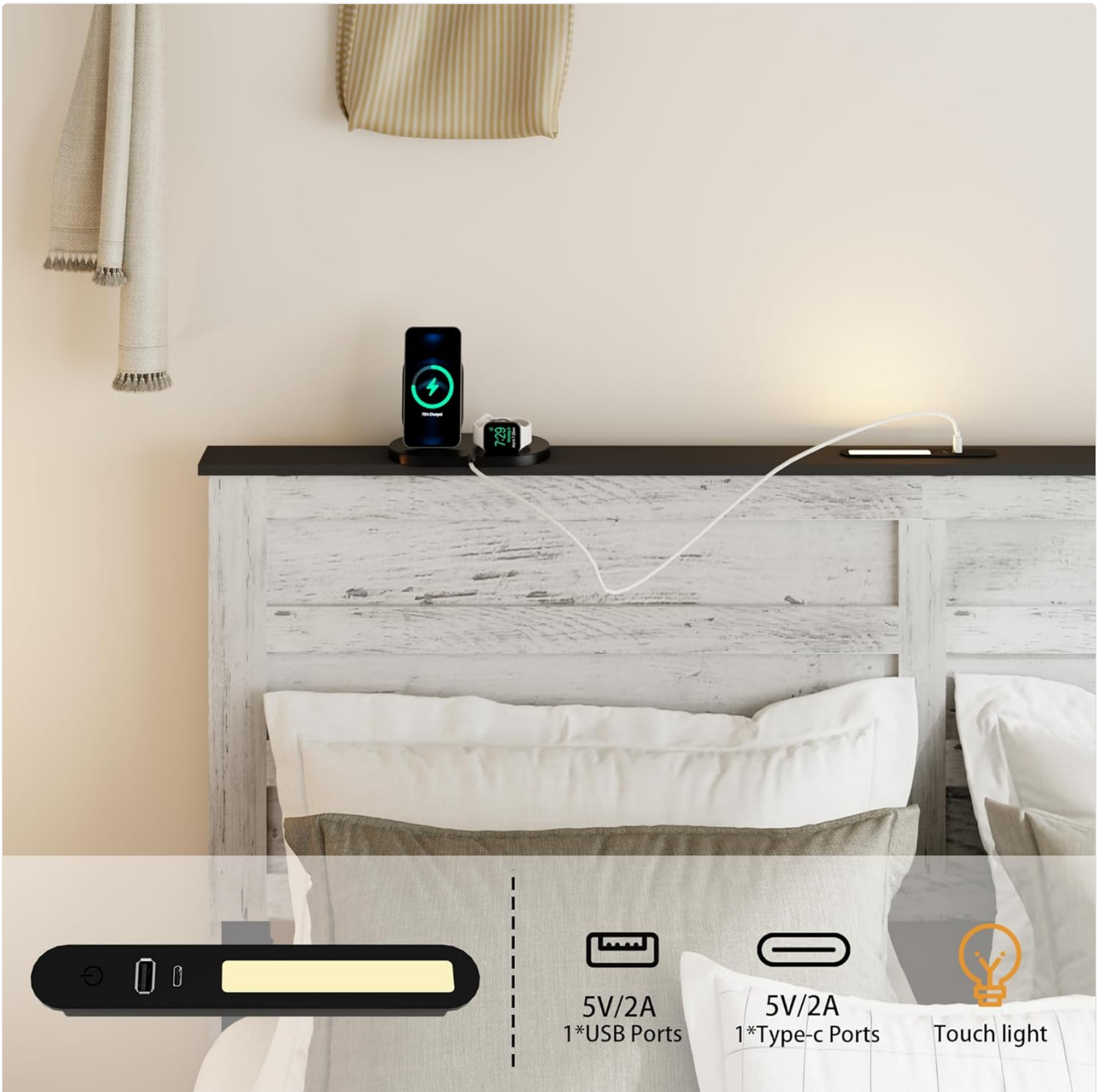
Figure 3: Close-up of the headboard showing the USB and Type-C charging ports and the LED light strip.