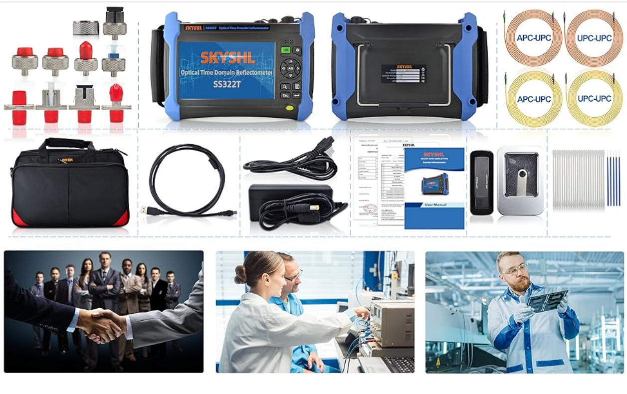
Figure 2: Detailed package list for the SS322T-4MB3 SM+MM Fiber OTDR.