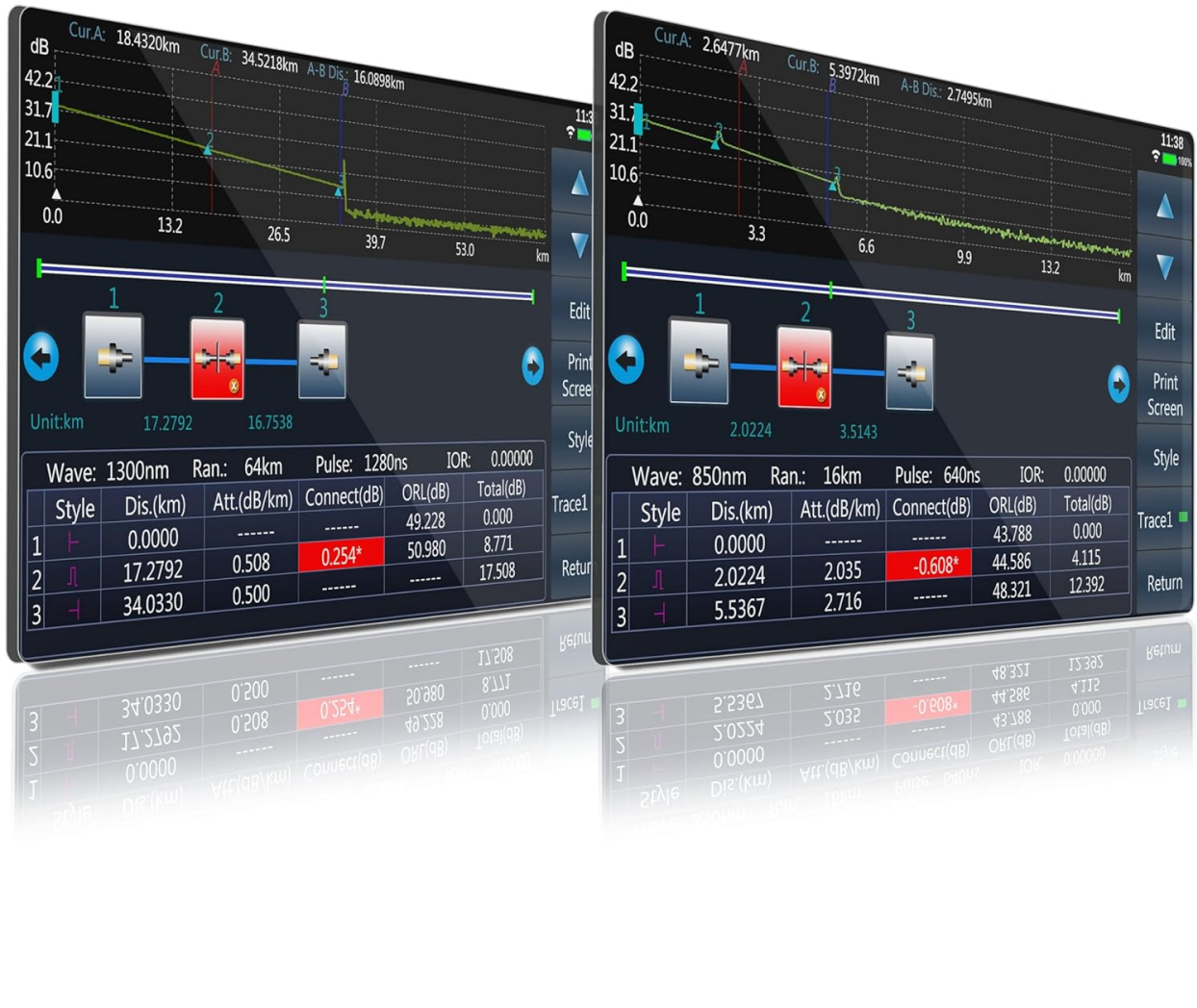
Figure 1: SKYSHL SS322T-4MB3 OTDR Fiber Tester and included accessories.