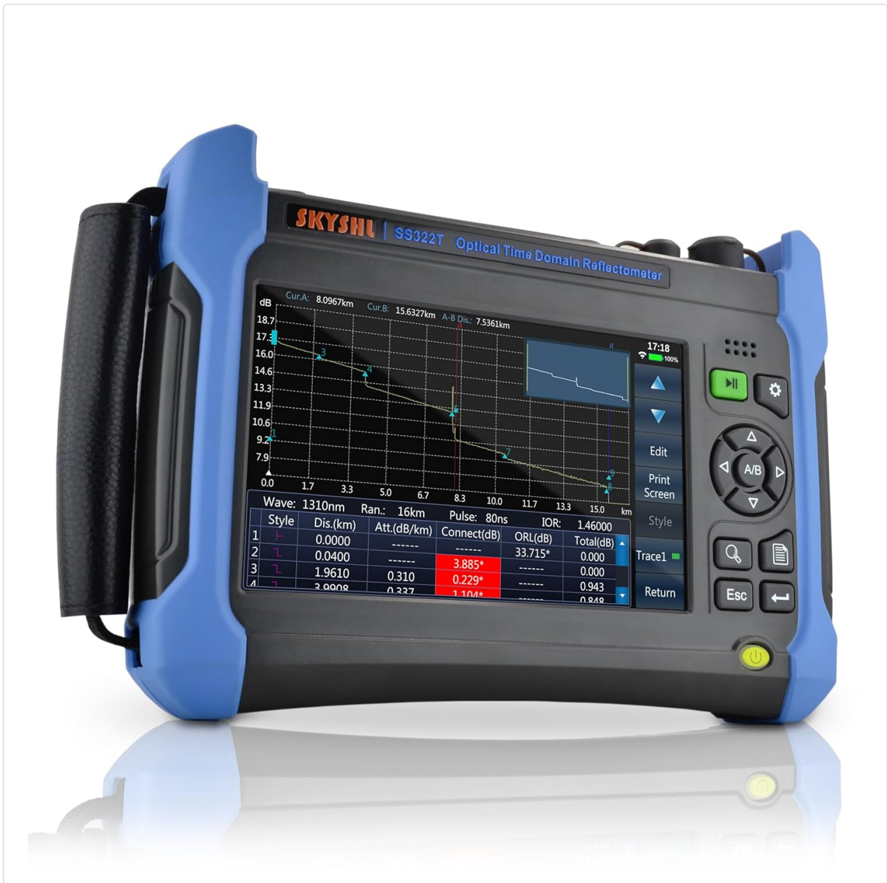
Figure 3: Front view of the SKYSHL SS322T-4MB3 OTDR Fiber Tester.