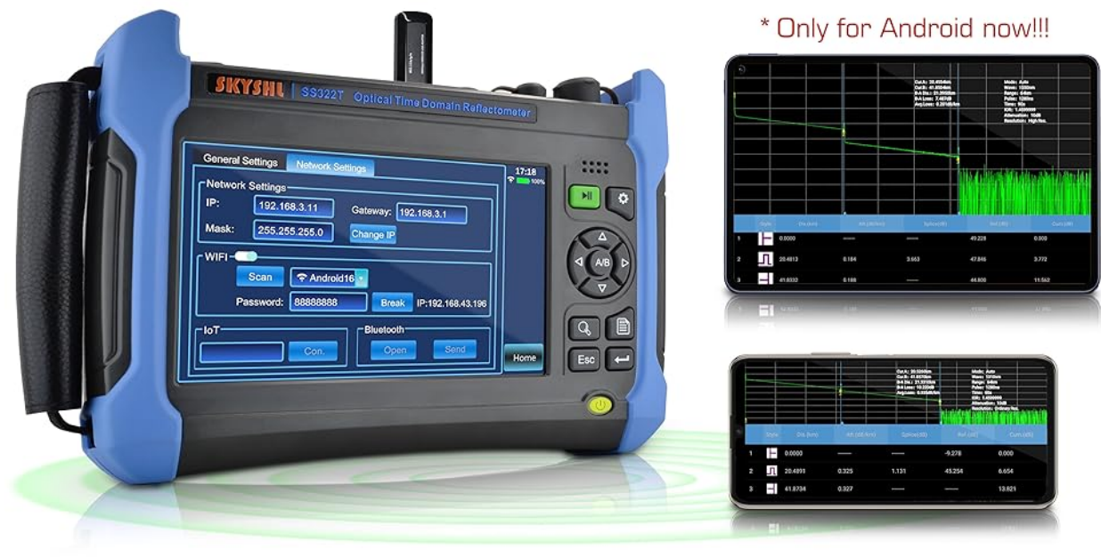
Figure 7: Smart APP Software for Android and Windows connectivity.

The SS322T can be connected to Android devices and PC by the APP module and can view, share, analyze, and save test curves on Android devices.