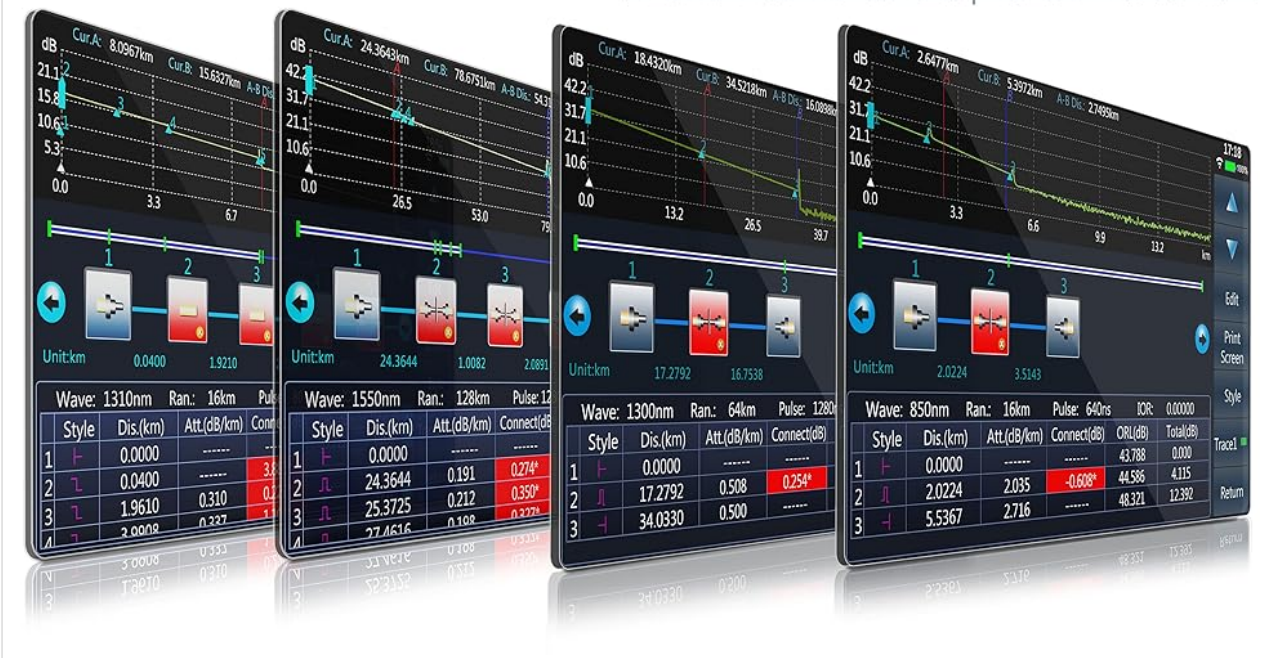
Figure 6: Event Map/Graphics Analysis Mode for simplified fault location.

Maximization makes testing simple and perfectly locates and identifies network components and faults