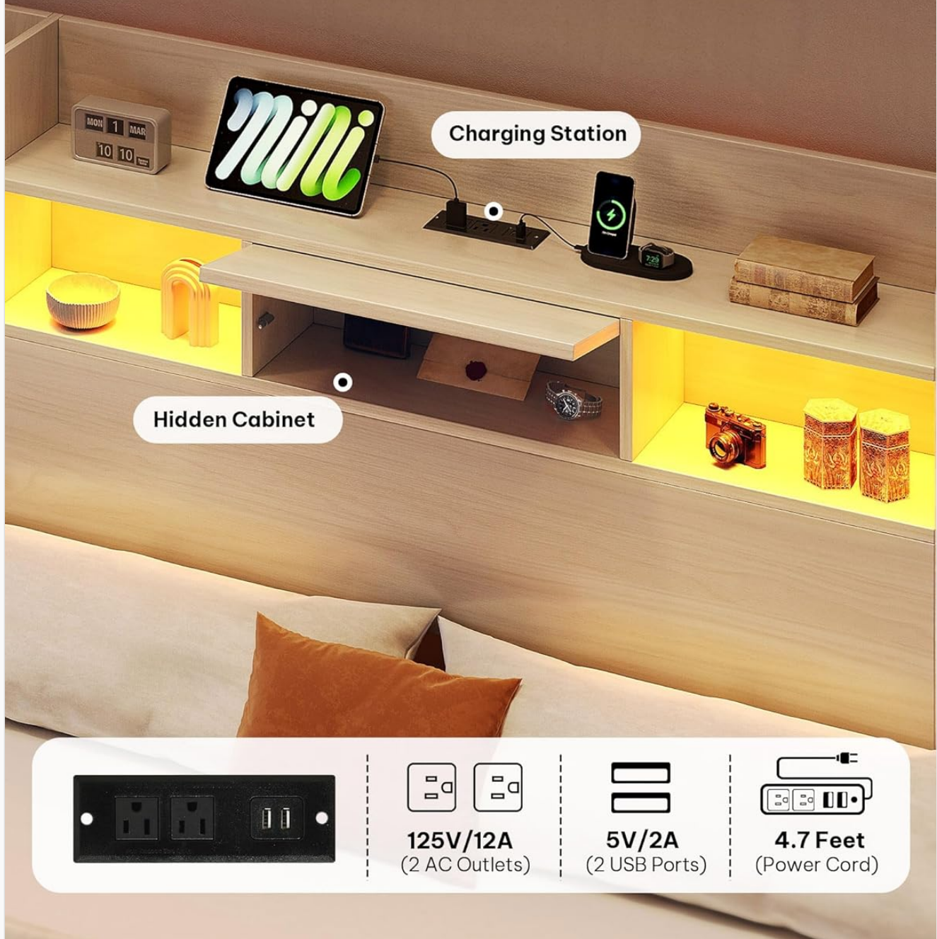
Image: The headboard displaying the integrated charging station with devices connected, alongside the hidden cabinet and illuminated shelves.