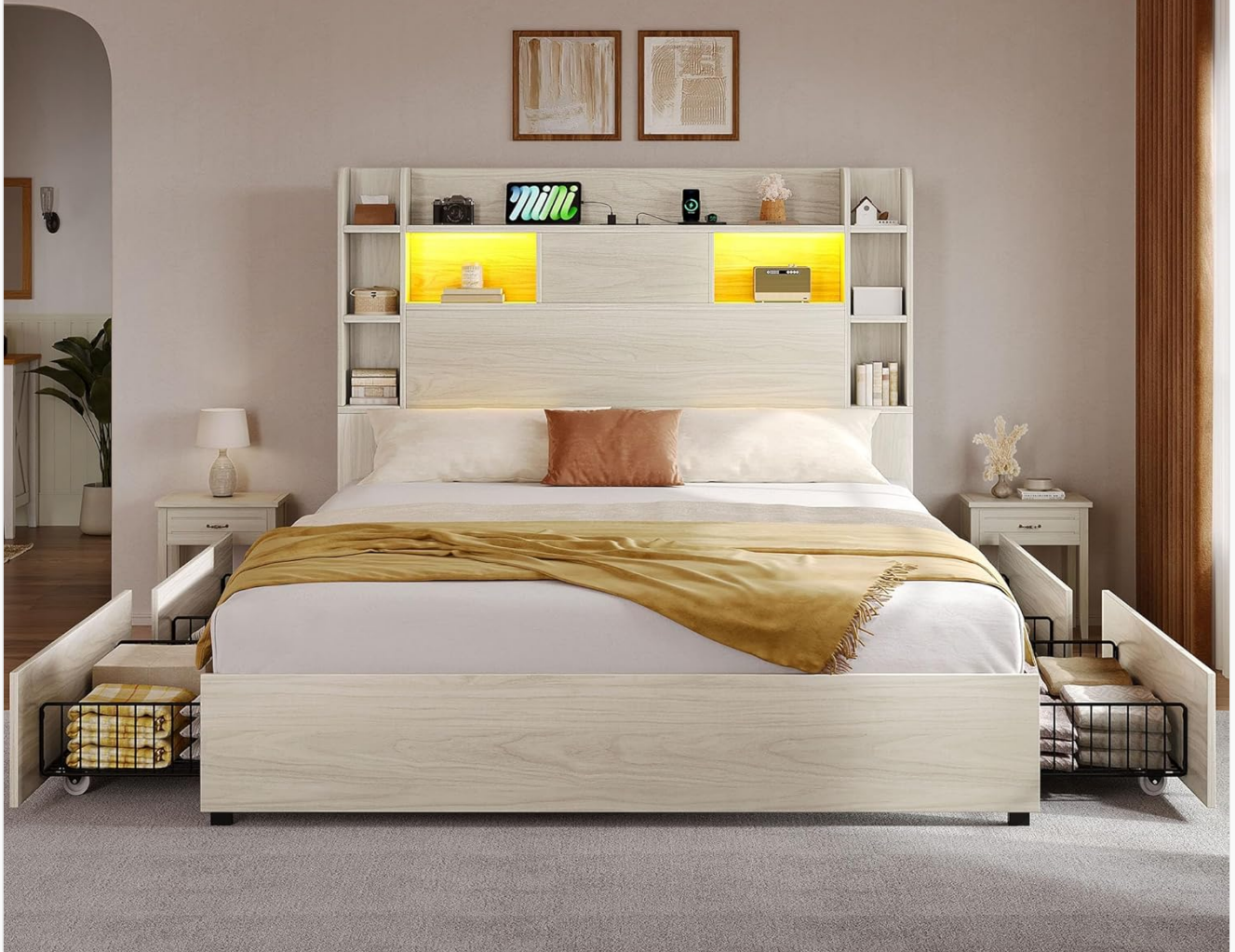
Image: The bed frame with all four under-bed storage drawers pulled out, revealing ample space for storing various items.

The storage bed offers 4 under-bed drawers for your daily clothing