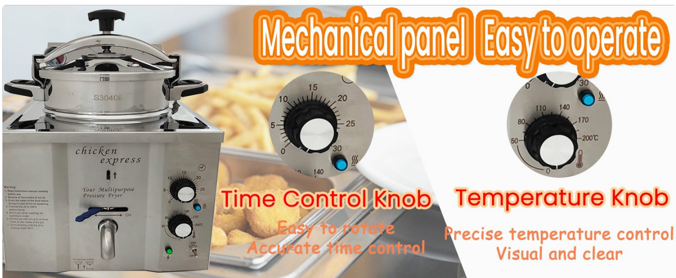
Image: Detailed view of the pressure fryer, highlighting key components such as the lid knob, pressure gauge, valve pin, oil drain valve, oil drain, time relay, thermostat, and power switch.

The Banfluxion Commercial Electric Countertop Pressure Fryer is constructed from 304 stainless steel for durability and ease of cleaning. It features an enclosed heating system that separates heating elements from cooking oil, which helps prevent food residue buildup and contributes to equipment longevity.