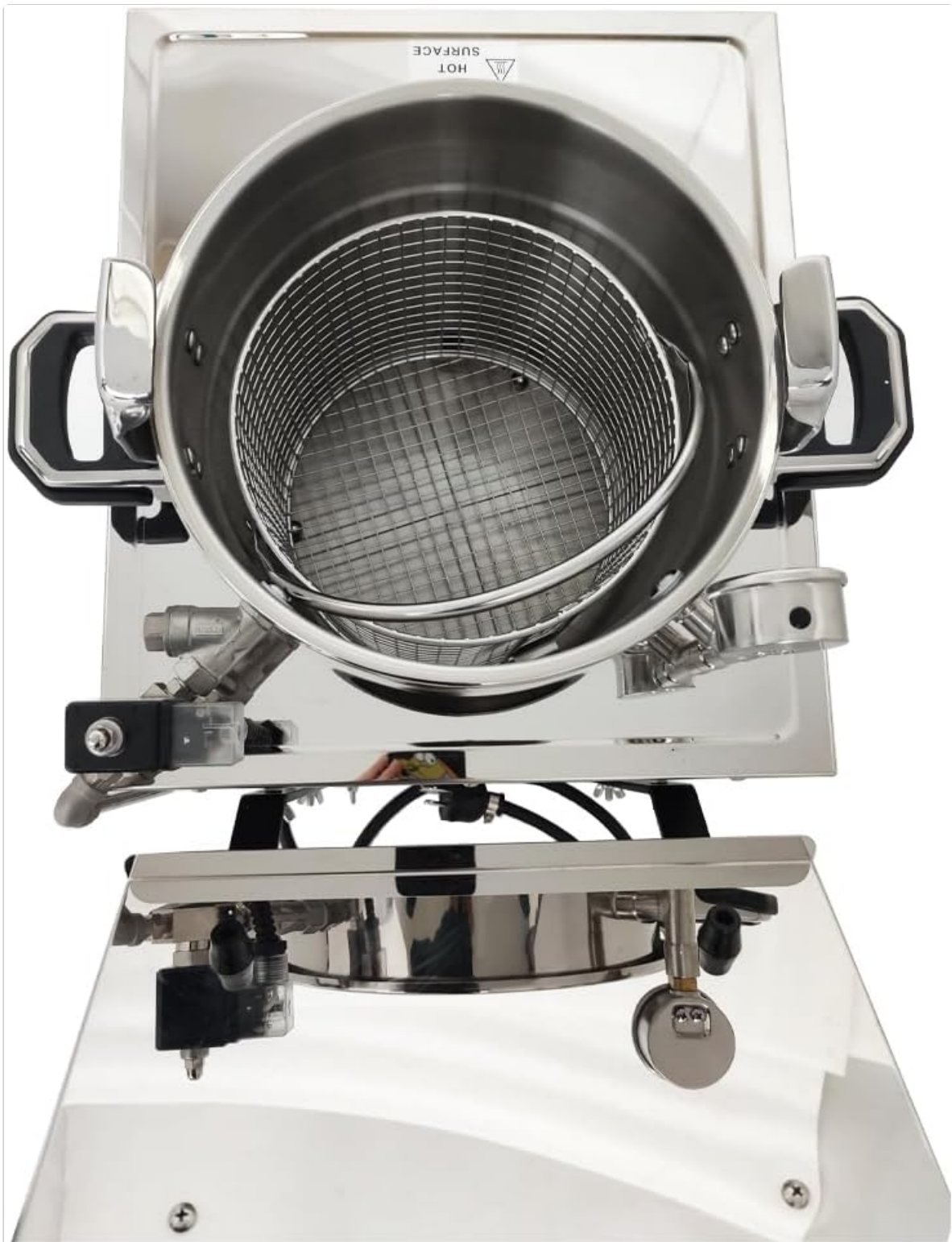
Image: An overhead view of the fryer's interior, showing the removable fry basket.