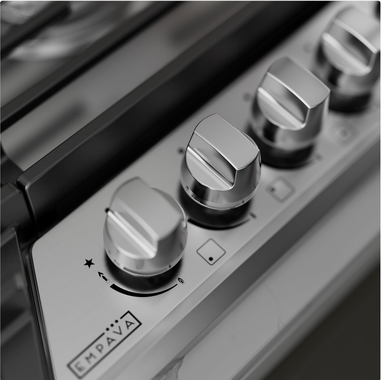
Figure 4.1: The cooktop features five control knobs for precise flame adjustment.