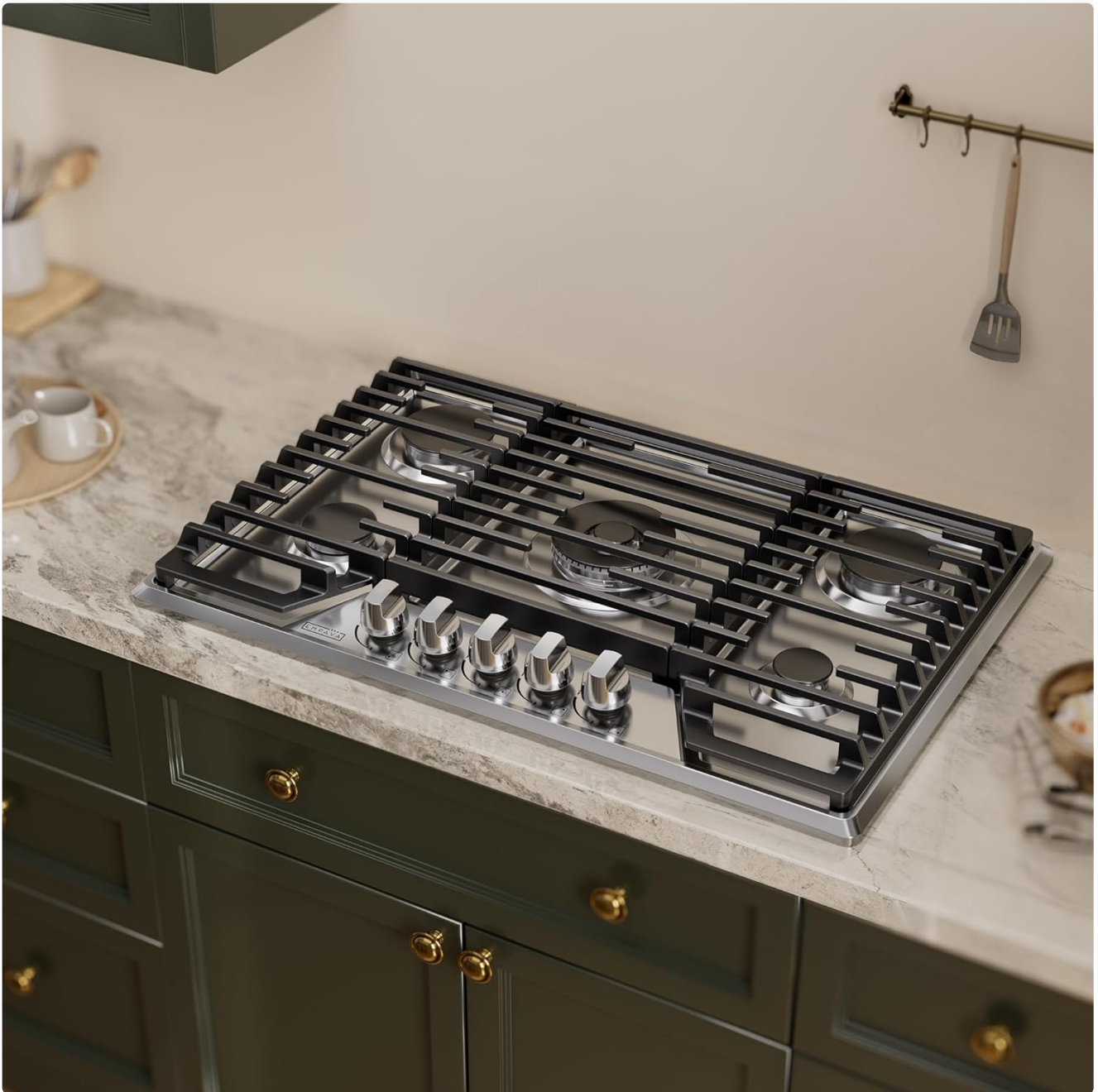
Figure 2.1: Empava 30-inch gas cooktop with five burners and stainless steel finish.