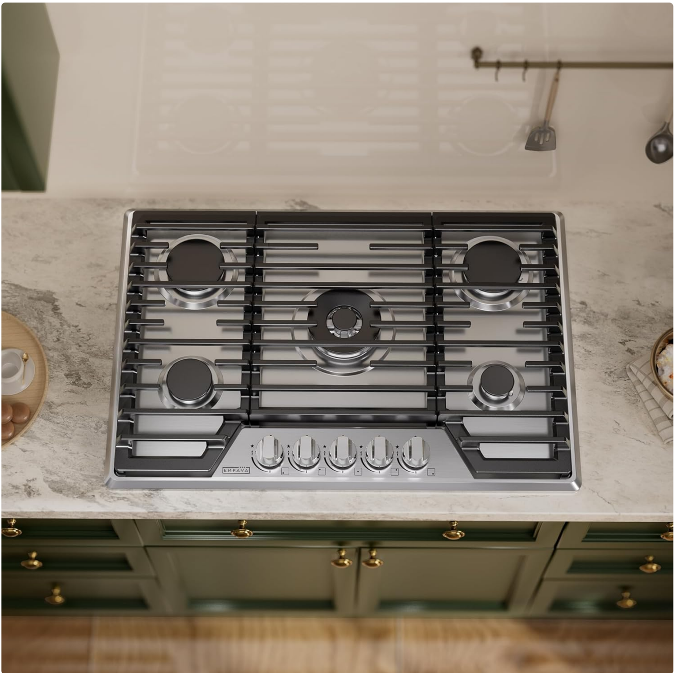
Figure 2.2: Overhead view of the cooktop, highlighting the arrangement of the five burners.