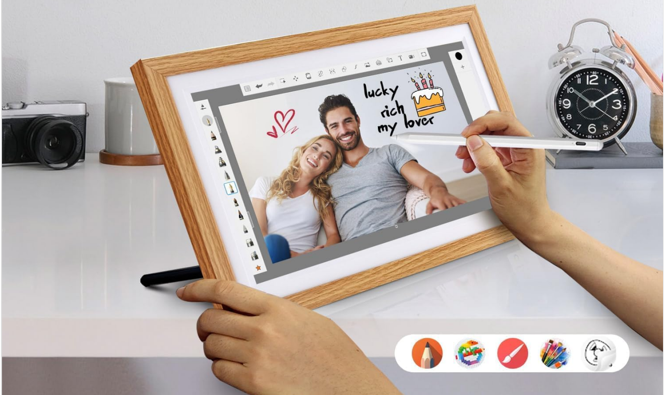
Image: Portable Digital Drawing Tablet. Supports stylus pens for a better writing experience.

For a better writing experience, please purchase our CM150 or other brands of active stylus pen. Our products support MPP active stylus pen.