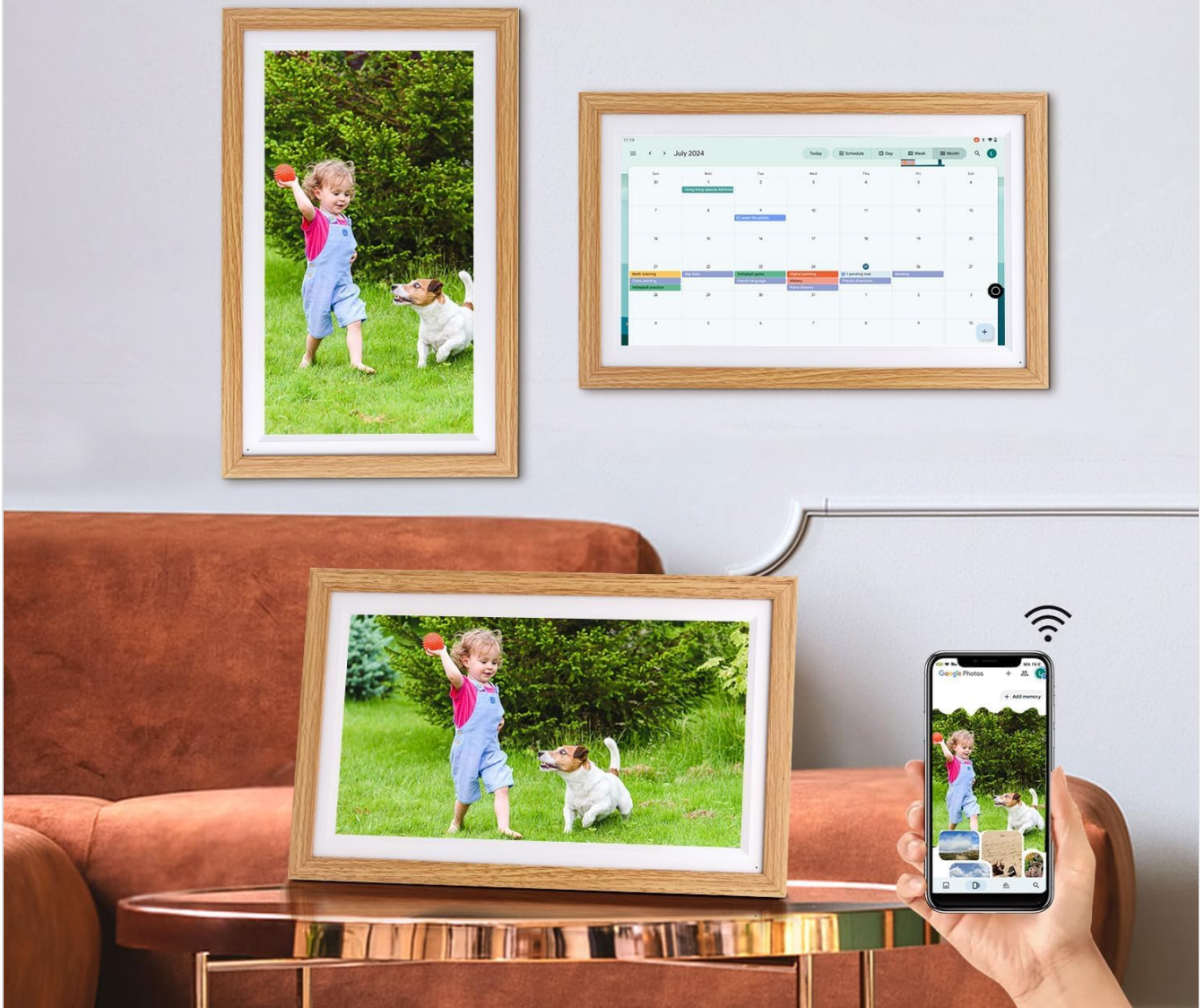
Image: More than a digital frame. Add new photos and videos anytime, anywhere, and display them in various orientations.

Add new photos and videos anytime, anywhere.