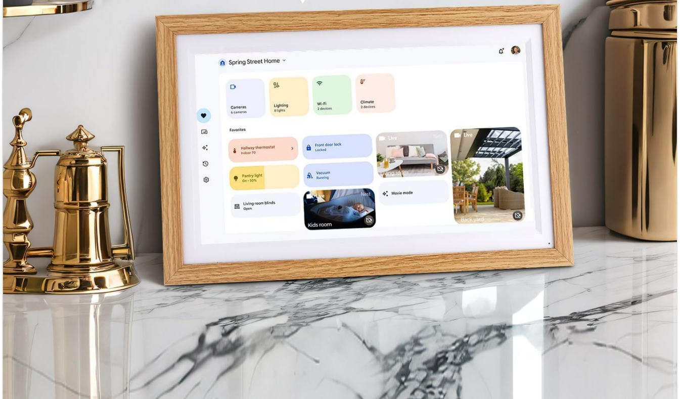
Image: Smart Homehub. More control, more entertainment, more help comes with every part of the day on the display.