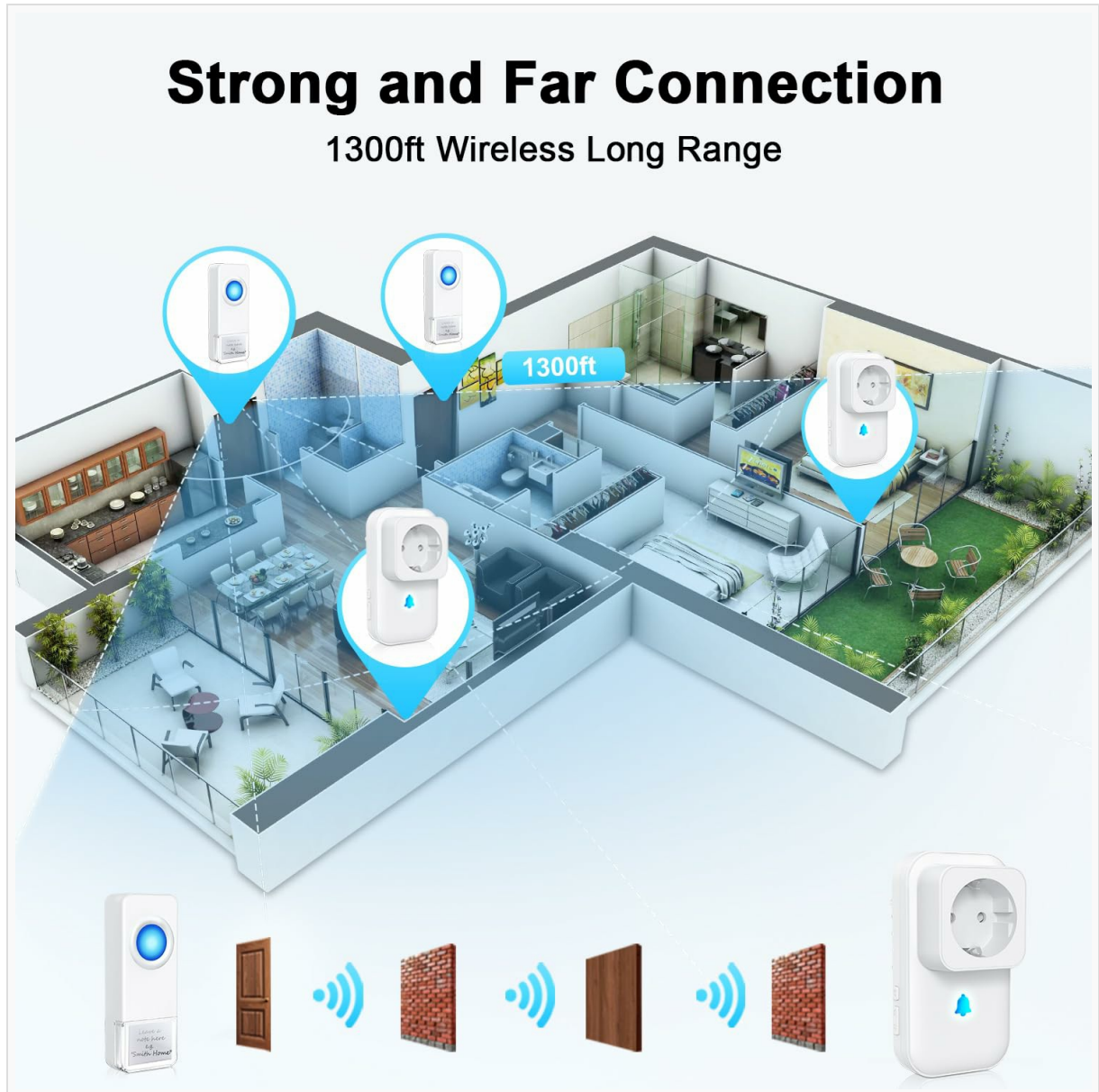
Image: An overhead diagram of a multi-room house, showing the placement of multiple doorbell receivers and transmitters to achieve a strong and far connection with a wireless range of up to 1300 feet. The diagram also illustrates how signals can pass through various obstacles like doors and walls.

Ensure the transmitter is installed in a location where it is easily accessible to visitors and provides optimal wireless signal to the receiver.