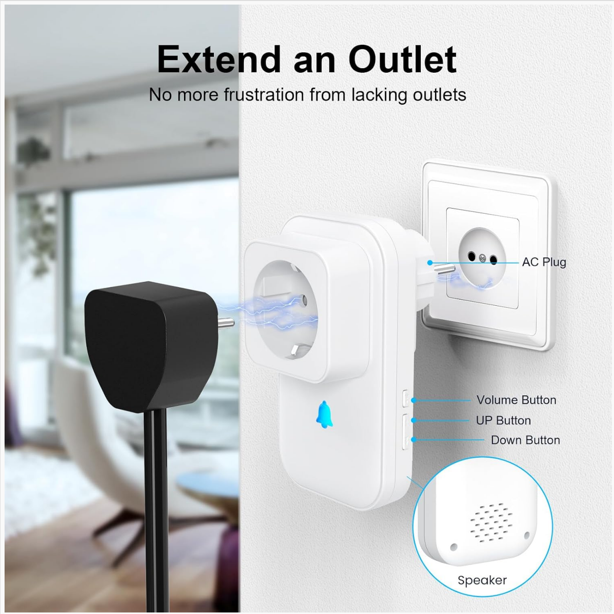
Image: A close-up of the BITIWEND doorbell receiver plugged into a wall outlet, illustrating its integrated AC plug and the location of the Volume, Up, and Down buttons on its side, along with the speaker at the bottom.

No more frustration from lacking outlets