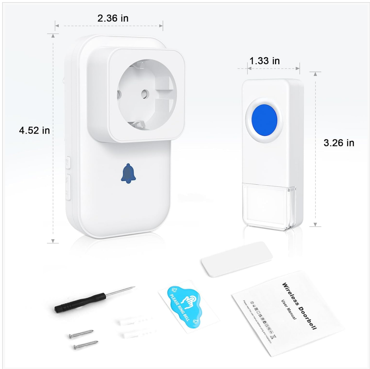
Image: Overview of the BITIWEND Wireless Doorbell Kit, showing the plug-in receiver, the push-button transmitter, and the included installation hardware such as screws, anchors, and adhesive tape. The image also displays the user manual and the dimensions of both units.