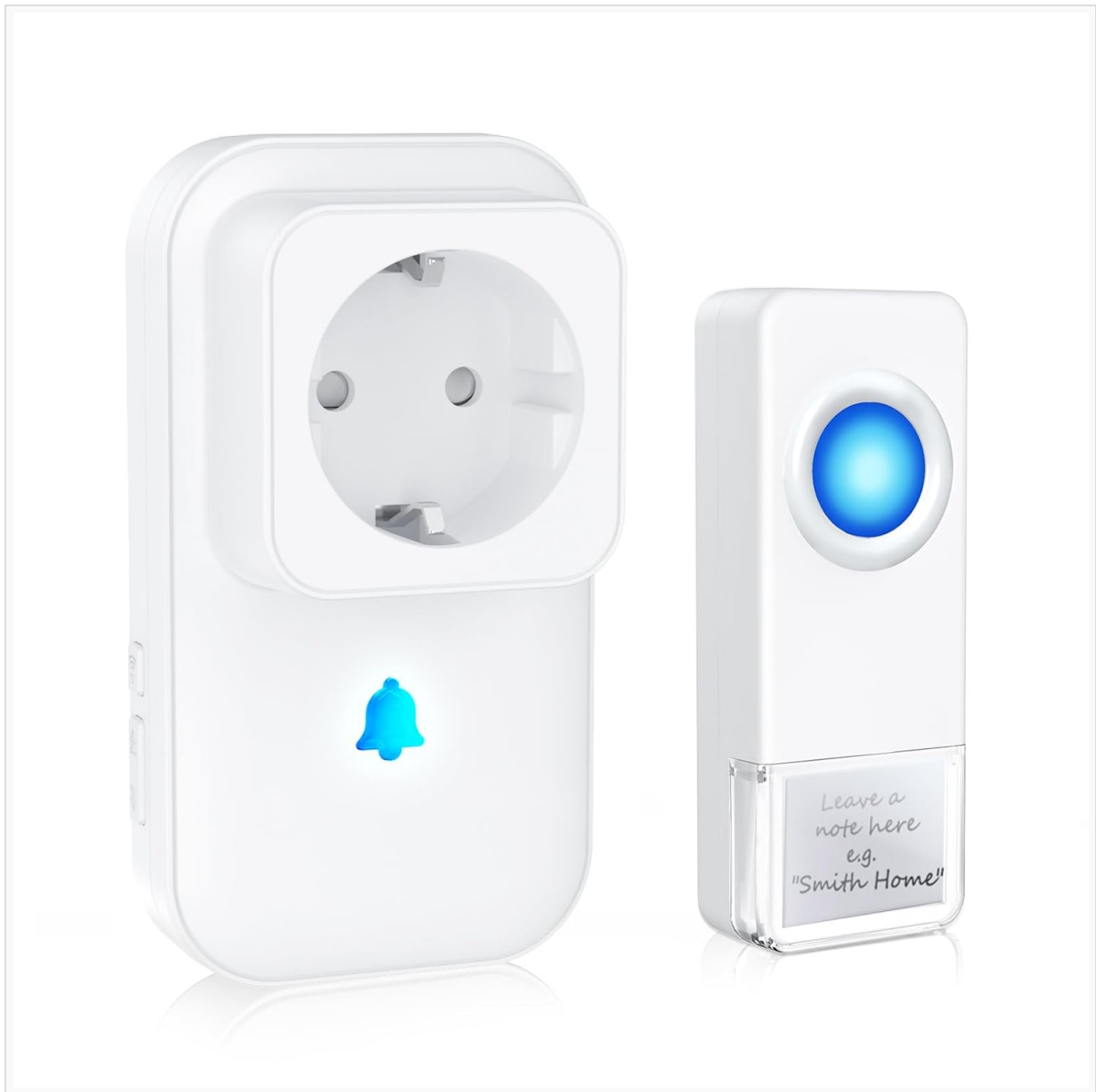
Image: The BITIWEND Wireless Doorbell Kit, featuring the white plug-in receiver with an integrated socket and a blue LED bell icon, alongside the white push-button transmitter with a blue LED ring and a clear label holder.