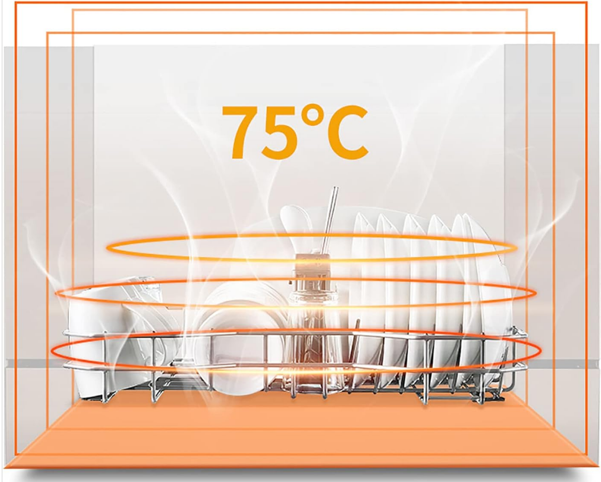
Figure 5: Illustration of the 75°C waste heat drying process for energy efficiency.

Use the high-temperature steam of the inner tank to promote physical condensation and drying, and reduce the growth of mold and odor in the machine