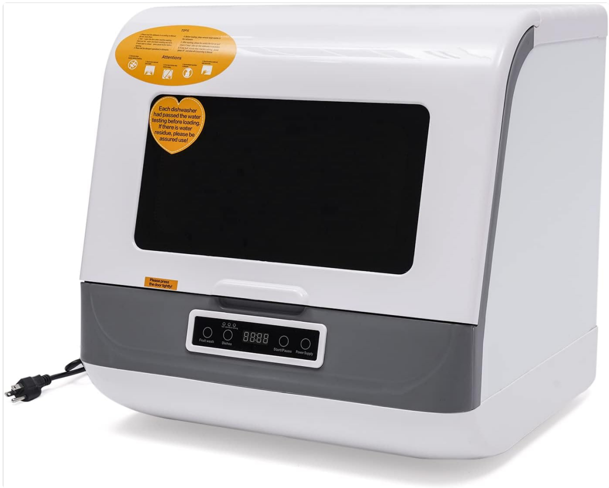
Figure 1: Front view of the InnaMall Portable Countertop Dishwasher, showing the control panel and viewing window.