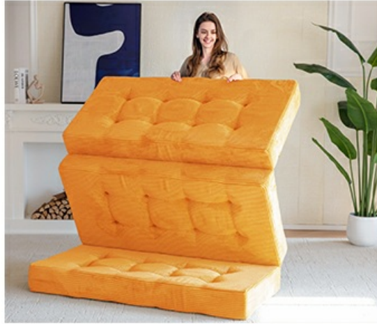
Figure 1: Vacuum-sealed sofa bed upon unpacking.

At the core of our brand is 'Versatility'. Our products offer a wide range of options, from diverse styles of floor mattresses, versatile sofas, to cozy bean bag beds.