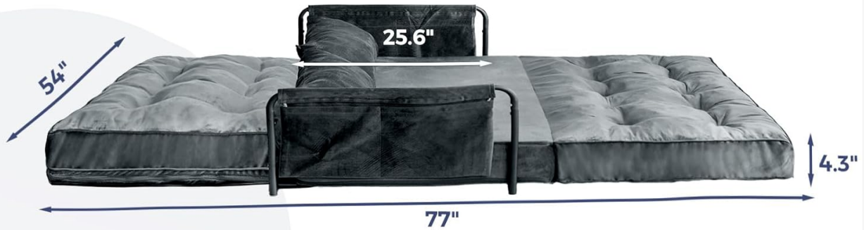
Figure 7: Product dimensions.