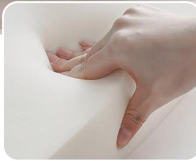
High-Density Base Support Foam