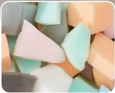
Shredded Foam Filling