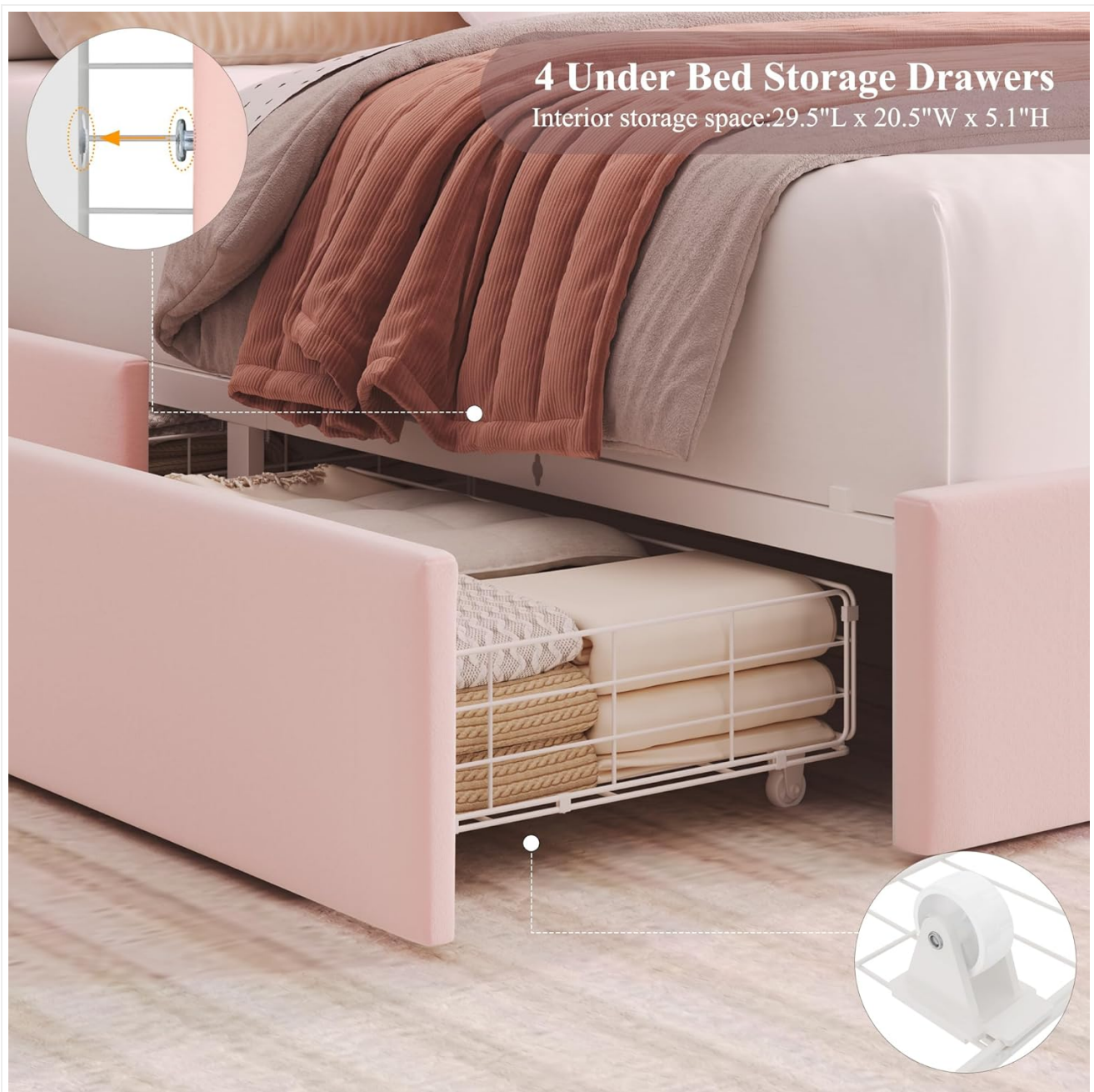
Image: The under-bed storage drawers pulled out, showing their capacity for storing various household items.