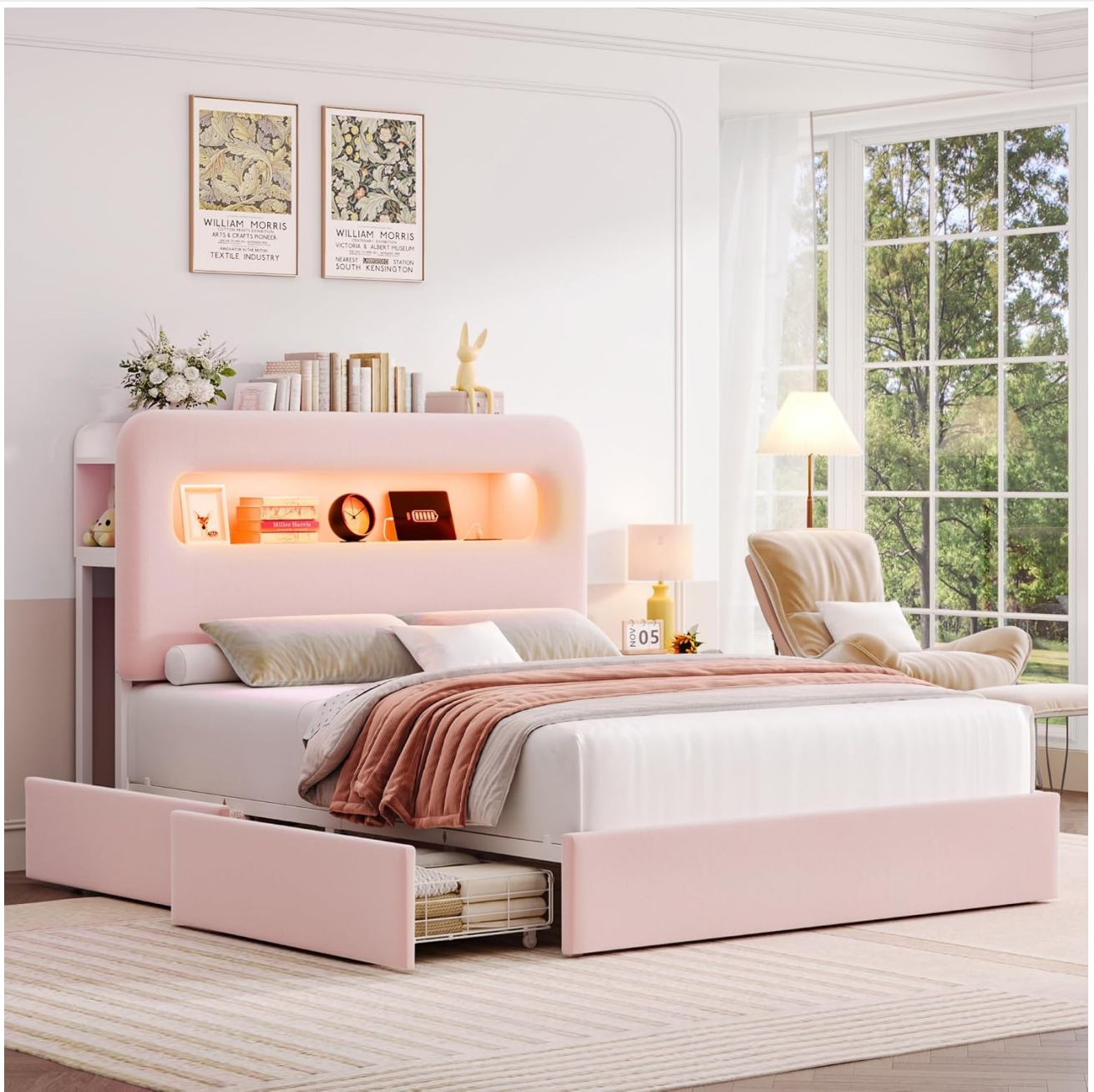
Image: Fully assembled HOSTACK Full LED Bed Frame in pink, showcasing the storage headboard with LED lighting and under-bed drawers.