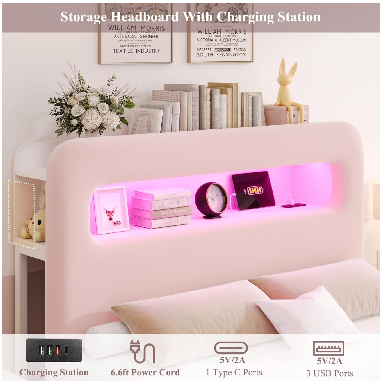
Image: A close-up view of the integrated charging station, highlighting the USB and Type-C ports available for device charging.