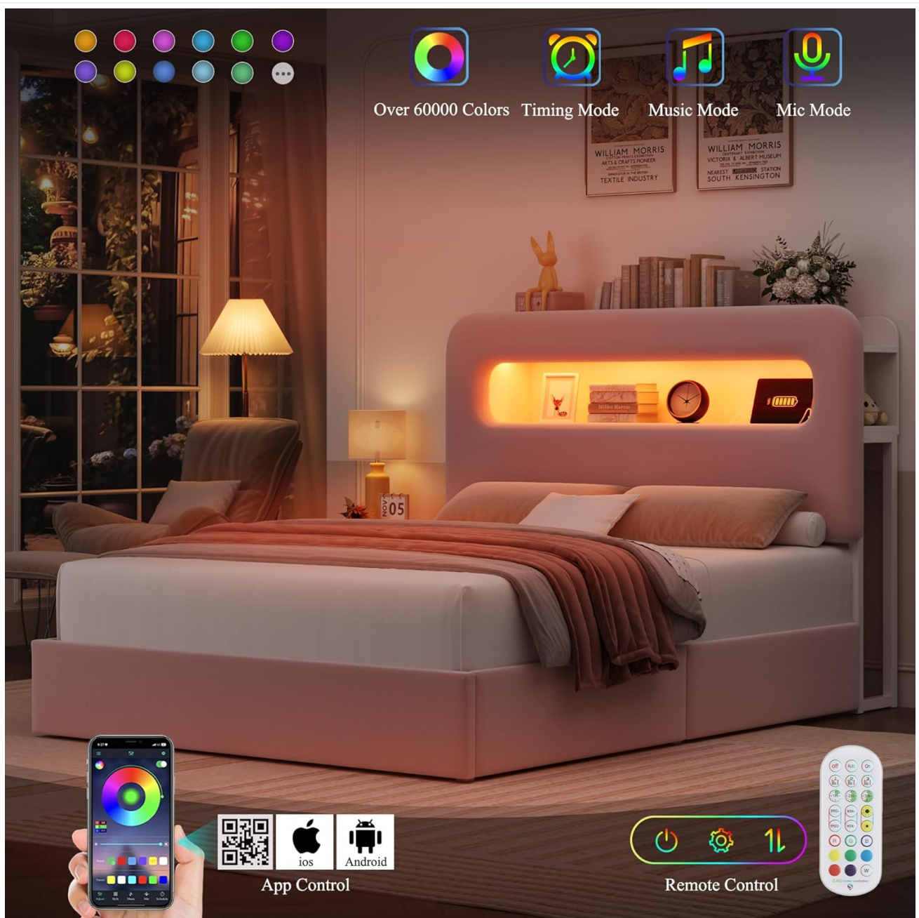
Image: The bed frame's headboard illuminated with various LED colors, demonstrating control via a remote and a mobile application interface.