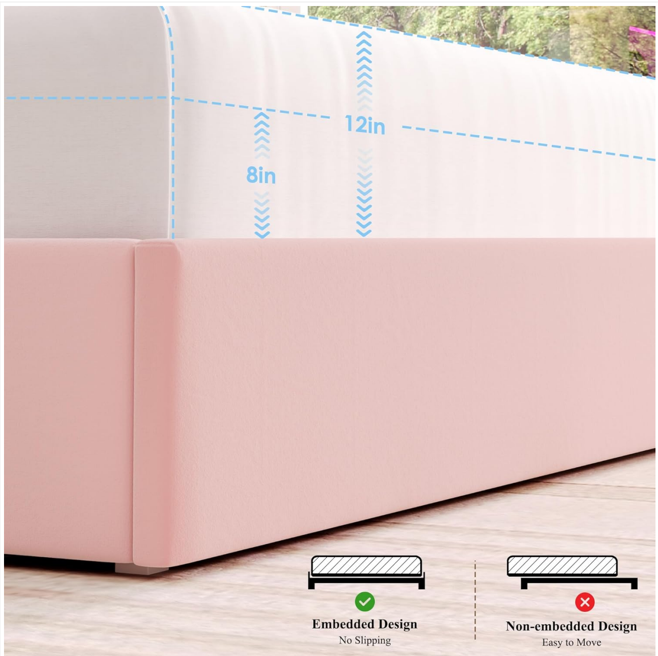
Image: A visual guide indicating the recommended mattress height (8-12 inches) for optimal fit and appearance with the bed frame.