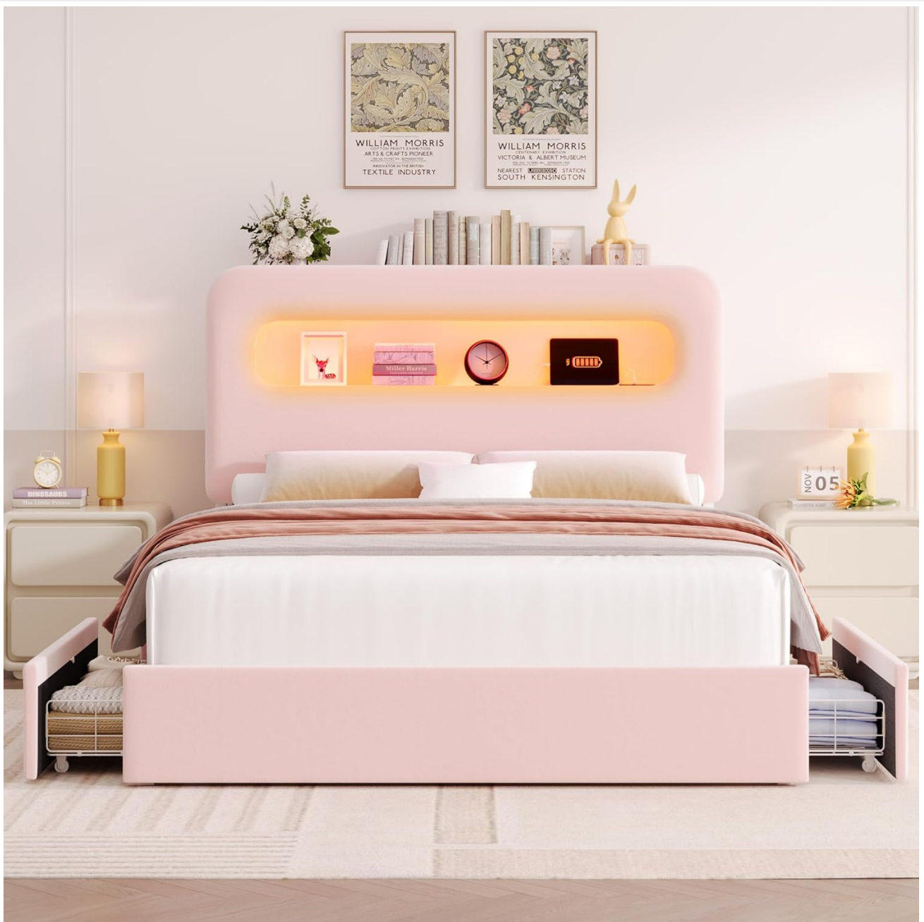
Image: The bed's headboard showcasing its central illuminated storage shelf and open compartments on the sides, ideal for various items.