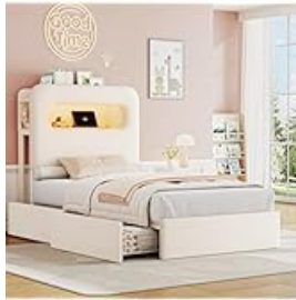
Figure 4: Illustration of the under-bed storage drawers and their dimensions (29.5"L x 20.5"W x 5.1"H).