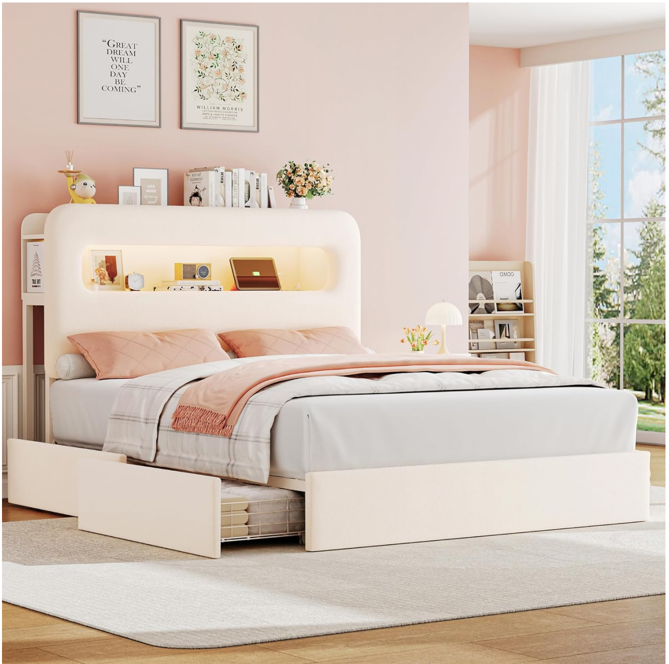
Figure 1: Fully assembled HOSTACK Full LED Bed Frame in Cream.