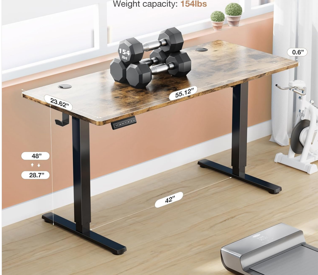
Image: A diagram illustrating the product dimensions of the edx desk, including desktop length (55.12 inches), width (23.62 inches), and thickness (0.6 inches). The maximum weight capacity is 154 lbs.