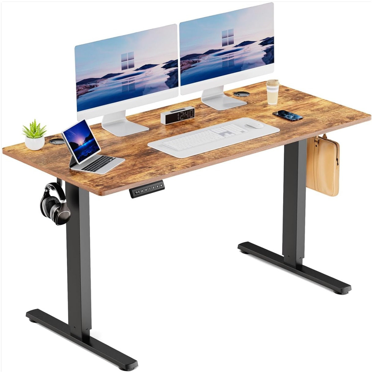
Image: The edx Electric Adjustable Height Desk, showcasing its spacious desktop and ergonomic design with two monitors and various office accessories.