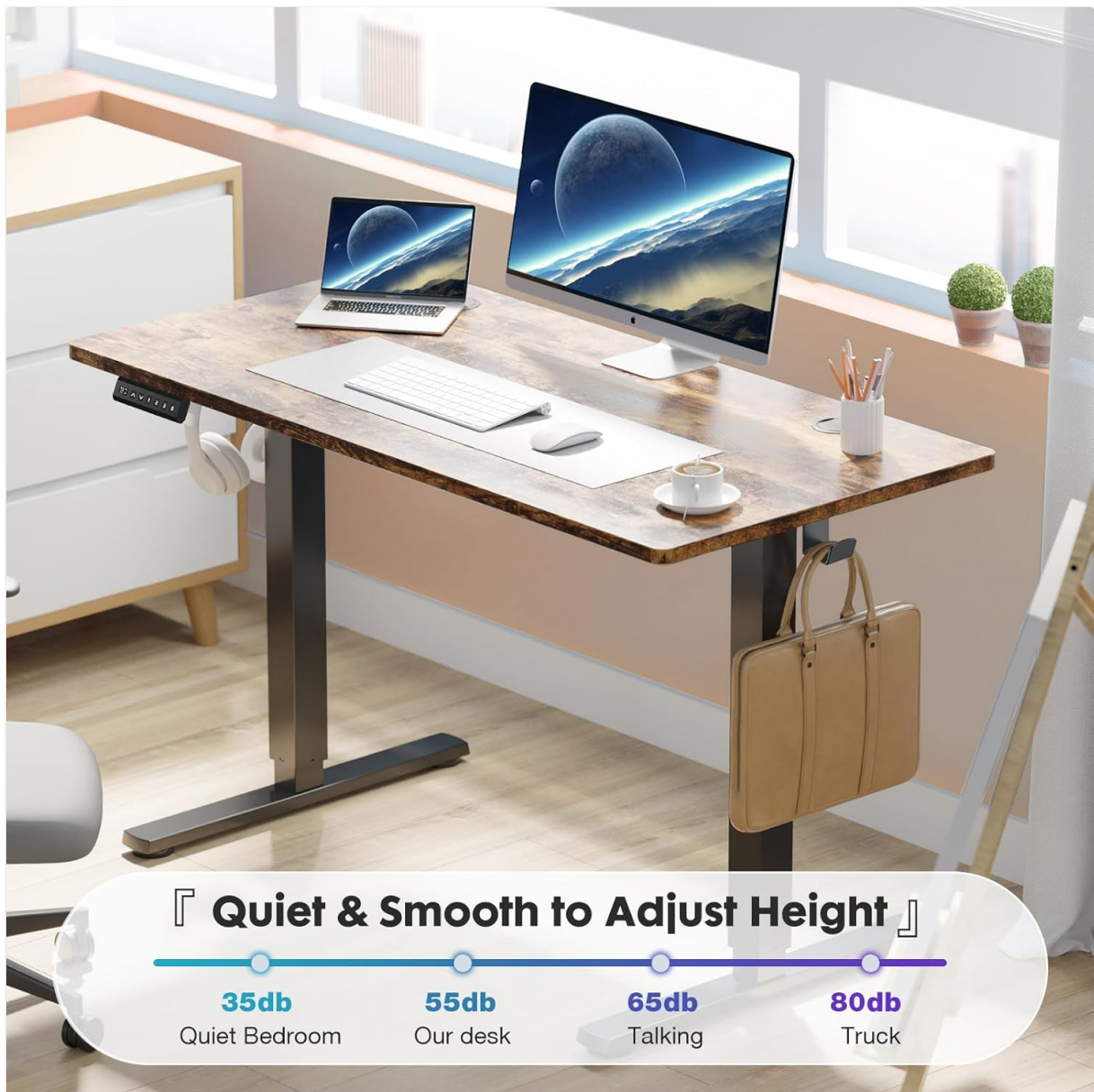
Image: A graphic comparing the noise level of the edx desk (55dB) to other common sounds like a quiet bedroom (35dB), talking (65dB), and a truck (80dB), highlighting its quiet operation.