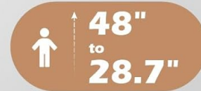
Image: A visual representation of the desk's height adjustment capabilities, showing a person comfortably using the desk in both standing (48 inches) and sitting (28.7 inches) positions.

A Height Adjustable Desk for All Height with