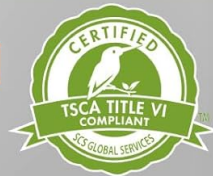
Image: A close-up of the desk's eco-friendly desktop, highlighting its wood grain finish and a certification indicating compliance with TSCA Title VI standards for healthy indoor air quality.

Eco-friendly Desktop Meet CARB Standard Material, Keep Your Home Healthy.