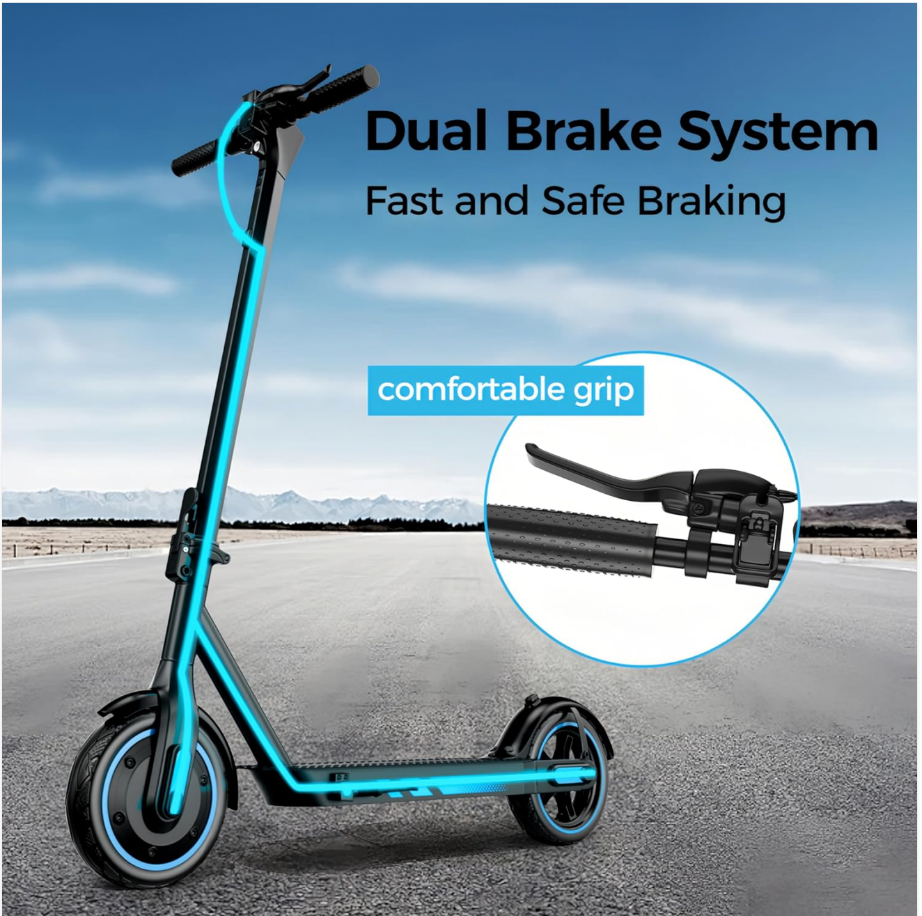
Image: Visual representation of the dual brake system and ergonomic grips.