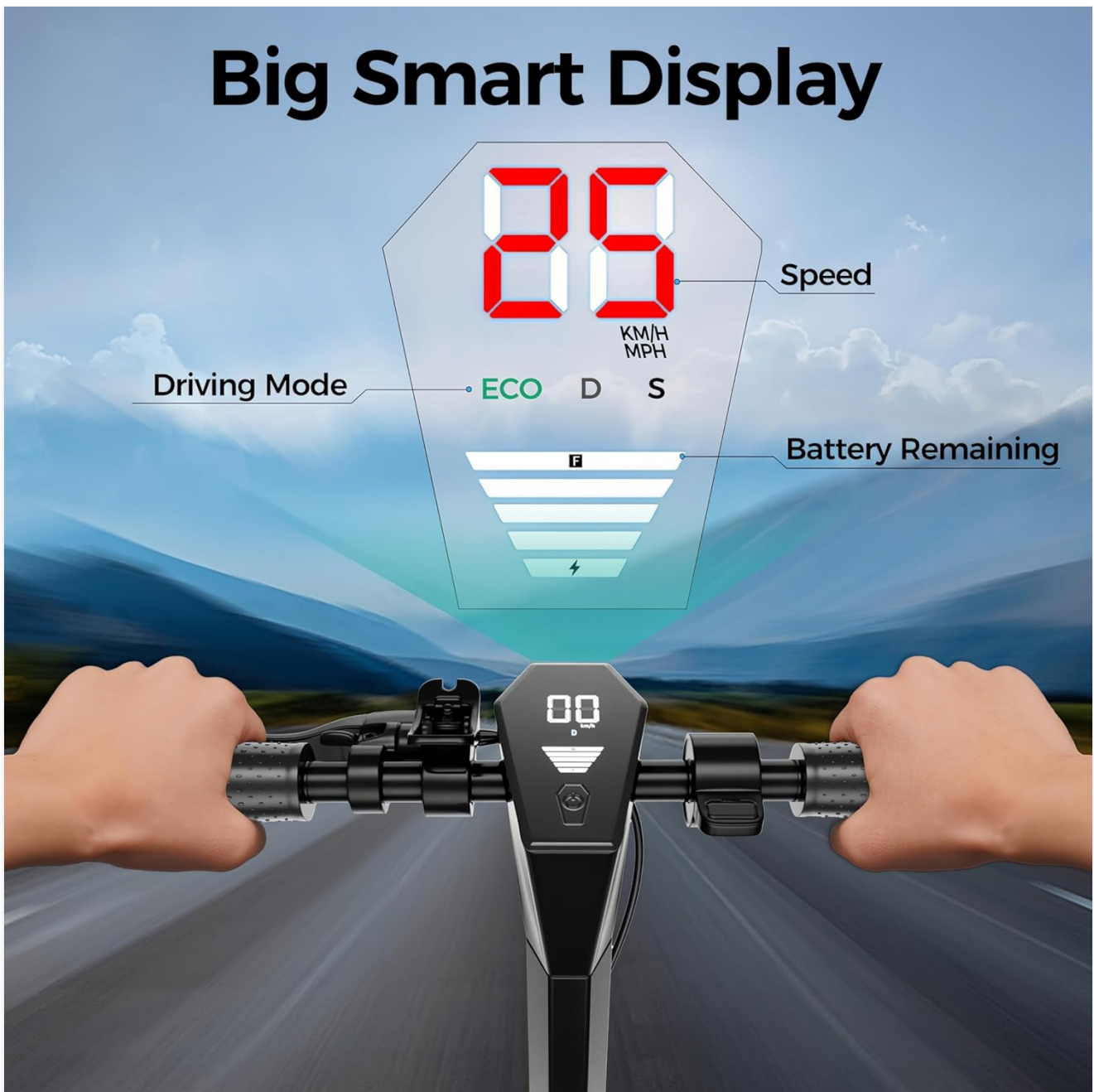
Image: The smart LCD display showing speed, driving mode, and battery status.