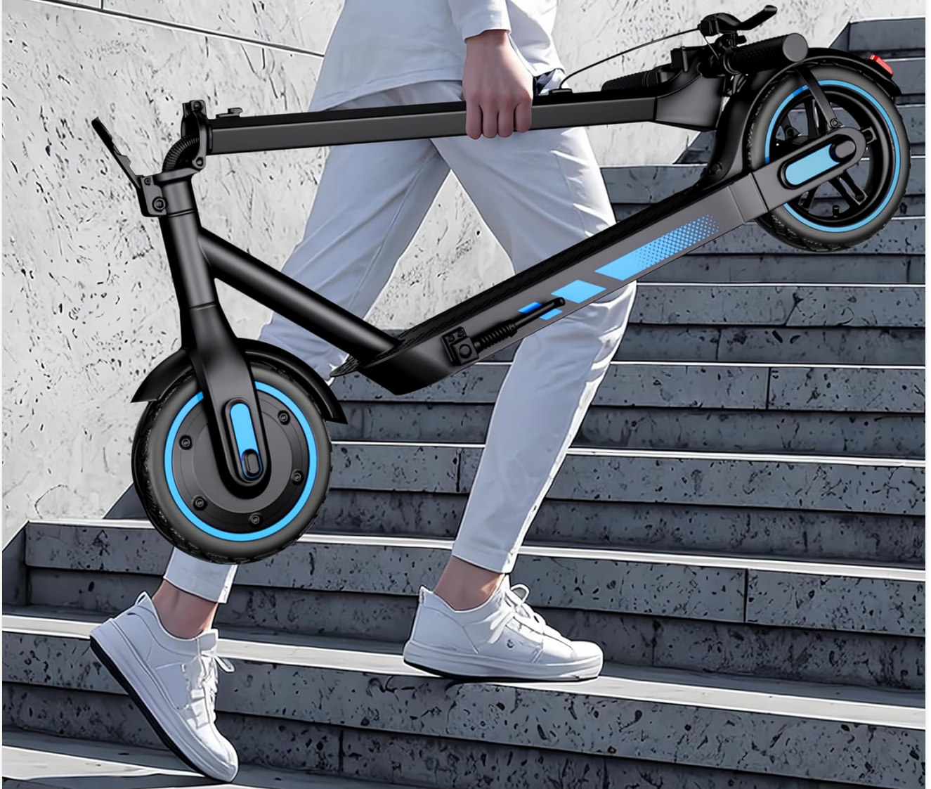
Image: The scooter's quick 3-second folding design for portability.