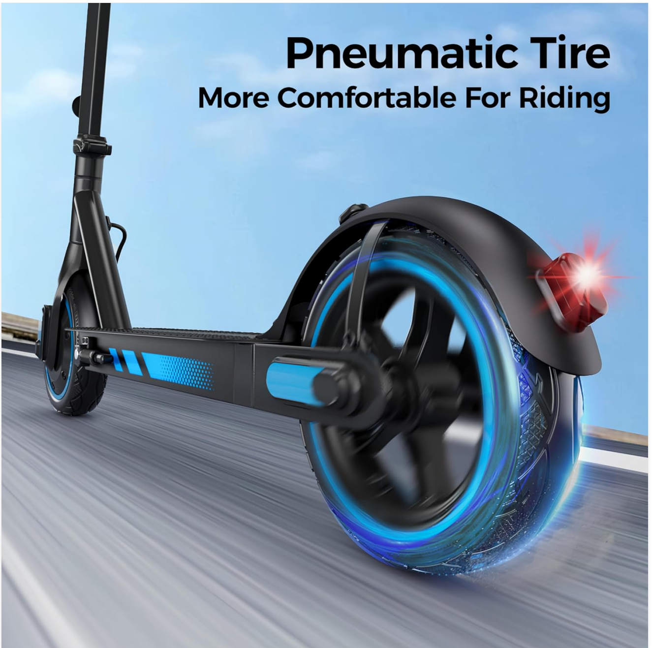
Image: Detail of the 10-inch pneumatic tire, designed for a comfortable ride.