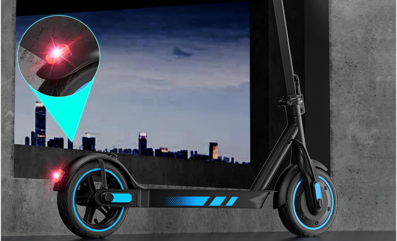
Image: Headlight and taillight for improved visibility during night rides.