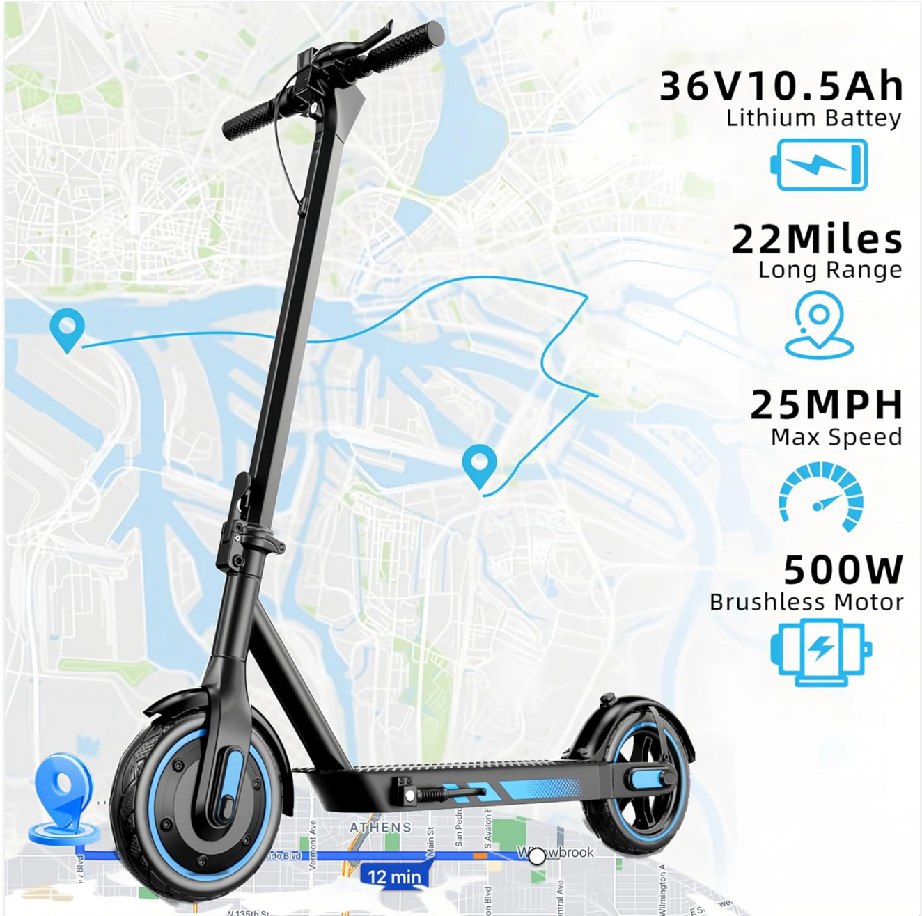
Image: EGGKING V10 Electric Scooter highlighting its 500W motor, 25 MPH top speed, and 22-mile range.