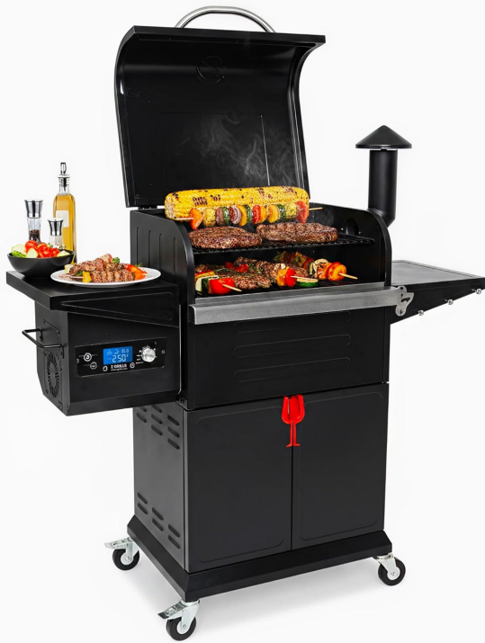
Front view of the Z GRILLS ZPG-600D2 Wood Pellet Grill and Smoker, showcasing its main body, hopper, control panel, and side shelf.