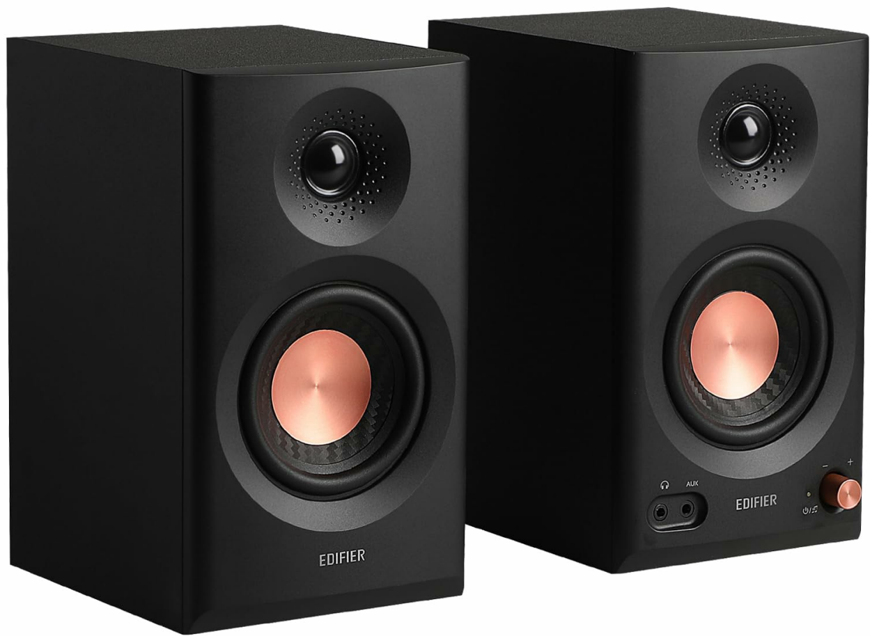
Figure 1: Front view of the Edifier MR3 Powered Studio Monitor Speakers.