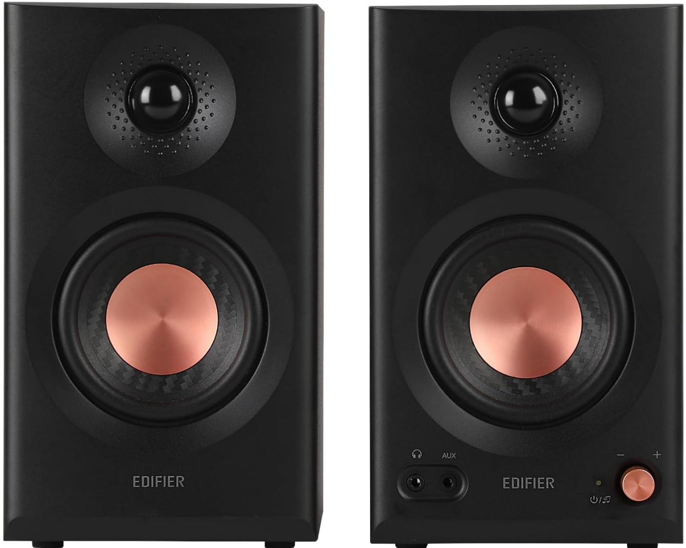
Figure 3: Front panel controls and inputs on the active speaker.