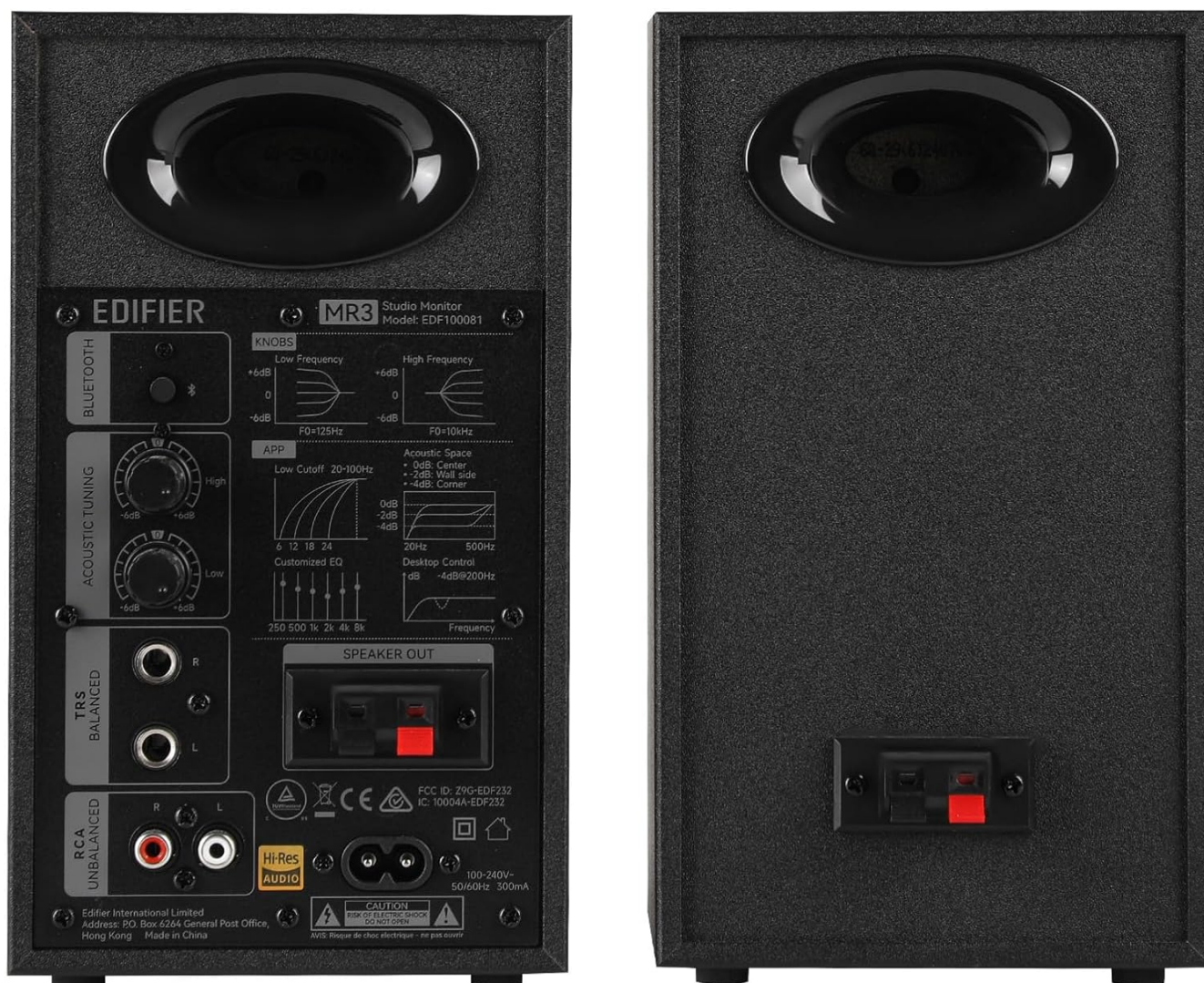
Figure 2: Rear panel of the active speaker with various input options.

For a visual guide on unboxing and initial setup, refer to the video below: