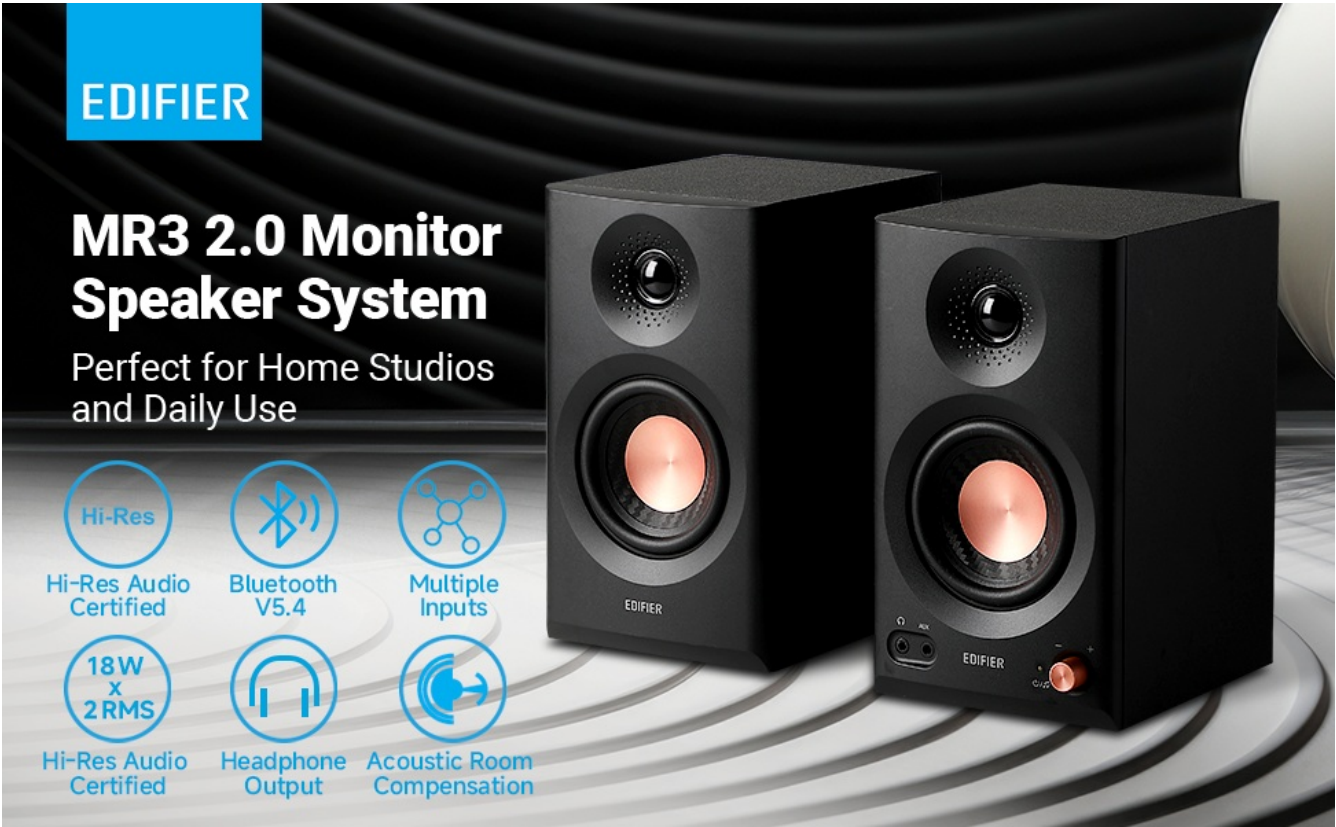
Figure 5: Key features of the Edifier MR3 Speaker System.

For a detailed look at the connectivity and features, watch the video below: