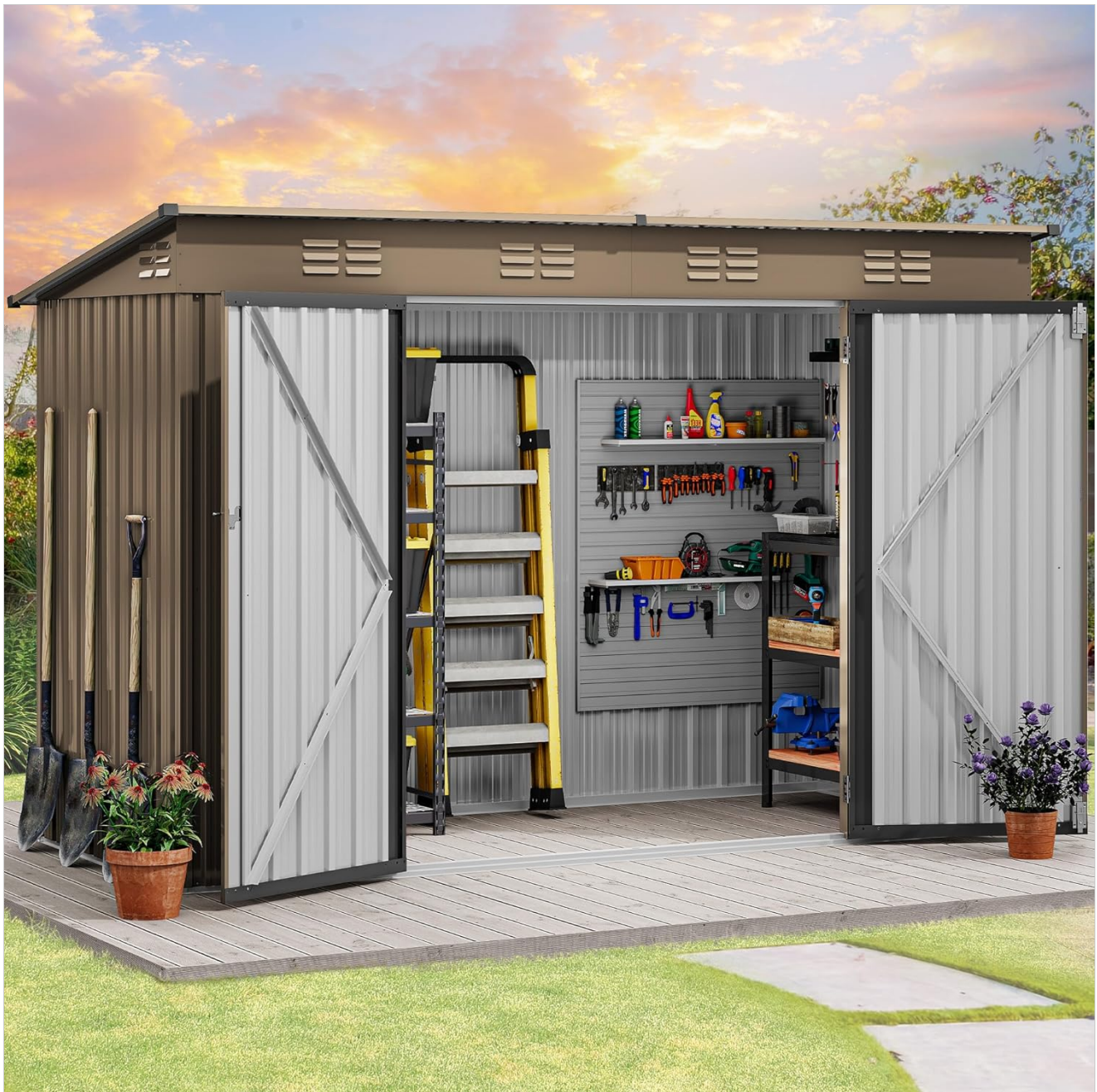
Image: The shed's double doors are shown wide open, providing a clear view of the spacious interior, ready for various storage needs.