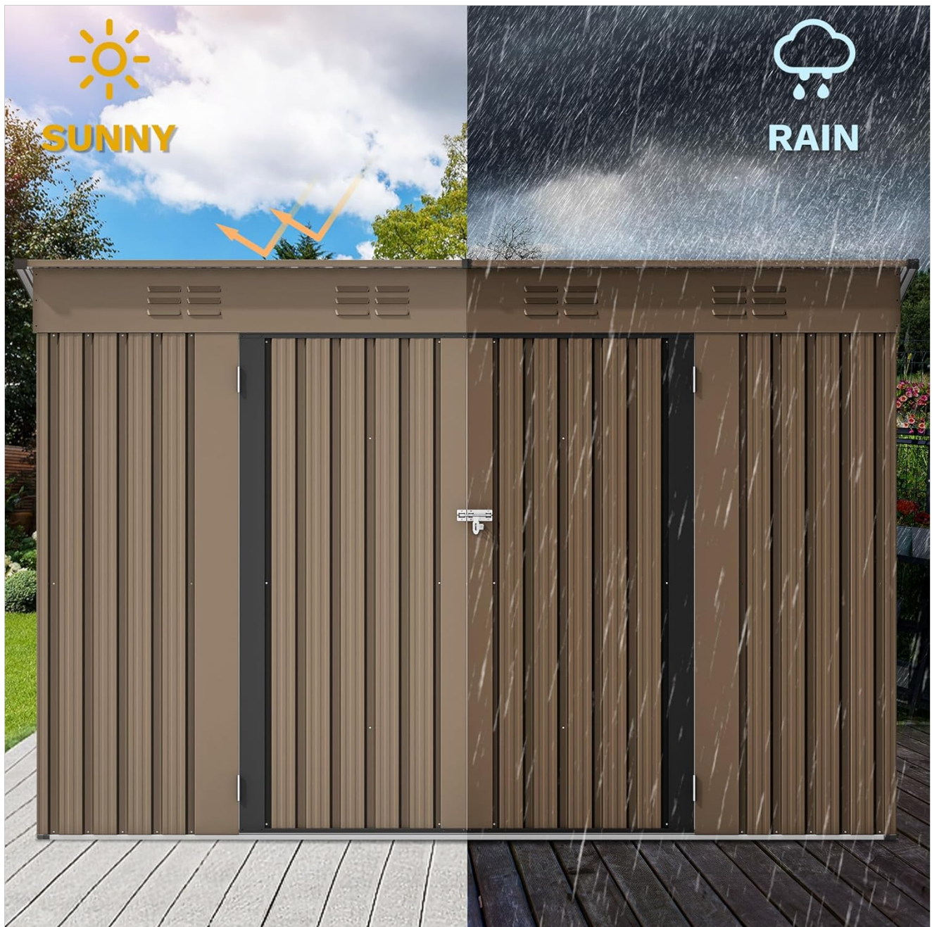
Image: The DWVO metal storage shed is shown in a backyard setting, highlighting its robust construction designed to withstand both sunny and rainy weather conditions.