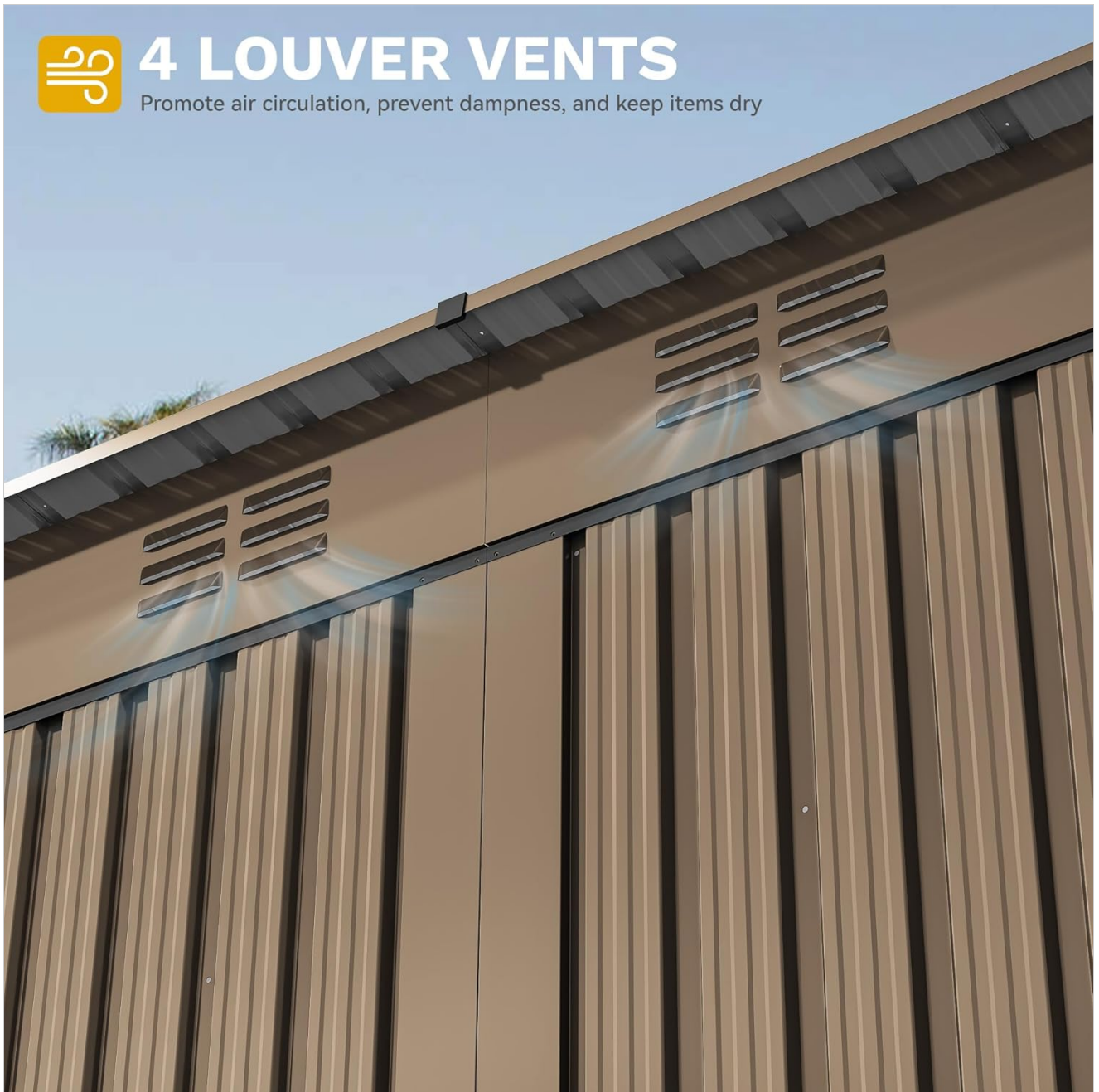
Image: A close-up of the shed's louver vents, illustrating their function in promoting air circulation to prevent dampness.

Promote air circulation, prevent dampness, and keep items dry