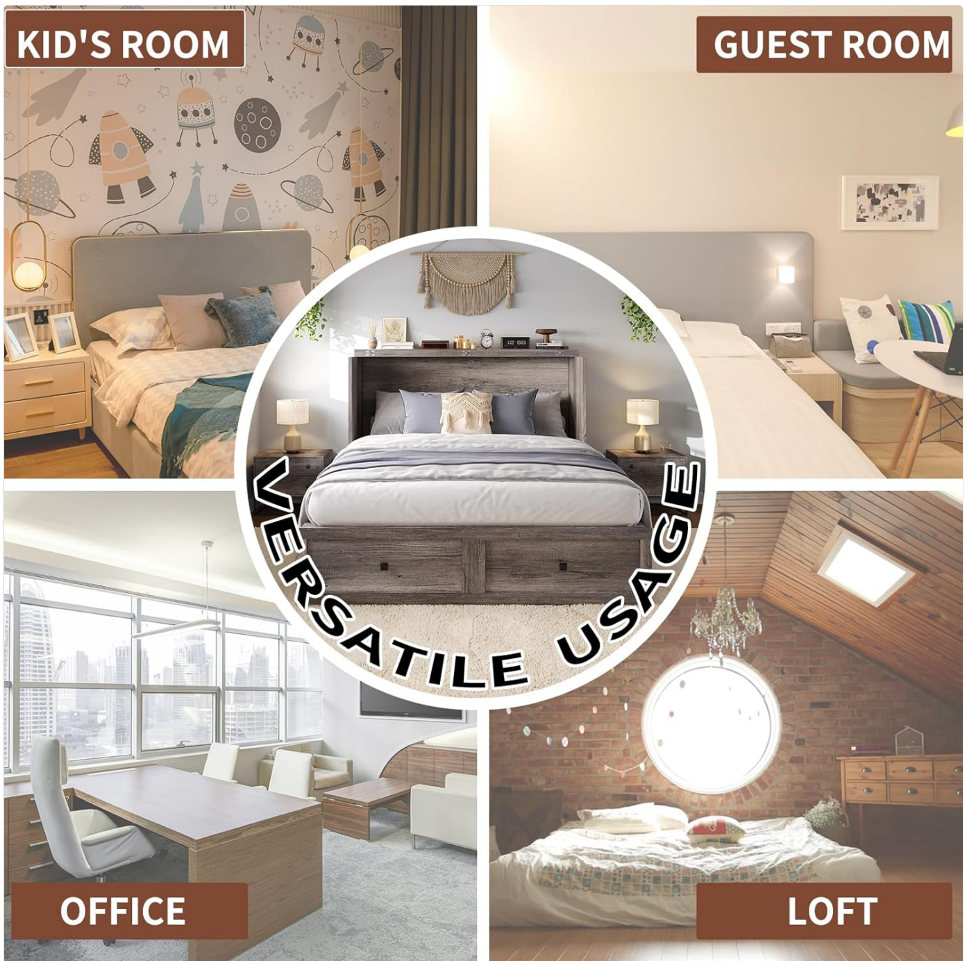
Image: A collage of images demonstrating the versatile usage of the Murphy Bed in various settings such as a kid's room, guest room, office, and loft.