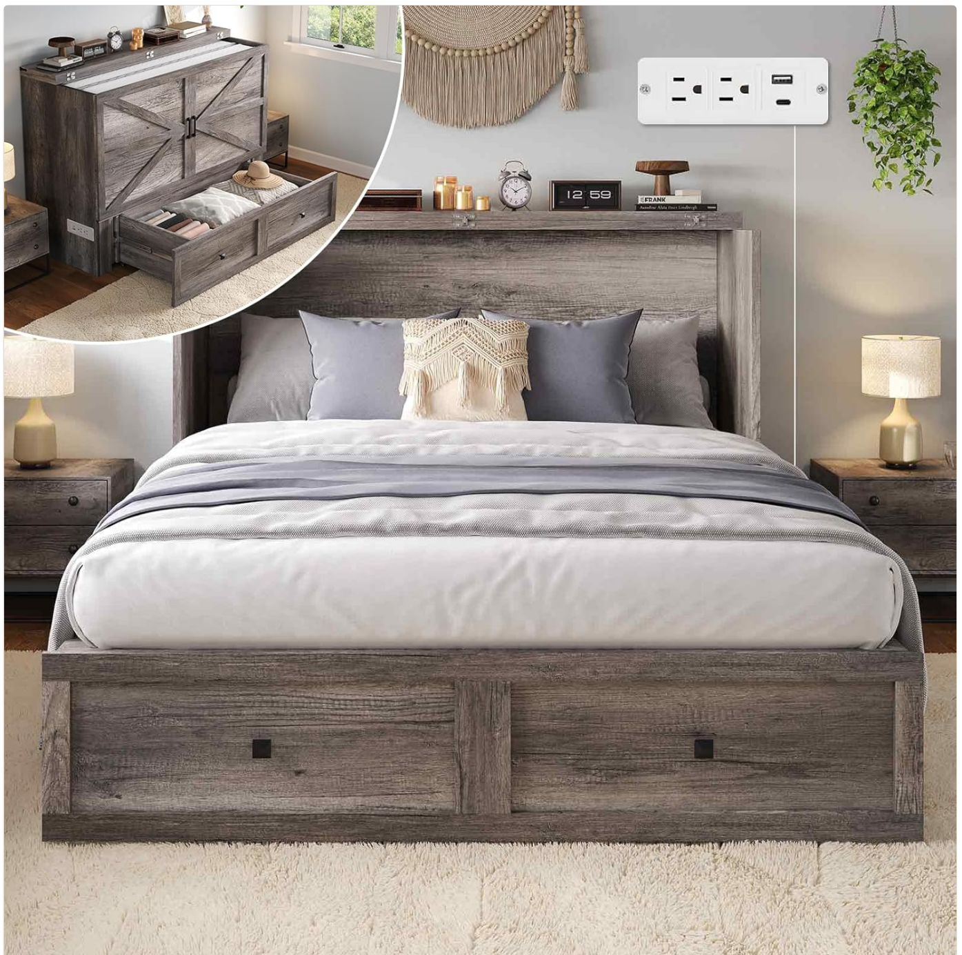
Image: The Murphy Bed Cabinet shown in both its compact cabinet form and fully extended bed form, highlighting its dual functionality.