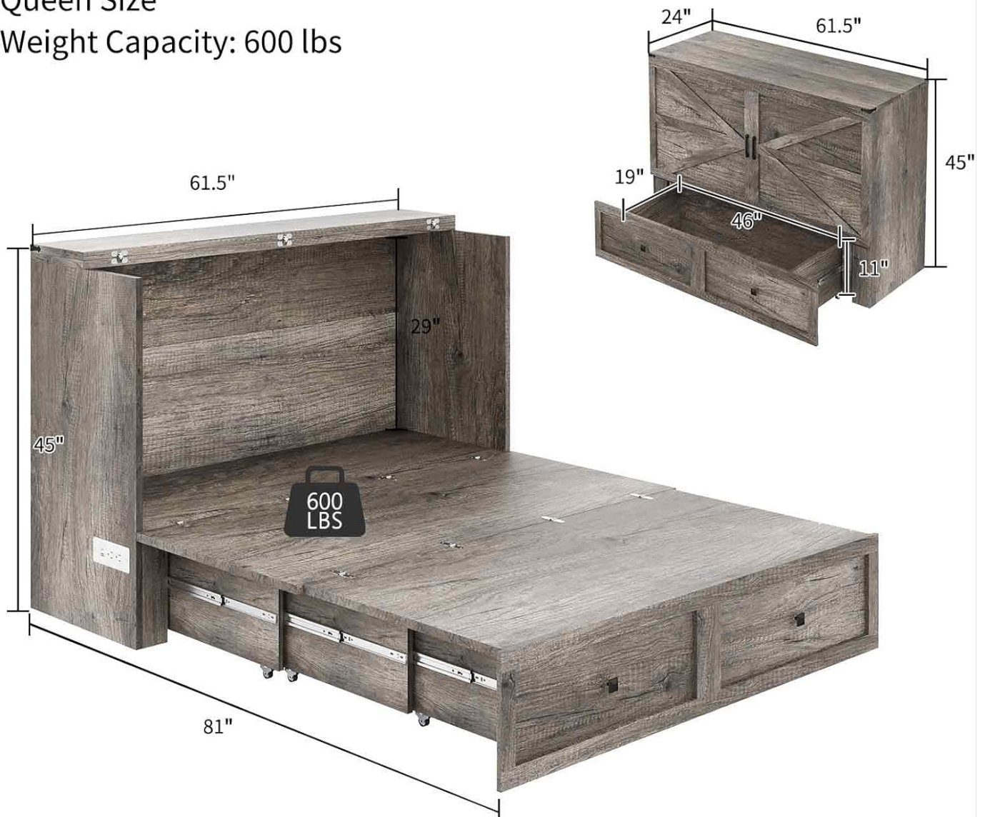
Image: A diagram illustrating the key dimensions of the Murphy Bed Cabinet in both its cabinet and extended bed configurations.