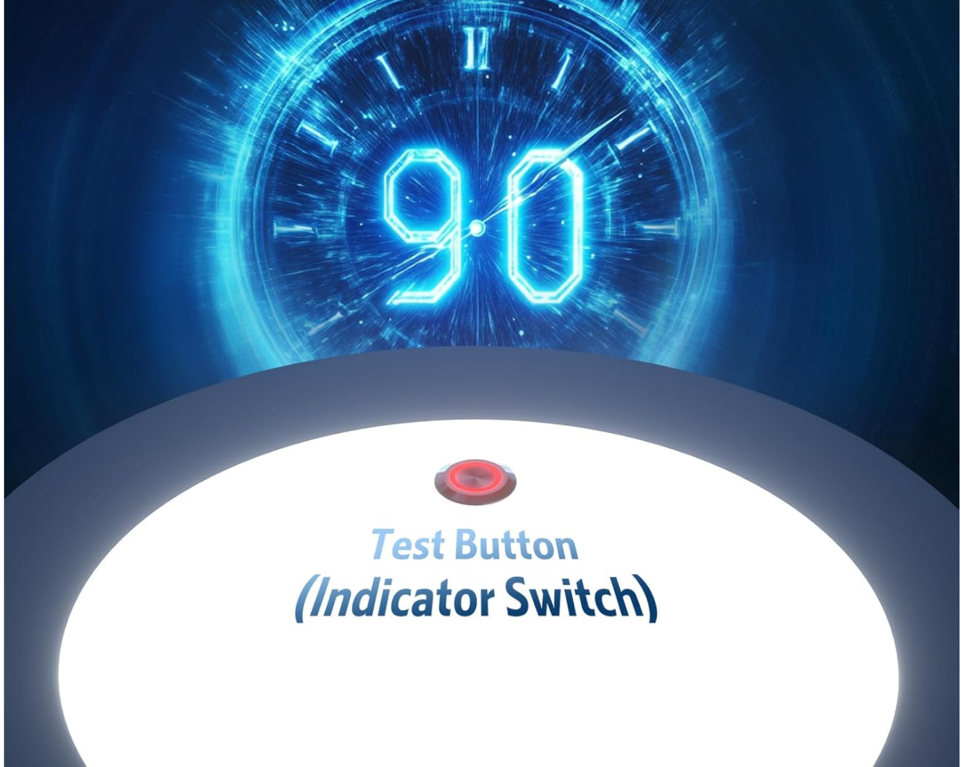
Image 1.1: Amico LED Emergency Recessed Light operating in both ordinary and emergency modes, illustrating its dual functionality.

Automatically enter battery-powered mode during outages