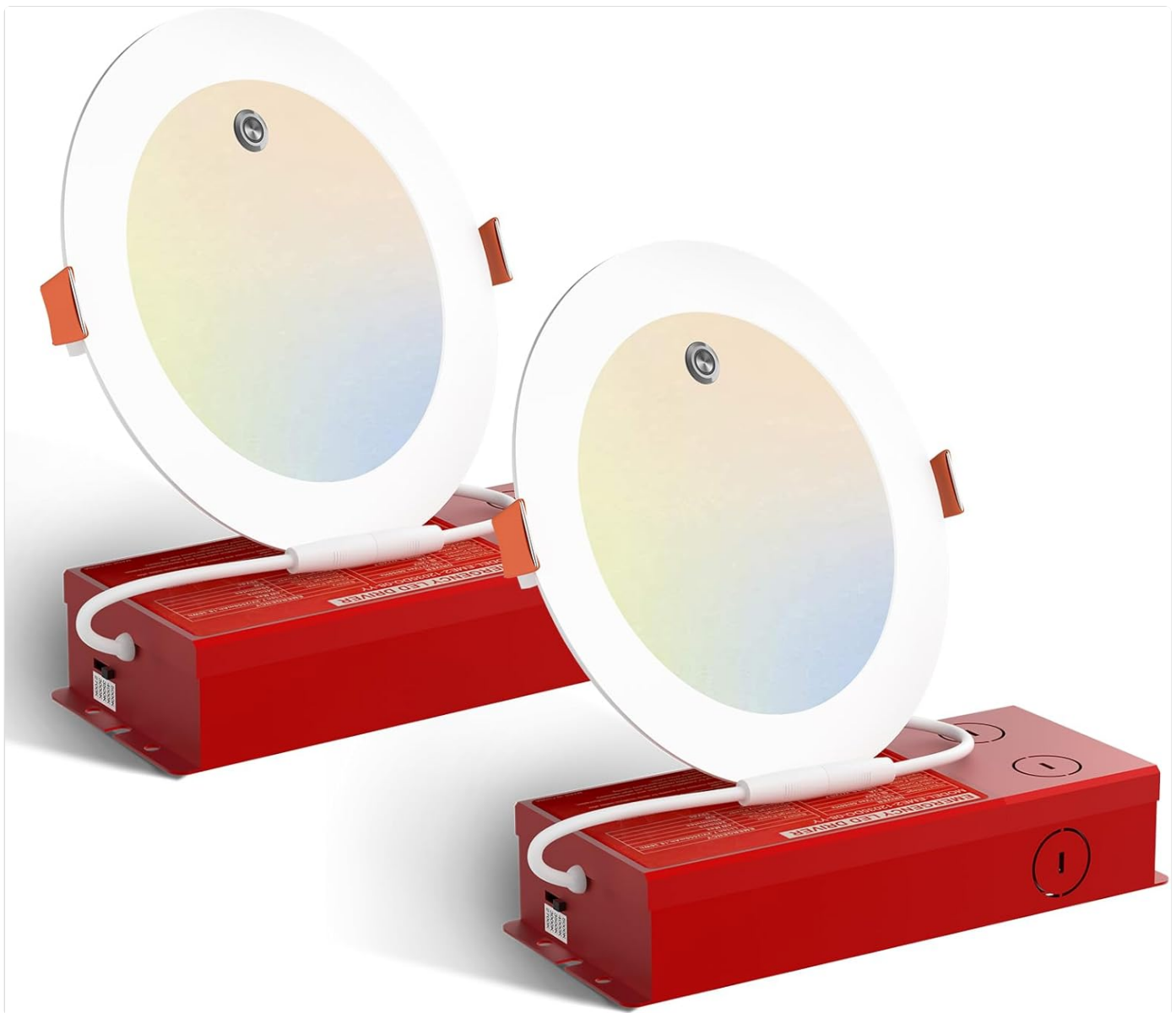
Image 7.1: The light features a test button for checking the 90-minute emergency lighting function.