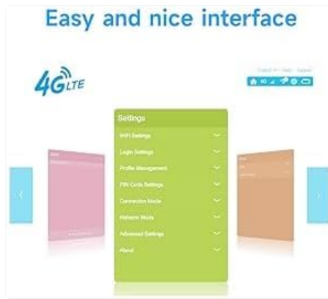
Image: Screenshot of the HOSAYA HU8's web interface, showing various settings options like WiFi Settings, Login Settings, Profile Management, and Connection Mode.