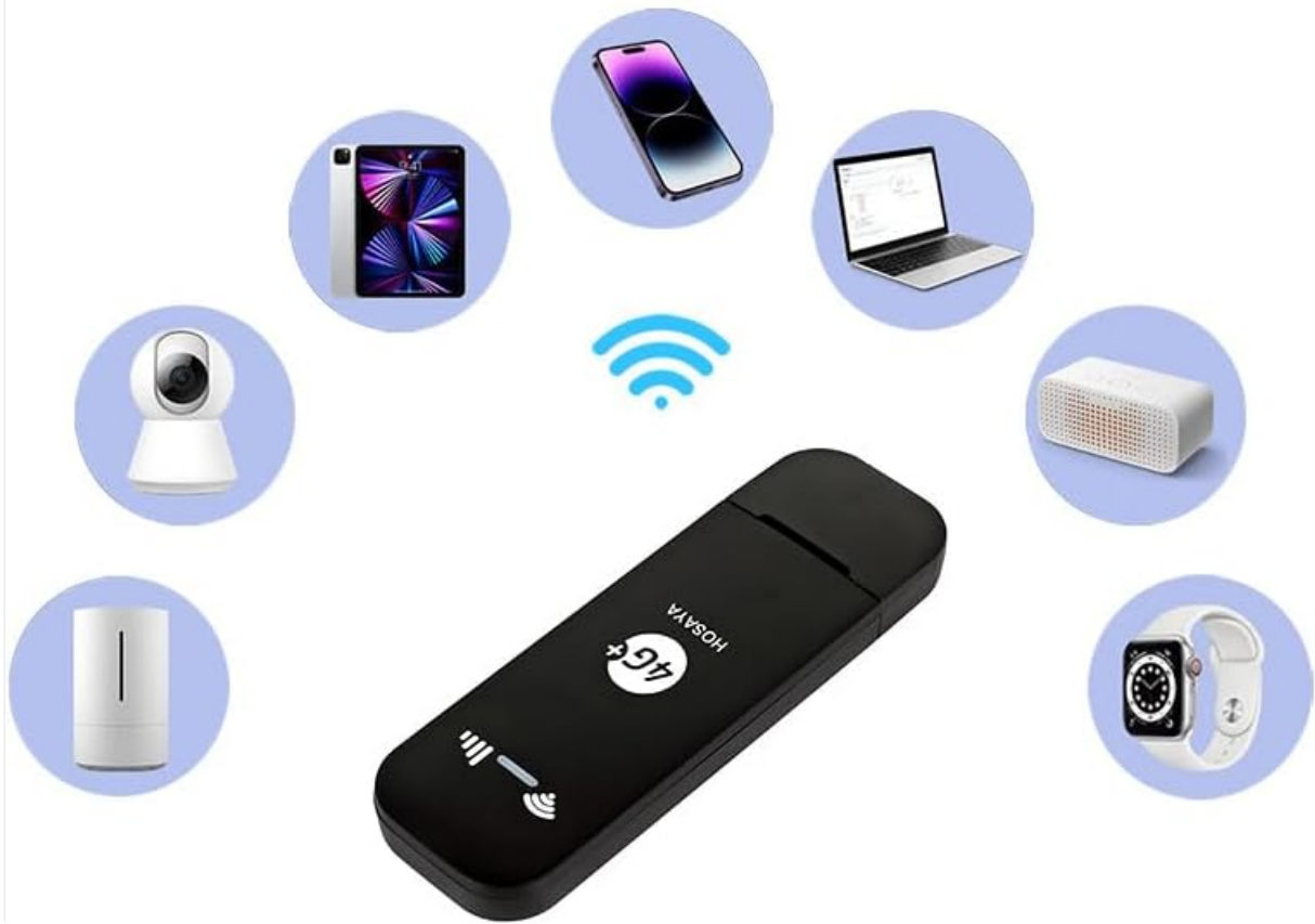
Image: Illustration showing the HOSAYA HU8 providing WiFi connectivity to multiple devices, including smartphones, tablets, laptops, and smart home devices.