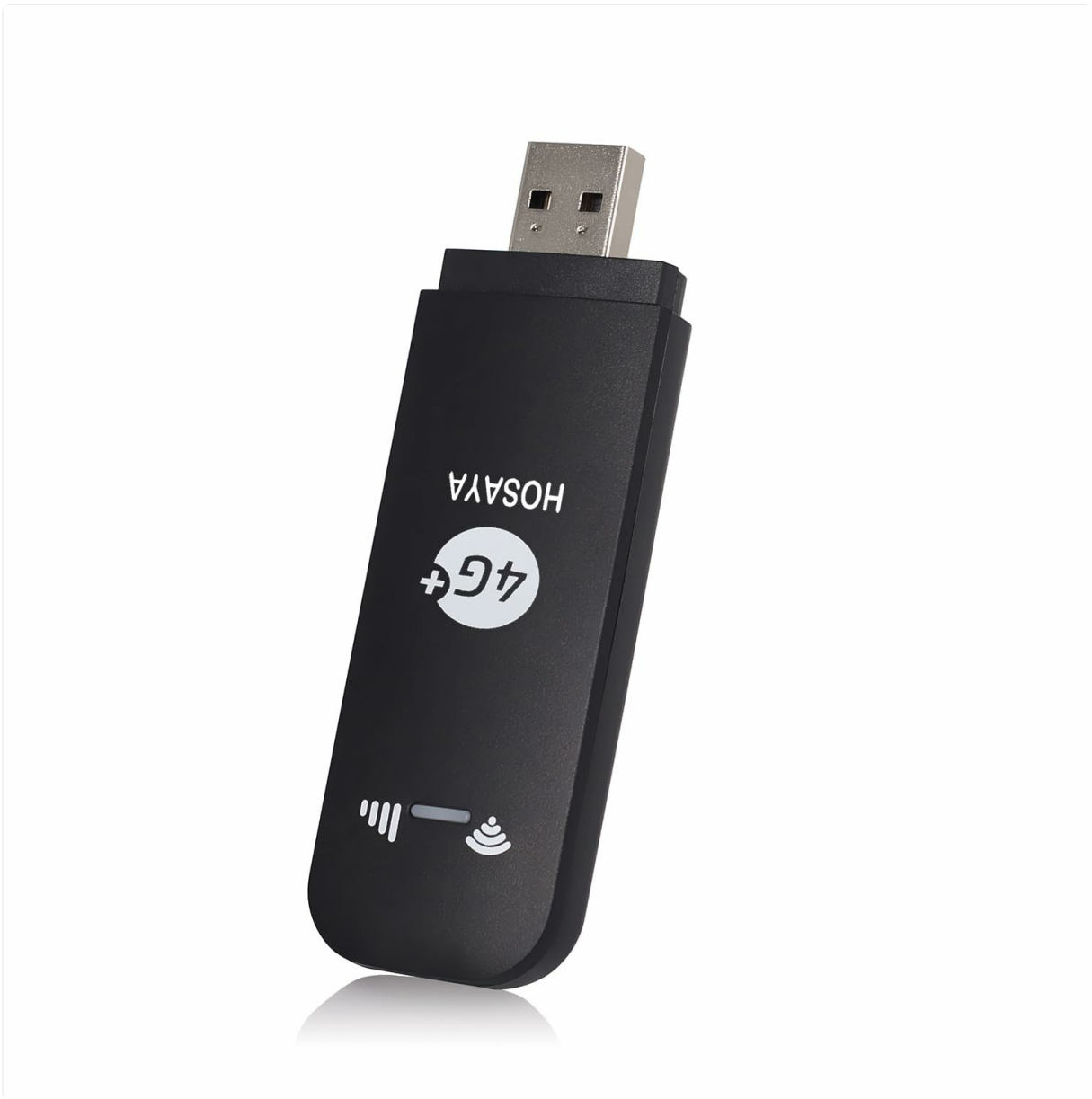
Image: The HOSAYA HU8 Portable 4G LTE WiFi Modem, a compact black dongle.