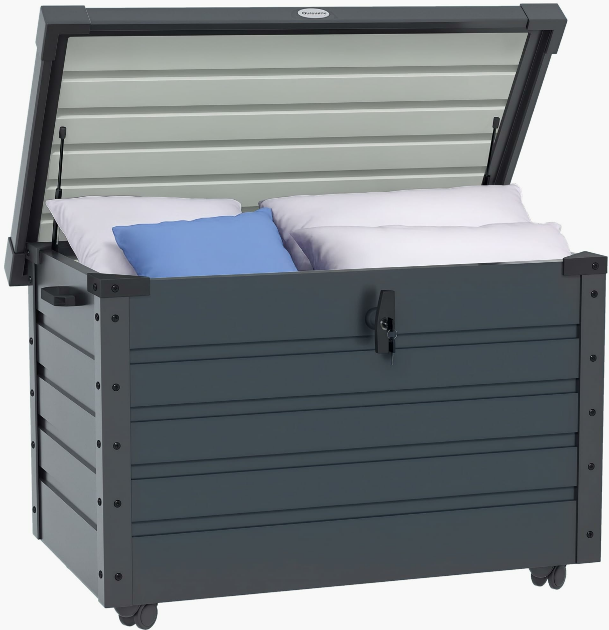
Image 1.1: The Outsunny 295L Garden Storage Box shown open, demonstrating its storage capacity for various outdoor items.