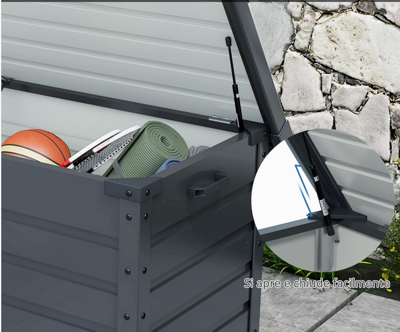
Image 4.2: The air pump assisted lid mechanism, designed for smooth and effortless opening and closing.