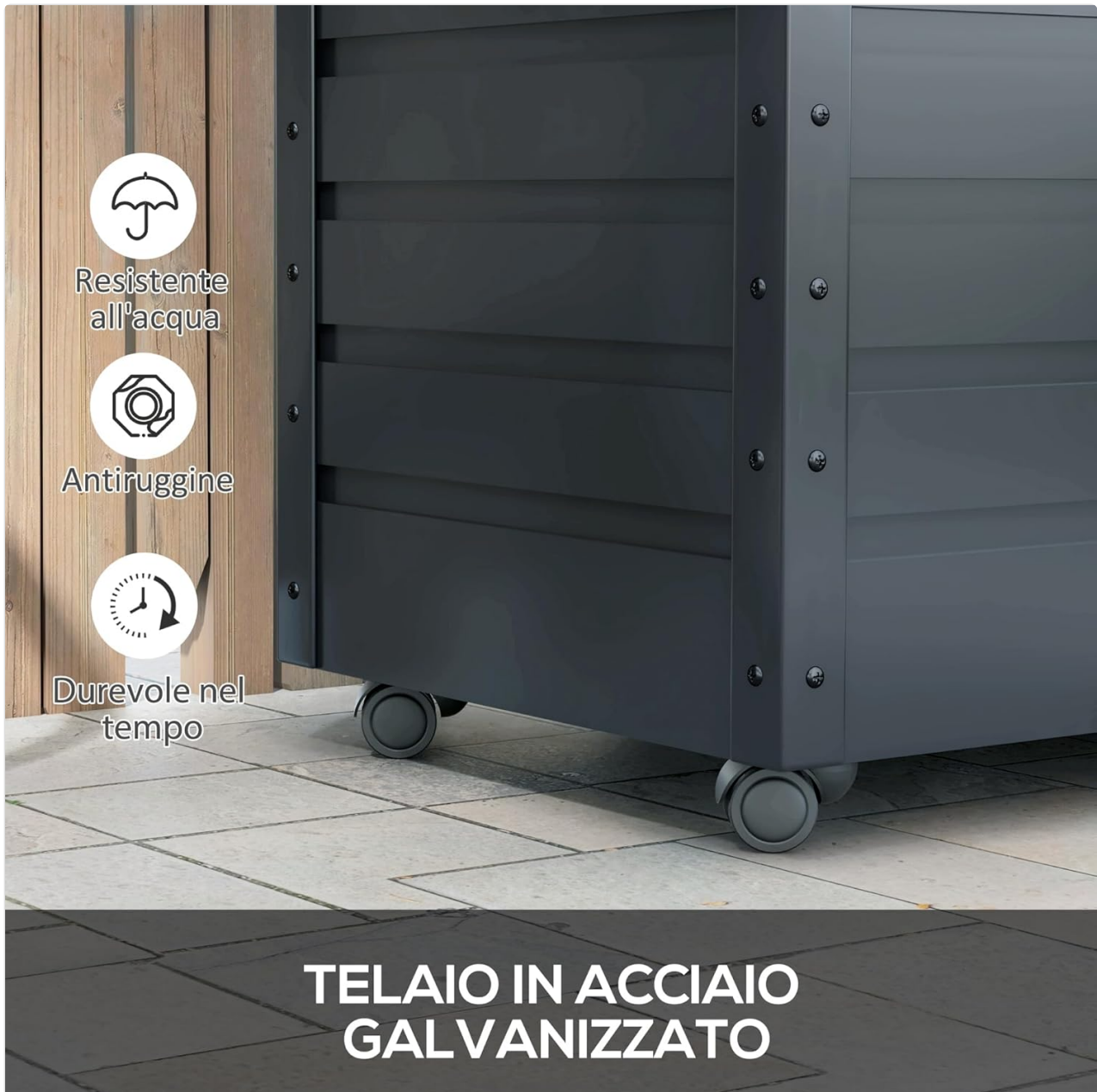
Image 6.1: The galvanized steel frame provides water resistance, rust protection, and long-term durability.