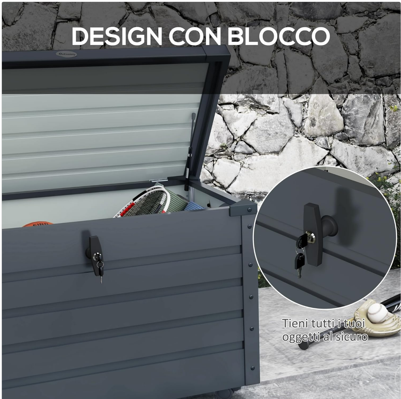
Image 5.1: The integrated lock and keys, providing security for stored items.

The storage box is equipped with a lockable lid. Insert the key into the lock and turn to secure your items. Always remove the key after locking.