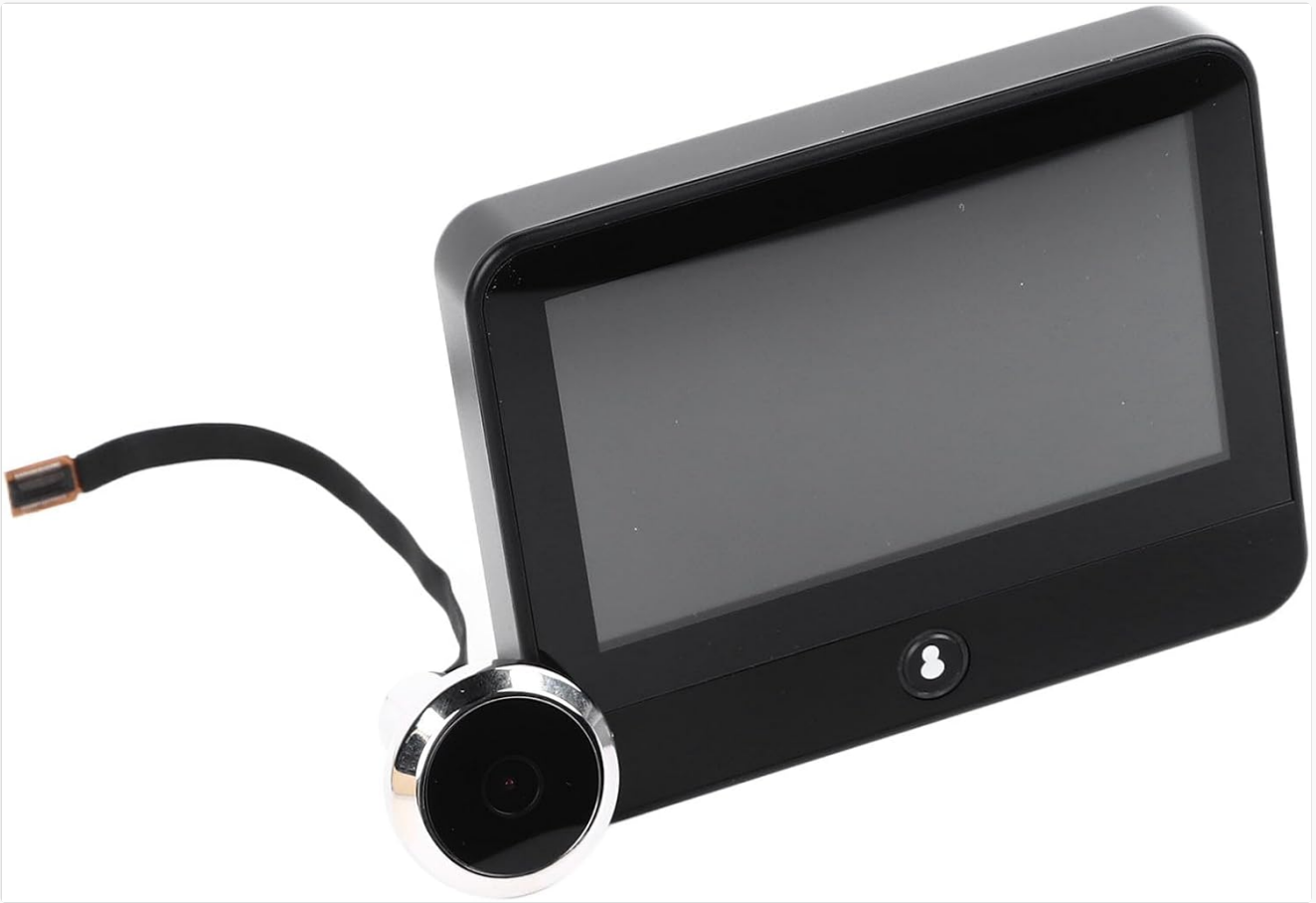
Figure 3.2: Side view of the indoor unit and outdoor camera, illustrating their connection.