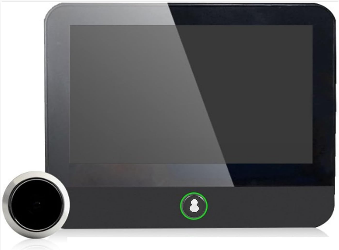
Figure 3.1: The main components of the XWXLIVJ Digital Door Viewer, showing the indoor display unit and the outdoor peephole

The XWXLIVJ Digital Door Viewer consists of two main parts: an outdoor peephole camera and an indoor display unit. The outdoor unit features a 1080P HD camera with a 120° wide-angle lens, motion detection, and a doorbell button. The indoor unit houses a high-definition LCD color screen for viewing, and controls for various functions.