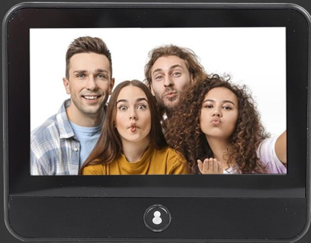
Figure 5.2: The wide-angle view allows you to see visitors clearly without opening the door.

Allows you to understand what's going on outside the door without opening the door