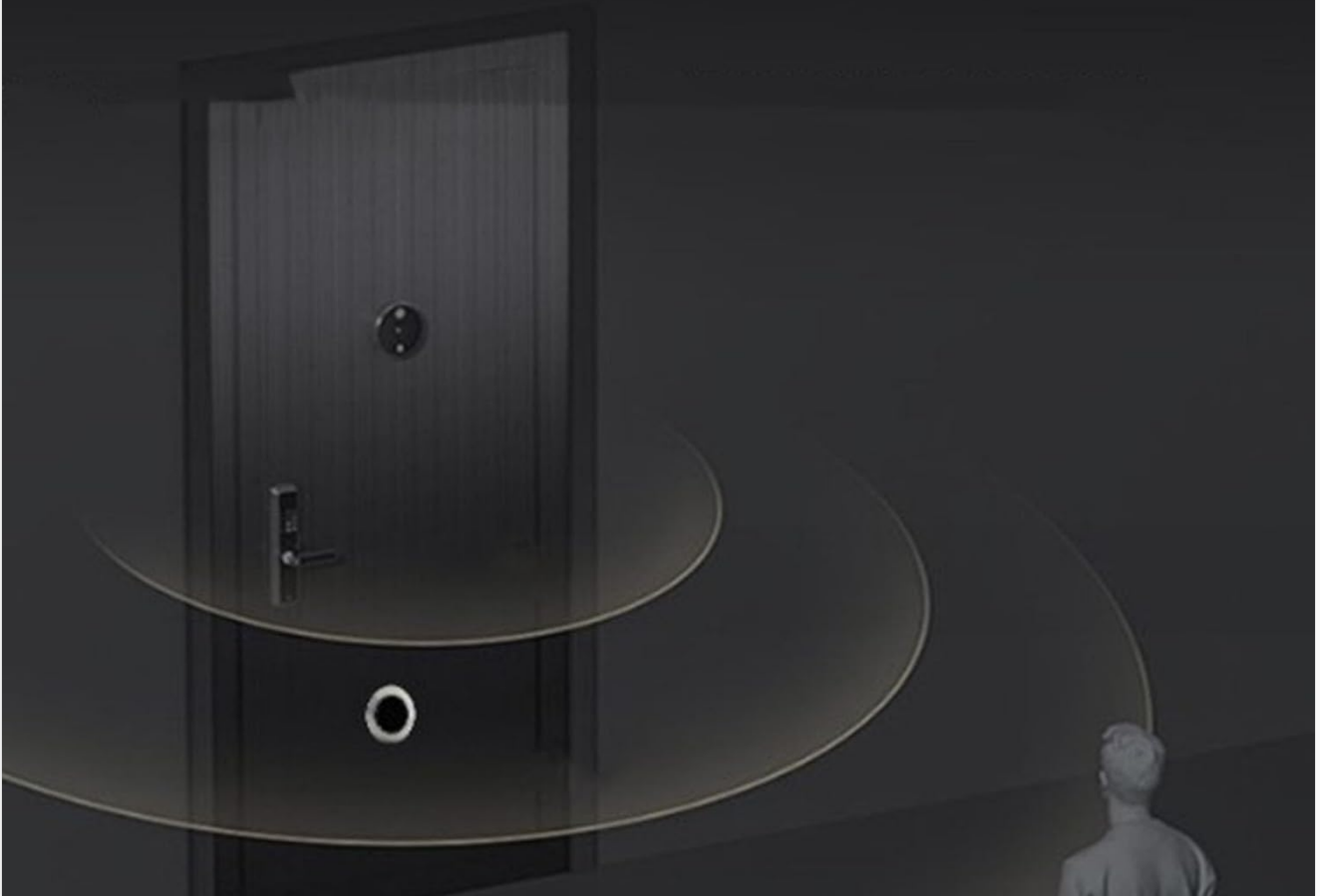
Figure 5.3: Motion detection provides alerts for activity at your door.

Your browser does not support the video tag.