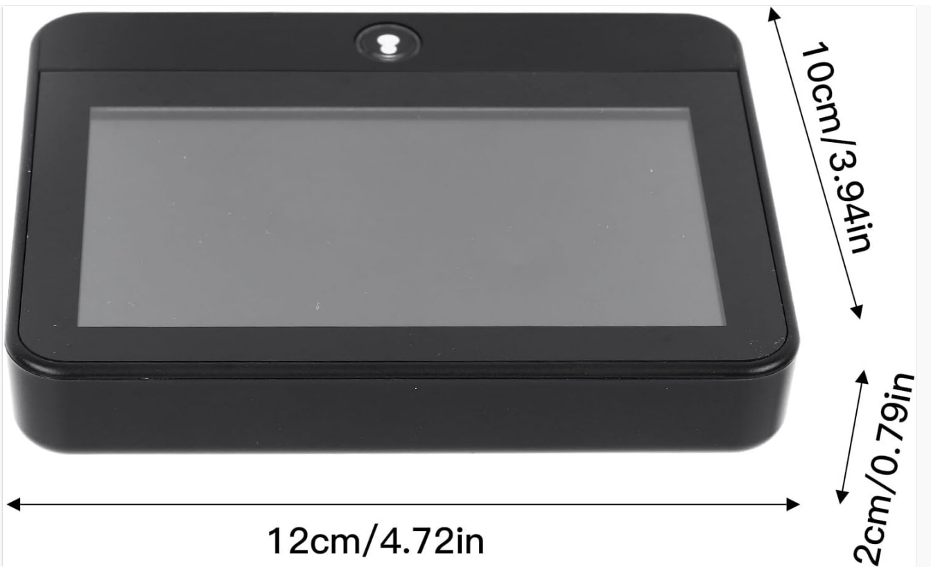
Figure 8.1: Detailed dimensions of the indoor display unit.