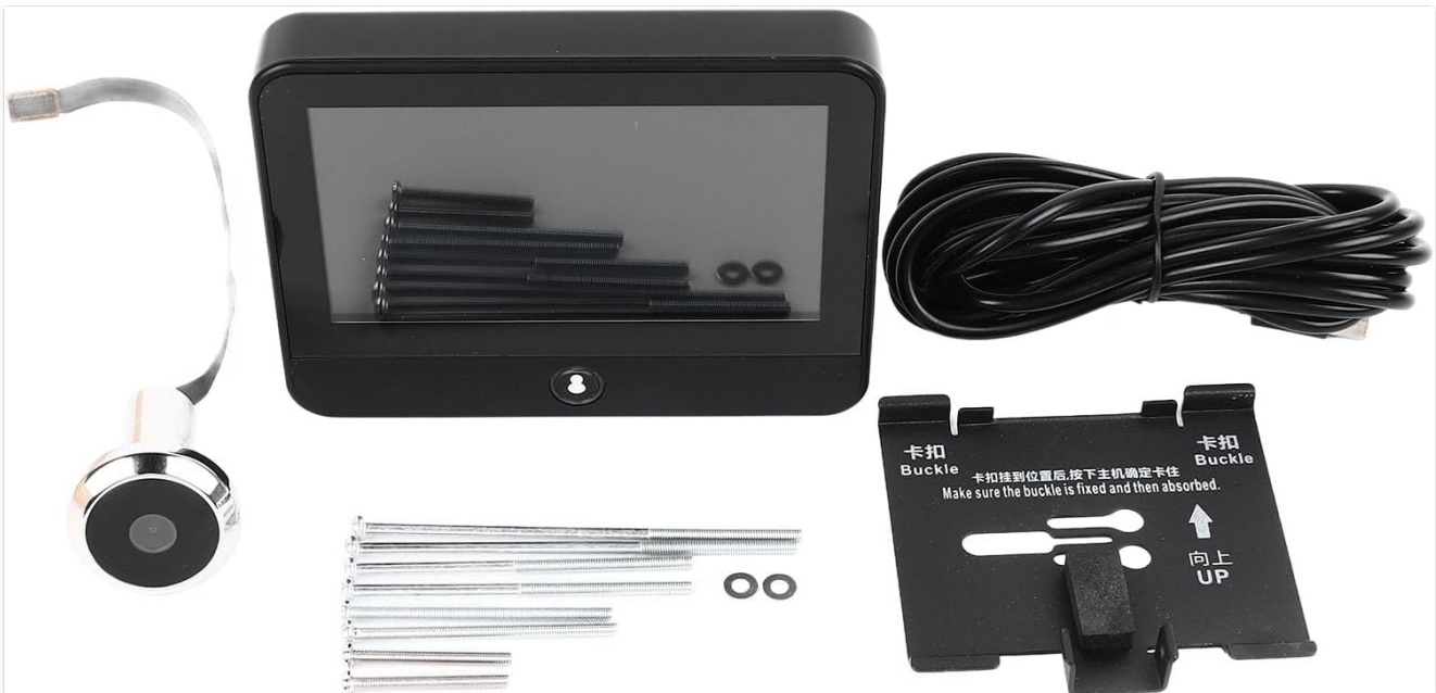
Figure 2.1: Complete package contents of the XWXLIVJ Digital Door Viewer, showing the indoor display, outdoor camera, USB charging cable, mounting plate, and various screws.