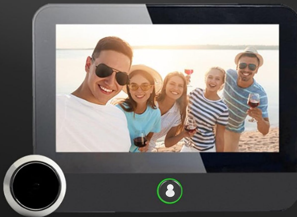
Figure 5.1: High-definition monitoring of your doorstep.

Provide a clear video screen, allowing you to monitor the situation at your door anytime, anywhere