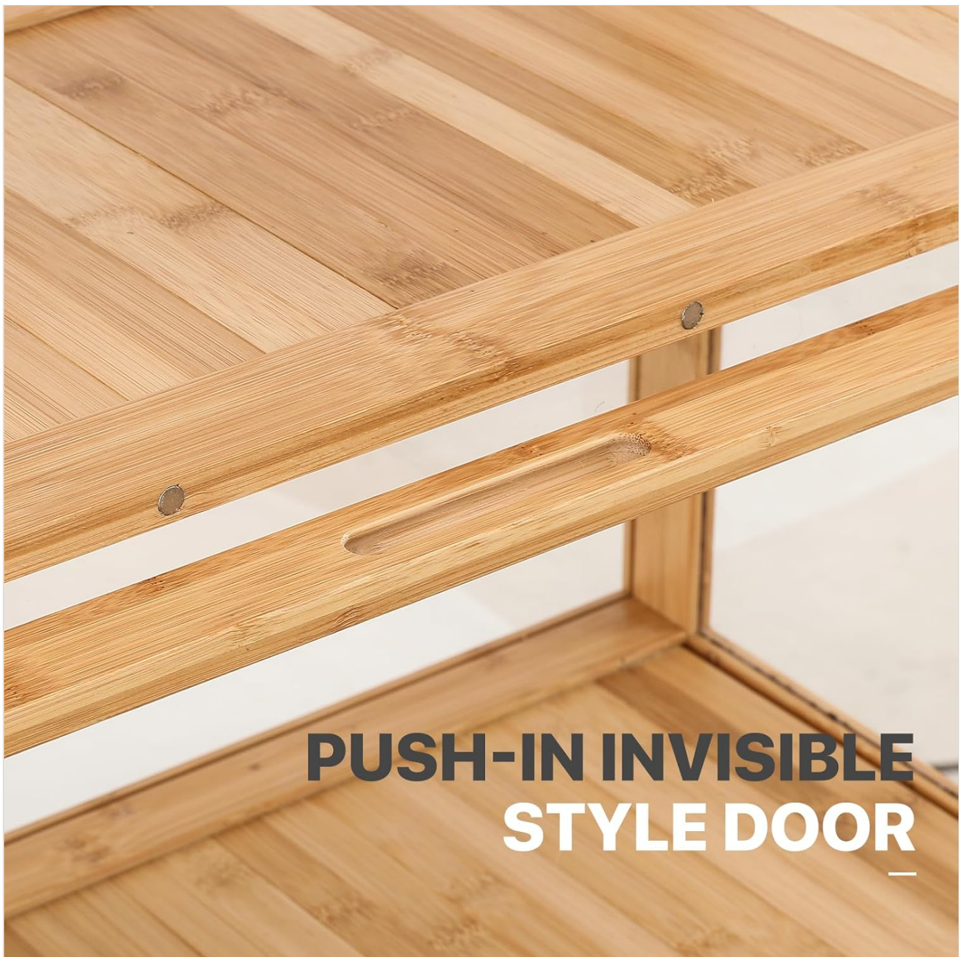
Image Description: A detailed shot highlighting the push-in invisible style door handle of the MoNiBloom display cabinet. This design ensures a sleek appearance while providing a functional way to open the doors.