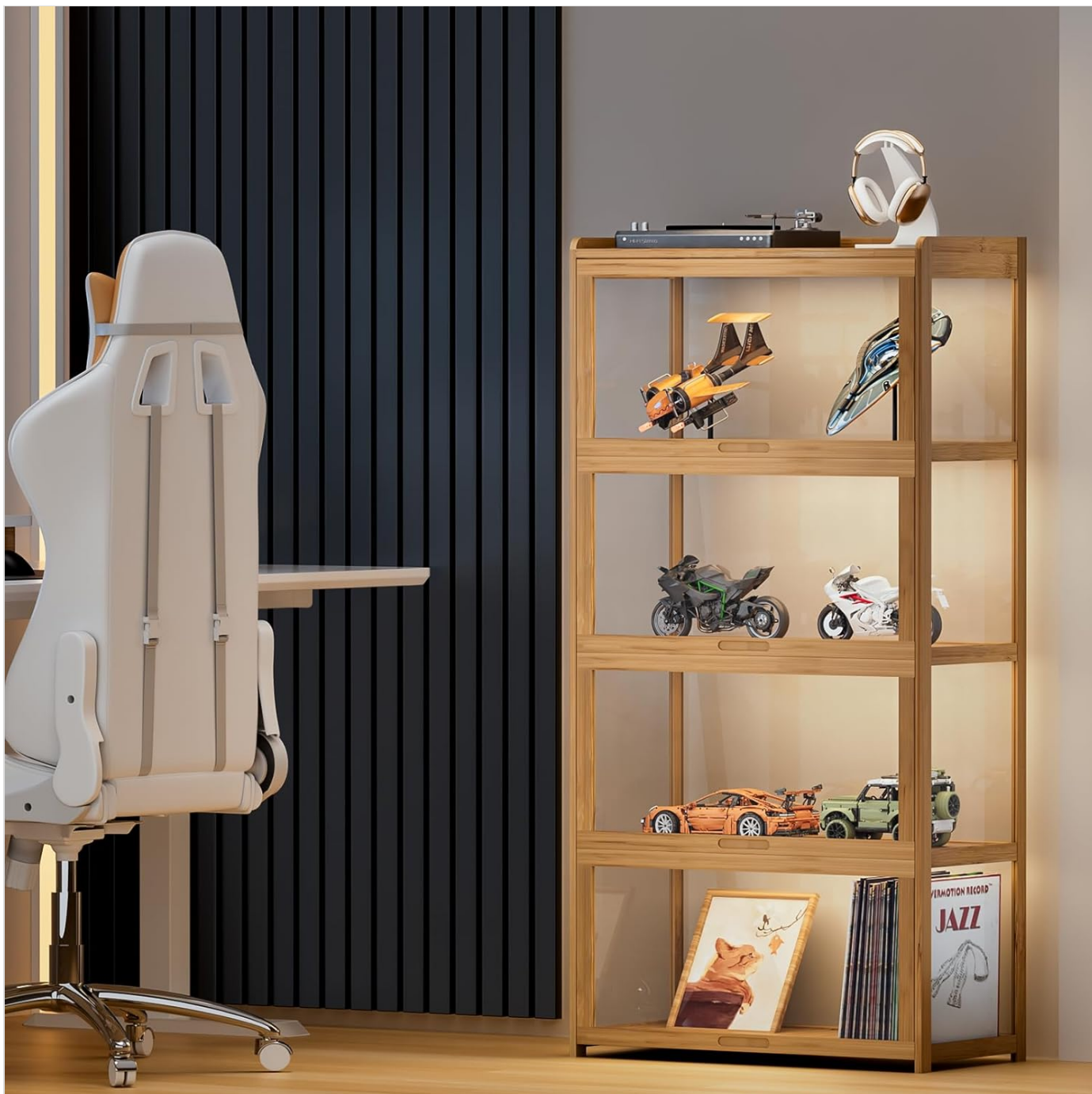
Image Description: The MoNiBloom 55" Curio Display Cabinet, showcasing its natural bamboo frame and transparent acrylic doors, filled with various display items in a modern living room setting.