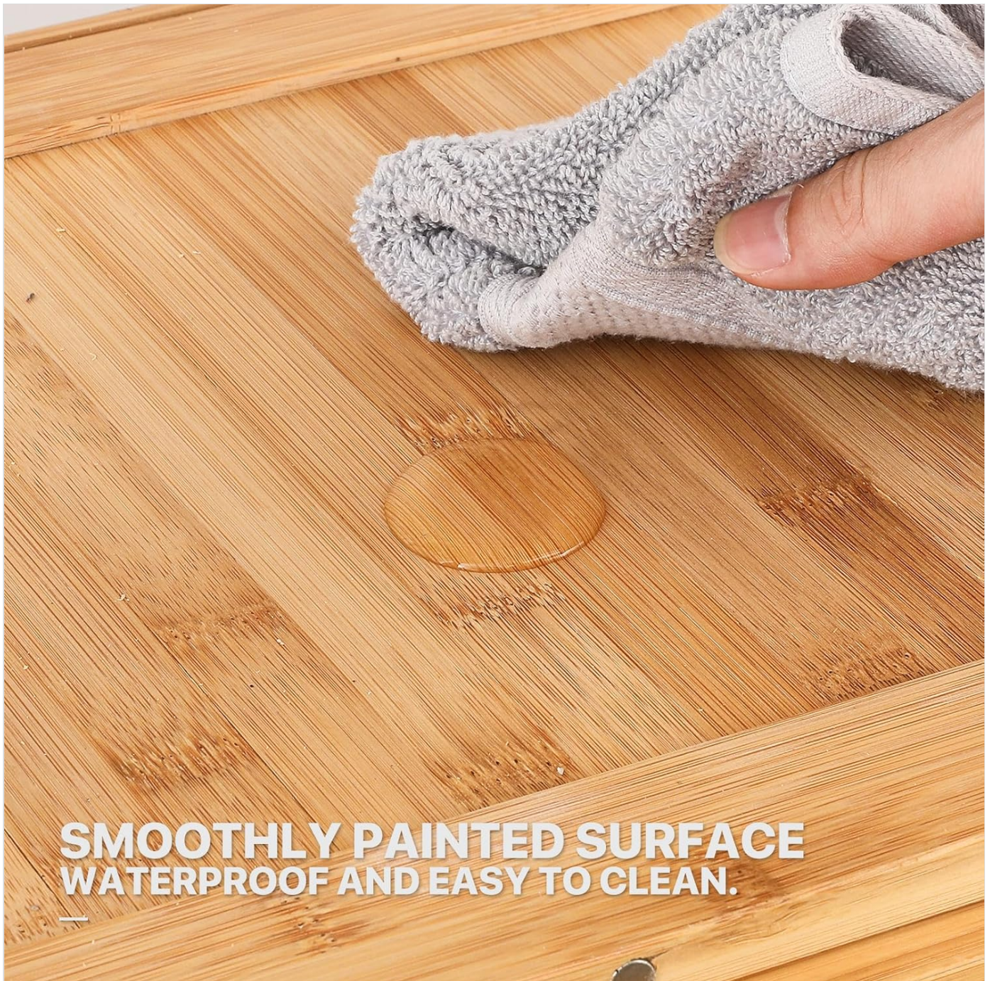
Image Description: A close-up image demonstrating the smoothly painted and waterproof surface of the MoNiBloom display cabinet. A water droplet is visible on the bamboo, highlighting its easy-to-clean property.