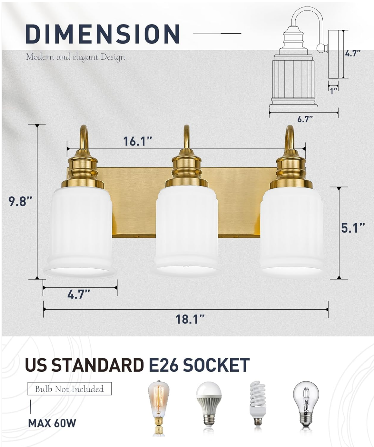
Figure 2: Product Dimensions