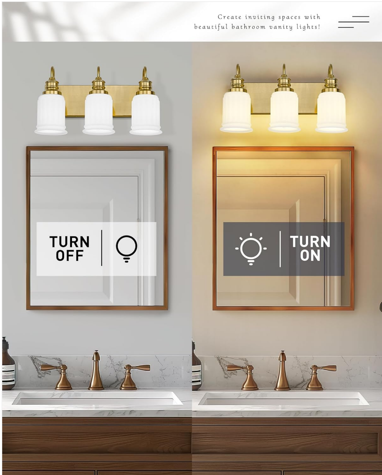
Figure 4: Light Fixture On/Off Demonstration

Once installed, operate the light fixture using your standard wall switch. The fixture is compatible with E26 base bulbs, allowing you to choose the desired light temperature and brightness for your space.