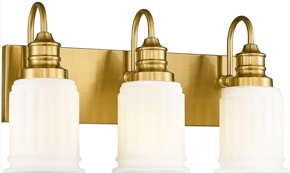
Figure 1: HWH Modern 3-Light Bathroom Vanity Light Fixture

Thank you for choosing the HWH Modern 3-Light Bathroom Vanity Light Fixture. This manual provides essential information for the safe installation, operation, and maintenance of your new lighting fixture. Please read these instructions thoroughly before beginning installation and retain them for future reference.