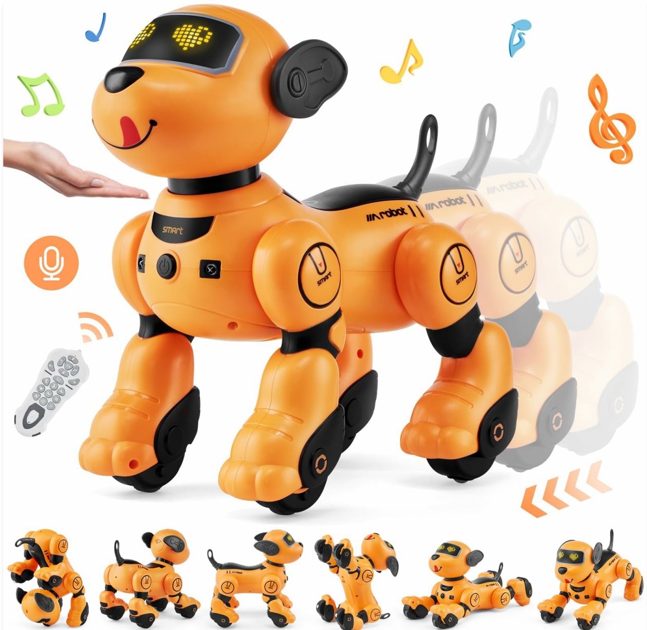
Image: The robot dog in follow mode, tracking the remote control's signal.