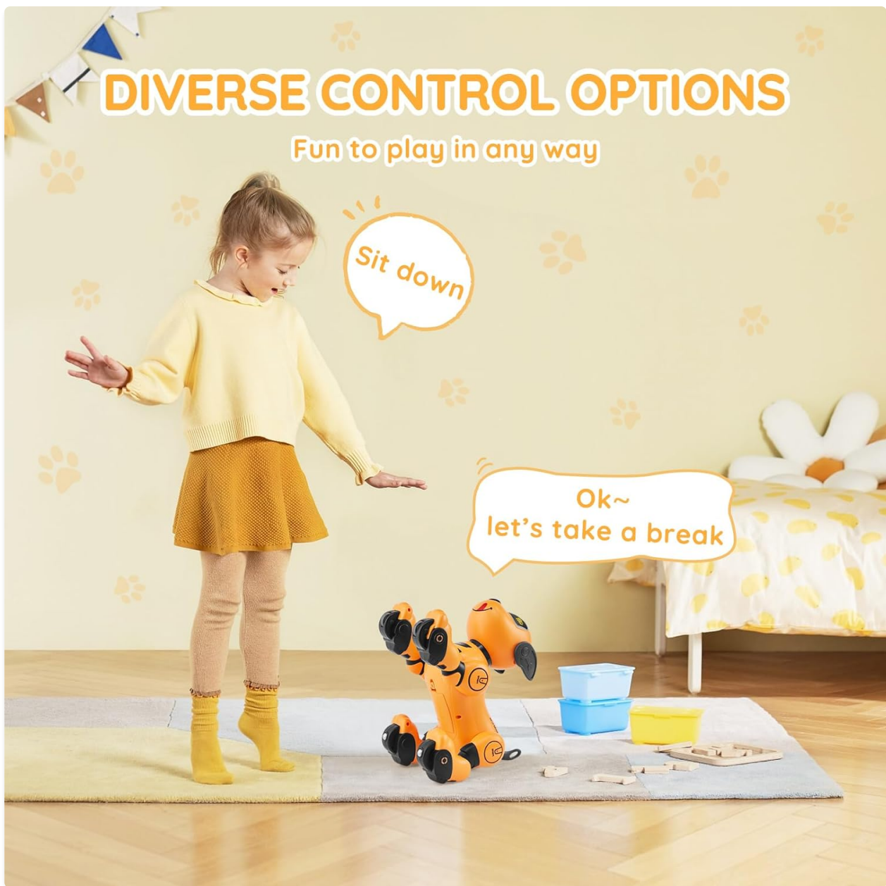
Image: The robot dog responding to voice commands, demonstrating smart control options.