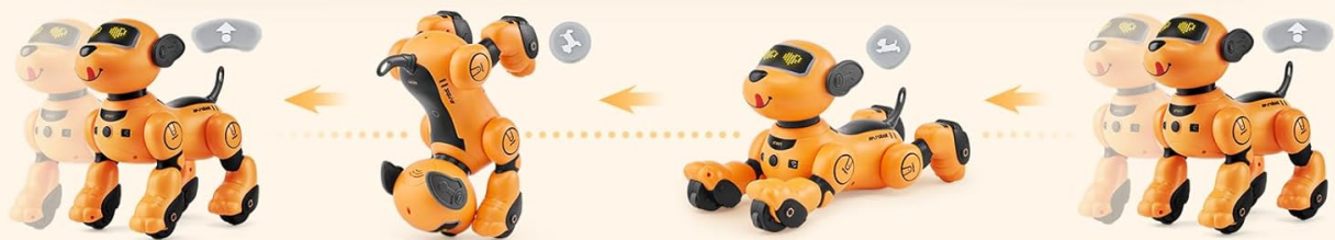
Image: Demonstrating the programmable mode using the remote control.