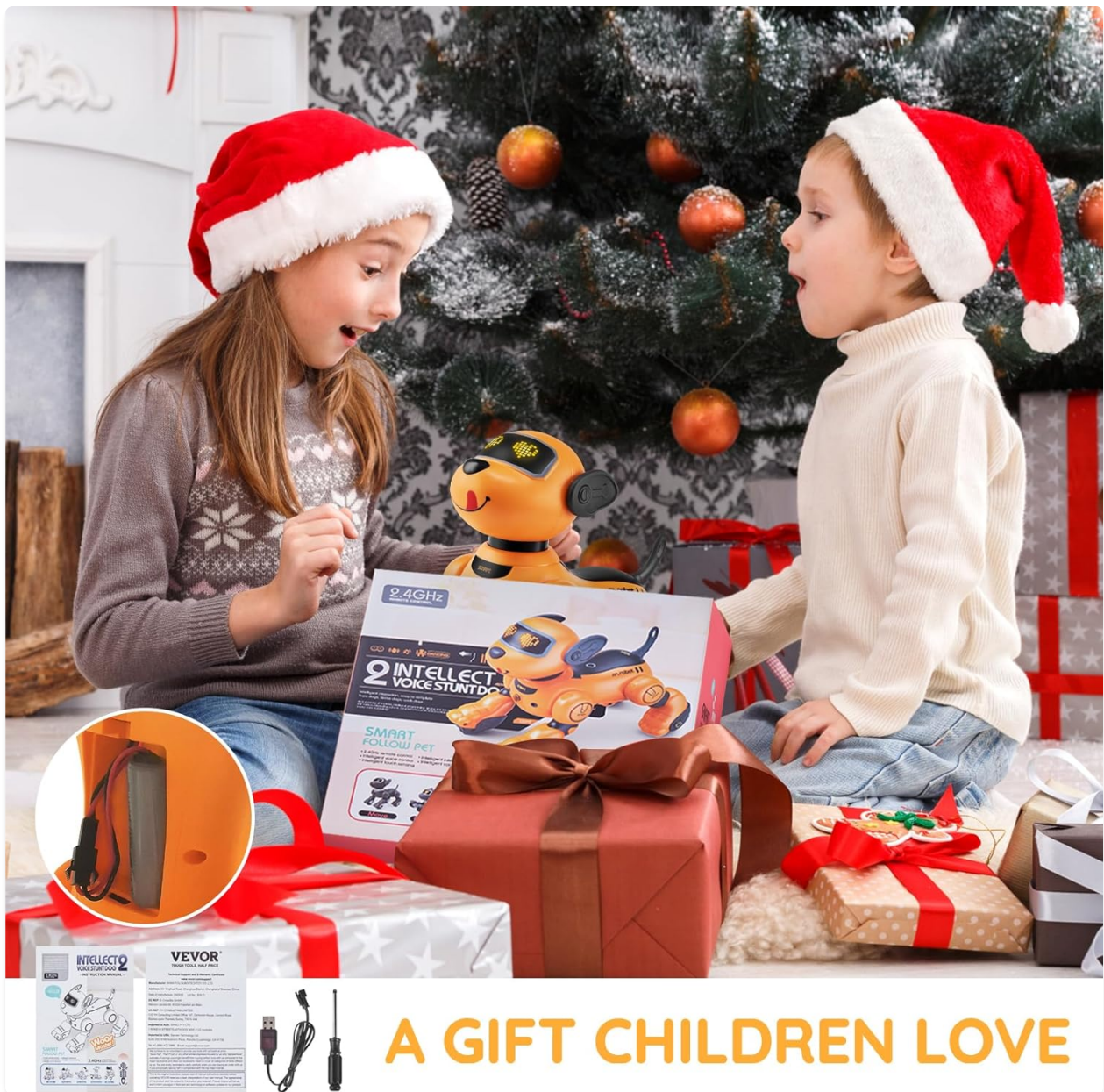
Image: The VEVOR Robot Dog Toy box contents, showing the robot dog, remote control, charging cable, battery, screwdriver, and user manual.