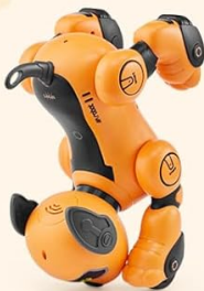
Stand on Head