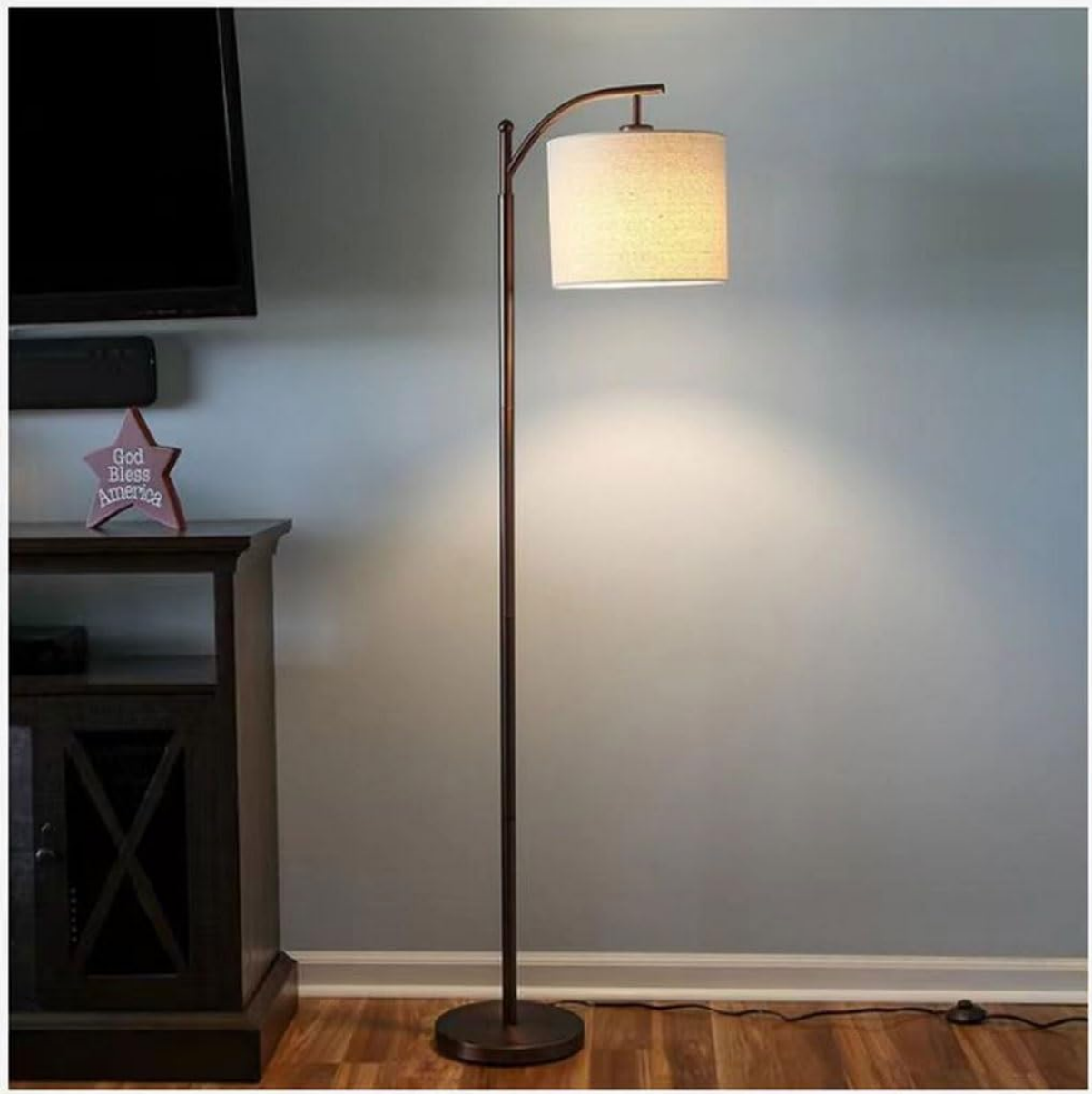
The floor lamp positioned in a living room, demonstrating typical placement.