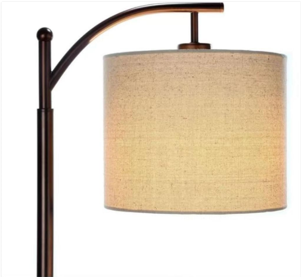
A detailed view of the beige fabric lampshade, which diffuses light for a soft glow.