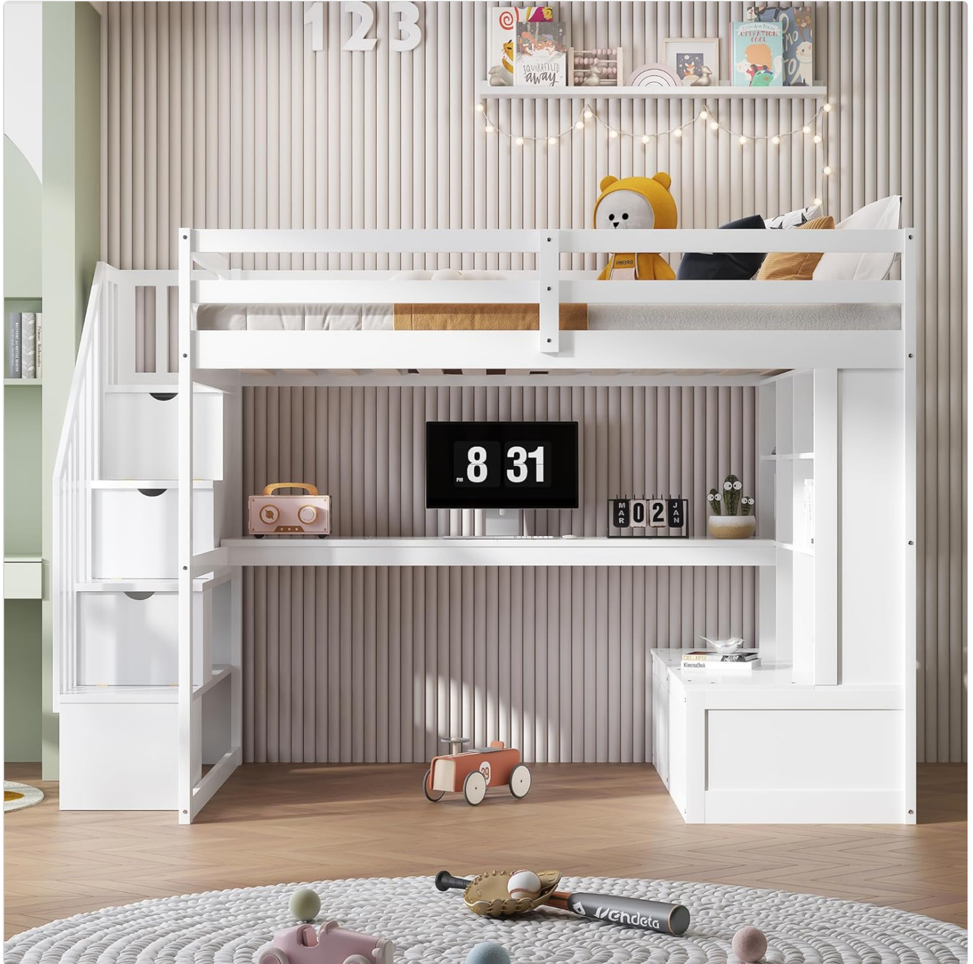
Image: Merax Loft Bed in use, showing the desk area with a computer and organized shelves.