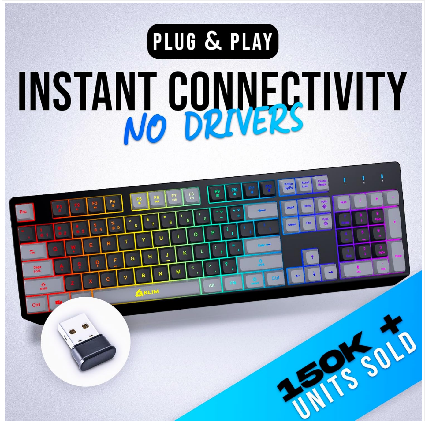
Figure 2: The keyboard offers instant plug-and-play connectivity via its USB receiver.