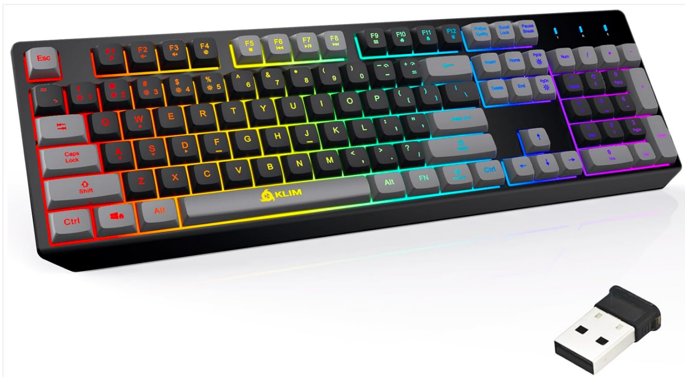
Figure 1: KLIM Chroma Wireless Gaming Keyboard and USB receiver.

The KLIM Chroma Wireless Gaming Keyboard RGB is designed for an optimal typing and gaming experience, offering instant connectivity, long-lasting battery life, and vibrant RGB backlighting. This manual provides essential information for setting up, operating, maintaining, and troubleshooting your keyboard.