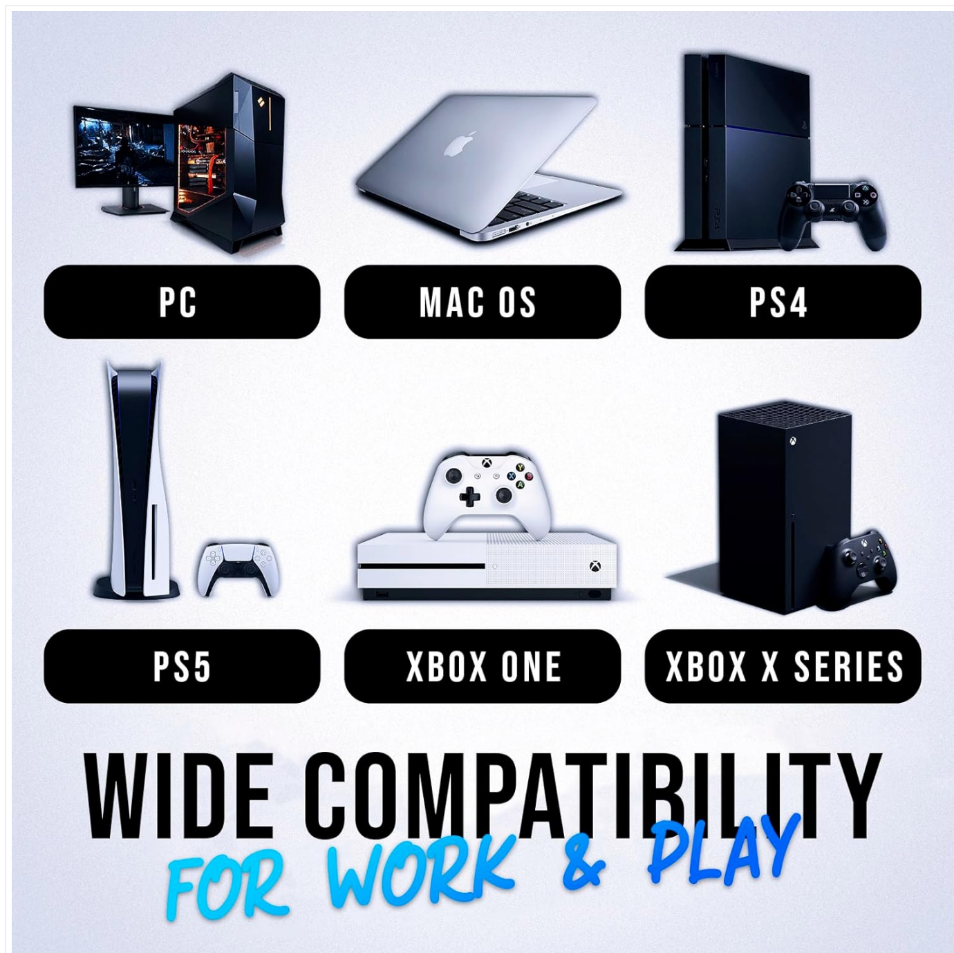
Figure 9: Wide compatibility across multiple platforms.