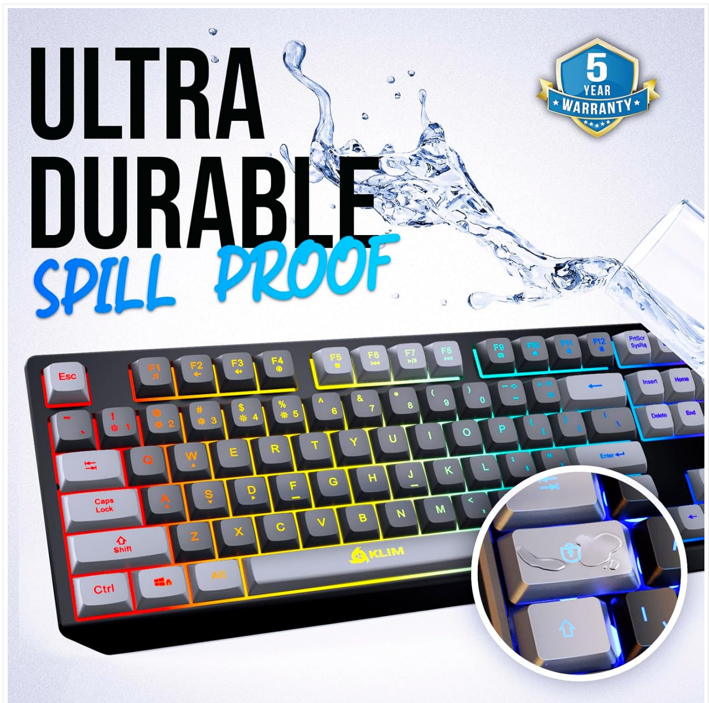
Figure 6: The keyboard is ultra-durable and spill-proof.