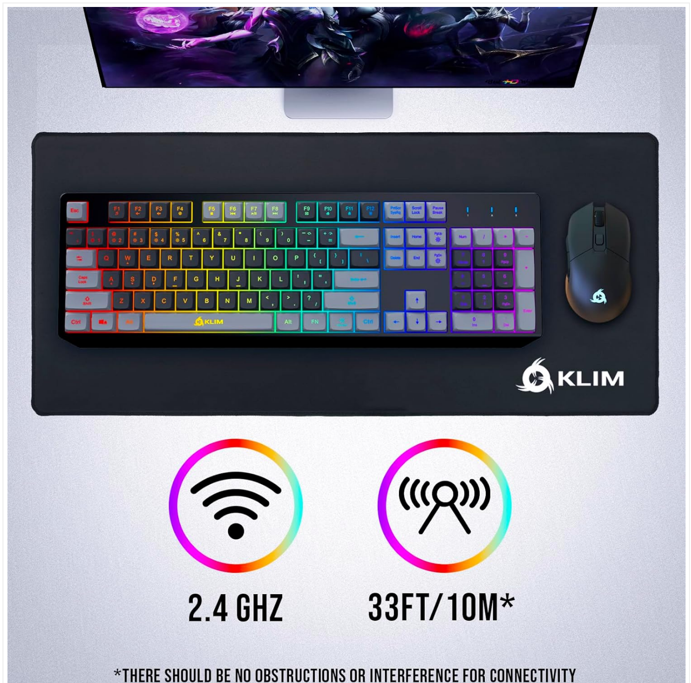
Figure 8: Wireless connectivity details including 2.4 GHz frequency and 33ft/10m range.