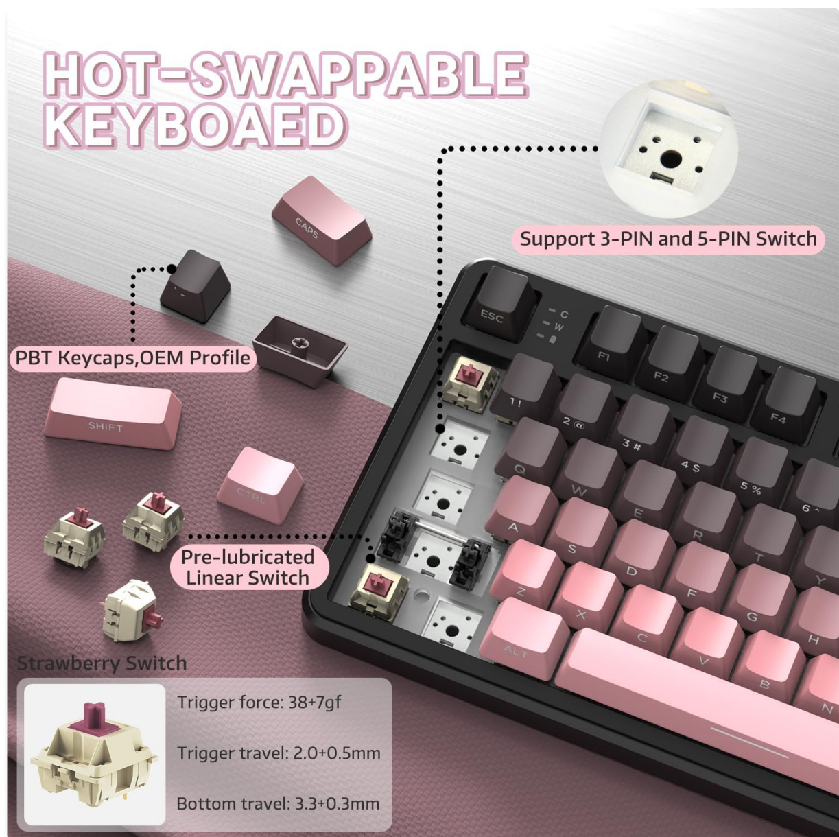
Figure 6: Hot-Swappable Switch Support (3-pin and 5-pin)

The keyboard also incorporates a gasket structure with five layers of sound-absorbing material, including PORON, to reduce noise and vibration, optimizing switch sound for a better typing experience.