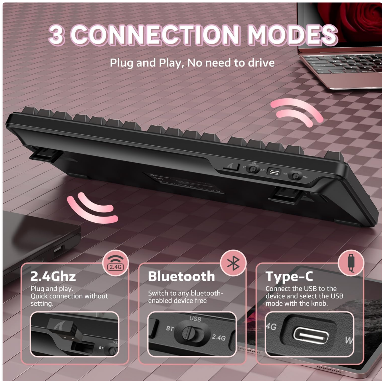
Figure 2: Keyboard with 2.4GHz, Bluetooth, and USB-C connection options highlighted.

A switch located on the back of the keyboard allows selection between connection modes (BT/USB/2.4G) and operating systems (Mac/Win).