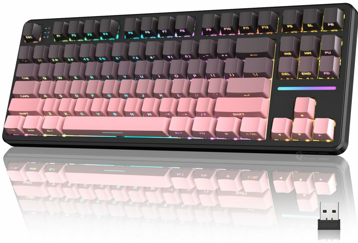
Figure 1: ATTACK SHARK X87 Wireless Mechanical Keyboard Overview