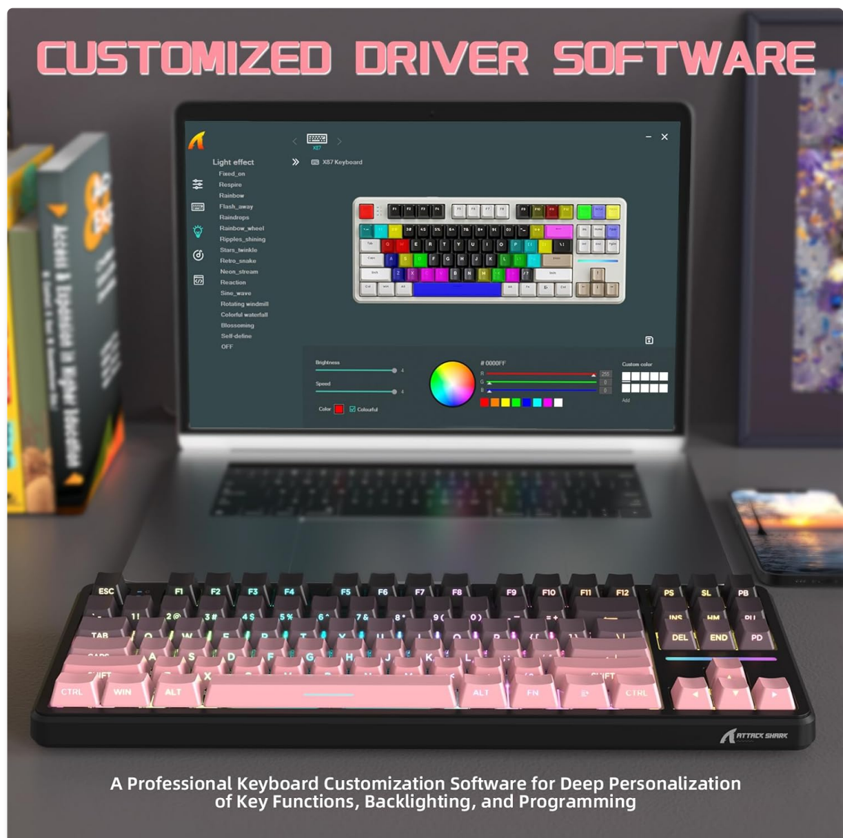
Figure 3: RGB Backlighting Controls and Effects

The keyboard features 15+ RGB lighting effects with over 16.8 million colors and 10 unique music rhythm lighting effects. Adjustments can be made directly on the keyboard or through the customization software.